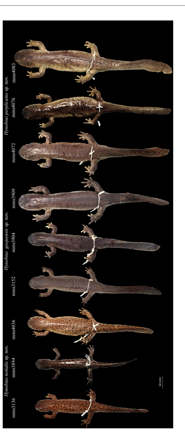
Figure S3. Paratypes for all Hynobius species described in this paper: H. notialis sp. nov., H. geojeensis sp. nov. and H. perplicatus sp. nov. The field ID is given above each individual. Details on measurements are given on Table 9.