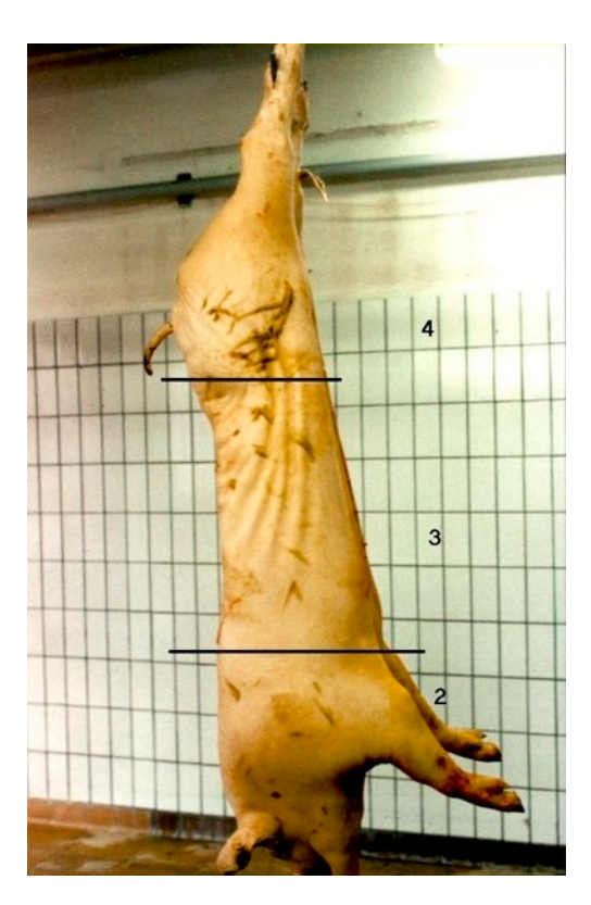
Figure 2. Scoring skin damage per part of the carcass, i.e., shoulder, middle and ham, starting at score 1 = no damage and 4 = extreme damage [14]. The lesions shows brown because this picture was made after singeing in contrast with the used skin damage scoring technique which was before singeing.

The ultimate score can be used to divide the carcasses in classes of acceptable and unacceptable skin damage [26].