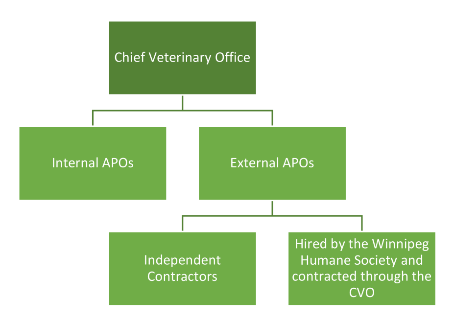
Figure 1. Types of Animal Protection Officers (APOs) in Manitoba.

There are different groupings of APOs. Internal APOs are direct, public, government employees. External APOs are contracted to undertake investigations. External APOs fit into two further categories: independent contractors and those who work for the Winnipeg Humane Society but are appointed by the CVO and focus on cruelty investigations (Figure 1). Under Canadian laws, independent contractors, even though they are people, are legally considered to be individual businesses that are under contract to another organization or business. As a result, APOs who are independent contractors are not legally classified as employees and are exempt from most labour laws and employment standards.