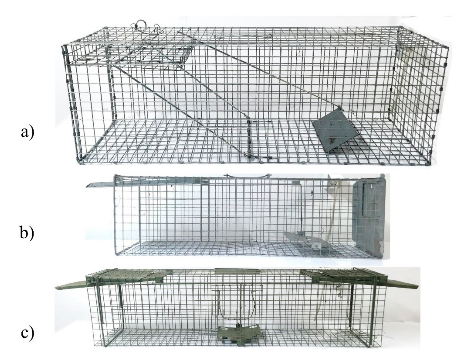
Figure 2. Types of live cage traps used in the study: ( a ) custom-made trap with internal wire securing the door; ( b ) trap with external wire securing the door and one opening ("Zielonołapka", Poland); ( c ) the tunnel-like trap with external wire securing the door and two openings ("Zielonołapka", Poland).

door (Figure 2). Four traps of the first type (Figure 2a) were of the same size (100 \times 40 \times 40 \text{ cm}) with one opening/door. The biggest trap of the second type (145 \times 31 \times 36 \text{ cm}) had one opening as well as three smaller ones (80 \times 21 \times 31 \text{ cm}) (Figure 2b). The last four traps of the second type had two openings/doors (Figure 2c) and were of the same size (110 \times 21 \times 31 \text{ cm}) . Observations during the first trapping season in 2016 showed clearly that cubs avoided entering the traps with two openings, which formed a kind of a tunnel. Thus, in the next two seasons one door in this type of traps was permanently closed.