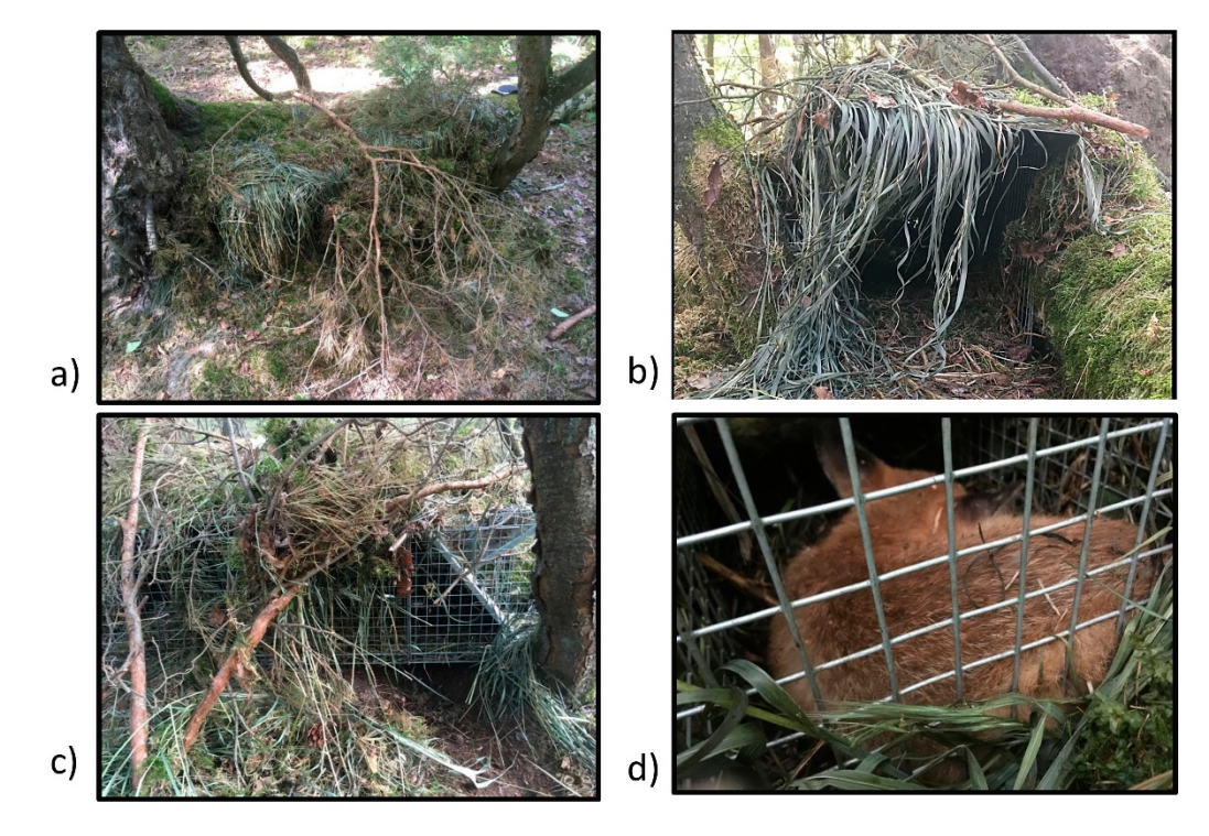
Figure 3. Live-capture cage trap set at the trapping site: ( a ) side view; ( b ) front view of a camouflaged trap; ( c ) the trap cover disturbed by cubs after attempts to reach the bait without entering inside; ( d ) trapped red fox cub inside the cage.

cases, the bait from the back of the trap was undisturbed and intact, but the presence of cubs was evident in the daily recordings from camera traps and/or appearance of fresh scats or tracks.