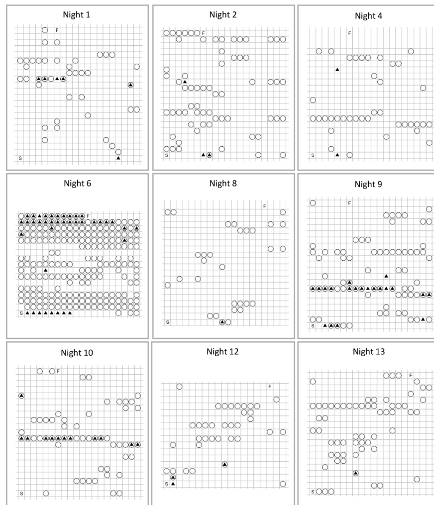
Figure 2. The movement states for one human-dog dyad across a selection of sleep periods (nights). These illustrations reflect a variety of movement patterns by dog and human when co-sleeping. For example, dog and human sleeping together with little movement (night 8); bouts of high level of dog movement with little human movement (nights 2, 4, 12, 13); and, high levels of dog and human movement (nights 6, 9). Each cell represents a 1-minute epoch, and should be read from bottom left of matrix to top right. Beginning of period indicated by S (start) and completion of sleep period indicated by F (finish). \square = no human or dog movement; \blacktriangle = human movement only; \bigcirc = dog movement only; \bigcirc\blacktriangle = both human and dog movement.