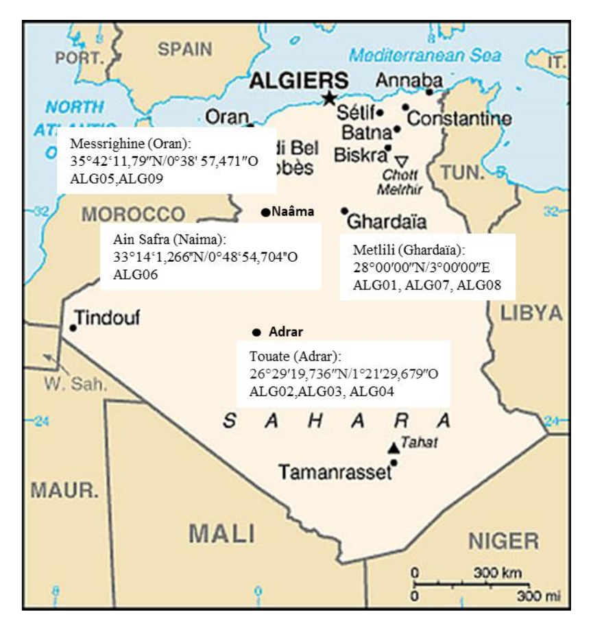
Figure 1. Map of Algeria showing sampling regions of Trichoderma isolates during 2015–2016 (Illustration source: https://www.google.dz/maps).

Nine strains of Trichoderma were isolated from rhizospheric soils using a dilution plate method. Soil samples were collected from agricultural fields located in different sites of south and northwest in Algeria (Figure 1). Each strain was cultured on a Potato Dextrose Agar (PDA, Difco) medium at 28 °C, and stored at -80 °C in a 20% glycerol solution.