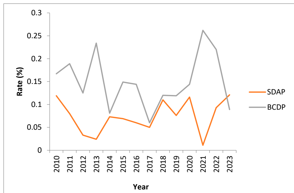
Figure 3. Combined positivity rates for SDAP and BCDP platelets over time.

Combined positivity rates for BCDP and SDAP range between 0.06% and 0.26% for BCDP (average 0.15%) and 0.01% and 0.12% for SDAP (average 0.07%). (See Figure 3). Rates are monitored monthly and significant increases have been investigated over the years with no clear identifiable root cause. Anecdotal evidence has directed us towards a potential association between increased rates of contamination with skin-flora-type organisms during the summer (warmer) periods.