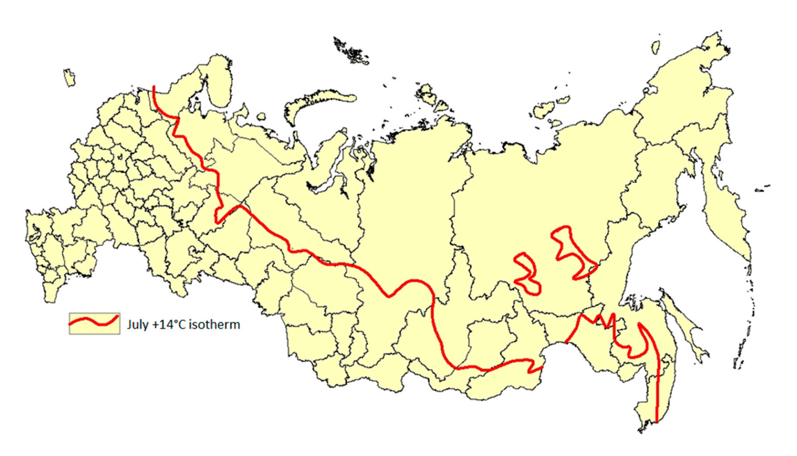
Figure 2. The theoretical northern border of the dirofilariasis range in the the Russian Federation.

It should be kept in mind that the parameters of a long-term annual average air temperature may serve only as guidance criteria. They cannot reliably characterize the conditions for a given year.