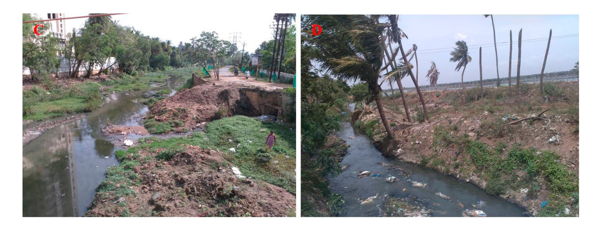
Figure 1. Photos show the direct discharge and impact of untreated urban effluents into the river streams and lake in the south Indian state of Tamil Nadu ( A ) river Noyyal (Tirupur); ( B ) river Vaigai (Near the Vaigai Bridge, Madurai city); ( C ) river Uyyakondan (Trichy); ( D ) lake Singanallur (Coimbatore). ( A – D ) photos were taken by Sivalingam in June–July 2017 (dry season).