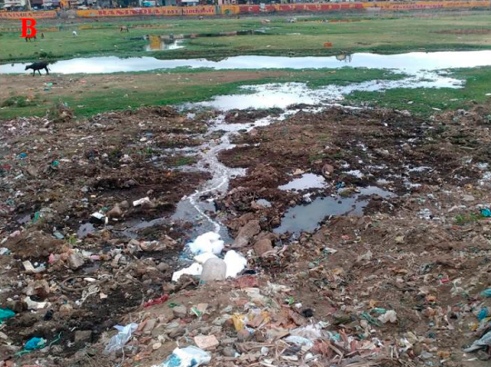
Figure 1. Cont.