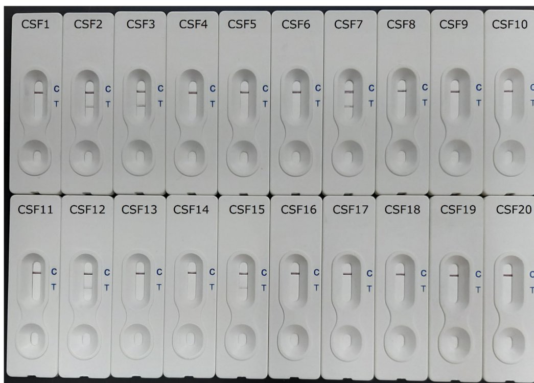
Figure 1. The AcAgQuick Dx detection results of 20 CSF samples from clinically diagnosed cases with positive immunoblot (antibody) test for angiostrongyliasis (CSF1–10), clinically suspected cases with negative immunoblot test (CSF11–15), and CSF samples with positive immunoblot (antibody test) for gnathostomiasis (CSF16–17), and with ELISA-positive cases of Taenia solium neurocysticercosis (CSF18–20). The appearance of a red band at the T line and a red band at the C line indicates a positive sample for the detection of the specific 31-kDa Angiostrongylus cantonensis antigen (CSF2, 3, 7, 12 and 15), whereas the absence of a red band at the T line and appearance of a red band at the C line indicates a negative sample (CSF1, 4, 5, 6, 8–11 and 13–14 and 16–20).

Likewise, two (CSF12 and CSF15) of the five CSF samples from cases with clinical features of infection, but which were negative for Angiostrongylus cantonensis -specific antibodies, also displayed a positive AcAgQuick Dx test (Figure 1). Within the set of 27 patient sera with serologically confirmed Angiostrongylus cantonensis infection, four (Ac-7, Ac-15, Ac-22 and Ac-25) showed a positive reaction via AcAgQuick Dx , with visible pink bands at the T region (Figure 2). No positive AcAgQuick Dx reaction was observed in the other 23 sera with angiostrongyliasis. In cross-reactivity testing, all the 5 CSF samples and the 78 sera from gnathostomiasis (CSF = 2; serum = 13), toxocariasis (serum = 2), filariasis (serum = 5), trichinellosis (serum = 2), hookworm infection (serum = 4), cysticercosis (CSF = 3; serum = 9), paragonimiasis (serum = 2), opisthorchiasis (serum = 3), and malaria (serum = 3), as well as the 35 normal control sera from parasite-free individuals, were all negative for AcAgQuick Dx .