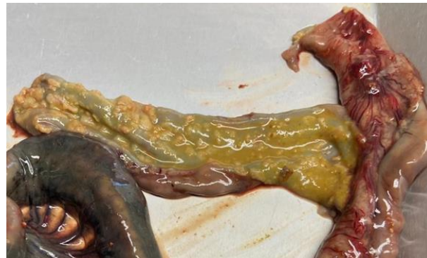
Figure 2. Pig affected by salmonellosis ( S. Typhimurium ). Necrotic enterotyphlocolitis with diphtheritic membrane on the mucosal surface.

in addition to that, stressful conditions for the animals, e.g., commingling, transport, diet change, and lairage can increase shedding [69,70]. A few pigs may remain chronically wasted, and some may show obstipation and marked distension of the abdomen. This condition is described as a consequence of rectal strictures due to defective healing, with fibrosis, of ulcerative proctitis caused by S. Typhimurium [30]. Necrotic enterotyphlocolitis is the most consistent gross lesion in pigs suffering from S. Typhimurium . The lesions are mainly recorded in the ileum, cecum, and spiral colon, with the formation of diphtheritic membranes on the mucosal surface and roughened mucosa with a granular appearance. Systemic dissemination and septicemia are rare [68] (Figure 2).