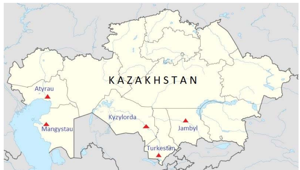
Figure 1. Camel sampling sites in Kazakhstan.

In 2020–2021, 249 blood serum samples were collected in the Turkestan, Mangystau, Jambyl, Atyrau and Kyzylorda regions that represent 86.4% of total camel population of Kazakhstan. (Figure 1). The age of camels ranged from 1 to 15 years. Camels under three years old were considered juveniles (Table 1).