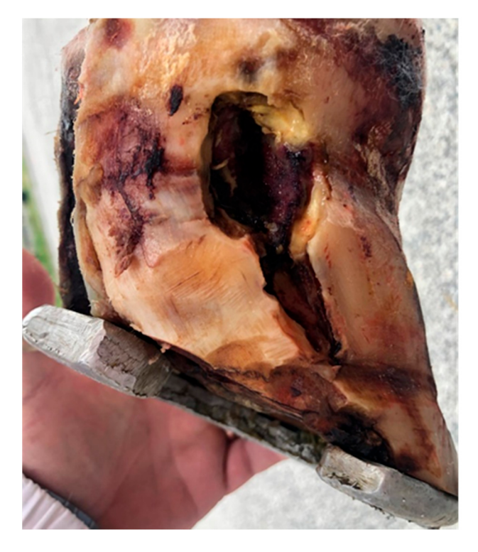
Figure 3. Second surgery: extensive debridement of the hoof crack.

The horse was premedicated with acepromazine (20 \mu g/kg IM) and sedated with medetomidine (7 \mu g/kg IV); general anesthesia was induced with ketamine (2.2 mg/kg IV) and diazepam (0.06 mg/kg IV) and maintained with isoflurane and a constant rate infusion of medetomidine (3.5 \mu g/kg/h IV). A cleansing and extensive debridement of the crack (Figure 3), with a loco-regional cephalic perfusion with 2 g of cefazoline, was performed. A foot bandage was applied and changed at 2 to 3-day intervals.