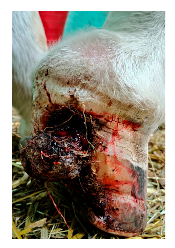
Figure 1. Lateral aspect of the right forelimb hoof with a bleeding full thickness vertical quarter crack and an exuberant mass protruding from the hoof crack. The mass was brown in color and had a nut-shape with hard and rough consistency.