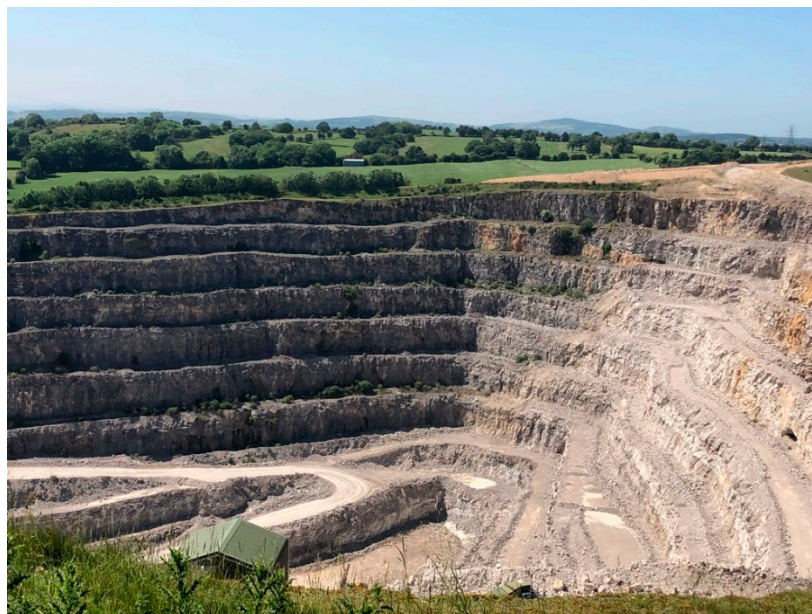
Figure 3. Pant-y-Pwll-Dwr limestone quarry, Halkyn Mountain.

Although much of the common land is owned and managed by the Grosvenor Estate, around 200 properties are registered as having ancient commoners' rights on the Halkyn Mountain Common. The majority of grazing rights relate to the keeping of sheep—some 1500 of them roam on rough, unploughed and unfenced pasture, although grazing rights also exist for cattle, goats, horses and poultry. The common land has been managed traditionally for livestock grazing all year round, and the graziers are organised through the Halkyn Graziers and Commoners Association, while the