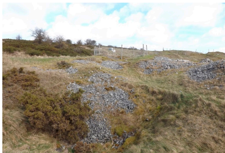
Figure 2. Old lead mine shafts and workings, Halkyn Mountain.