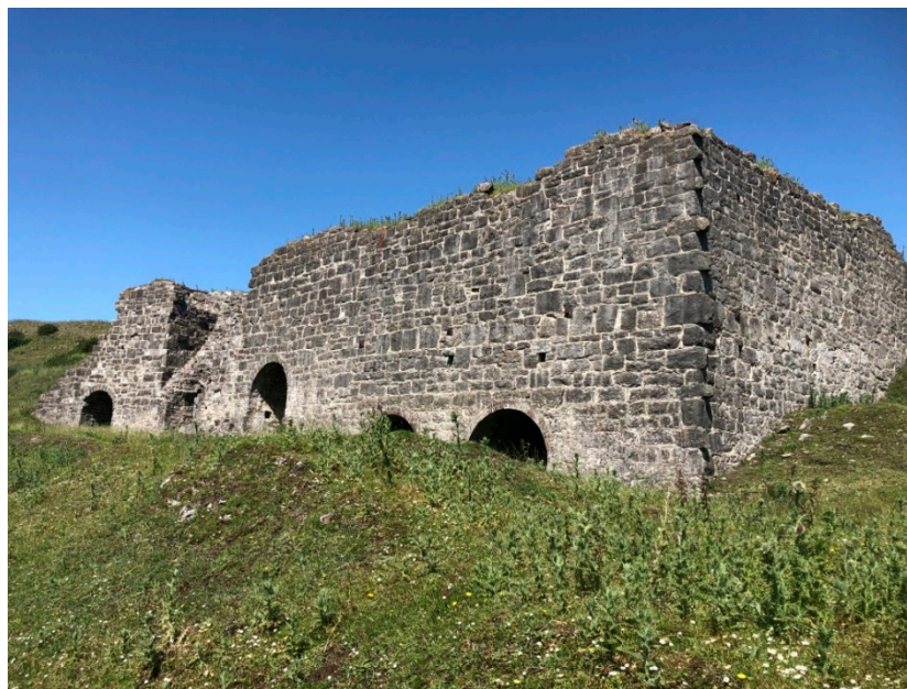
Figure 4. Waen-y-Brodilas limekilns, Halkyn Mountain.