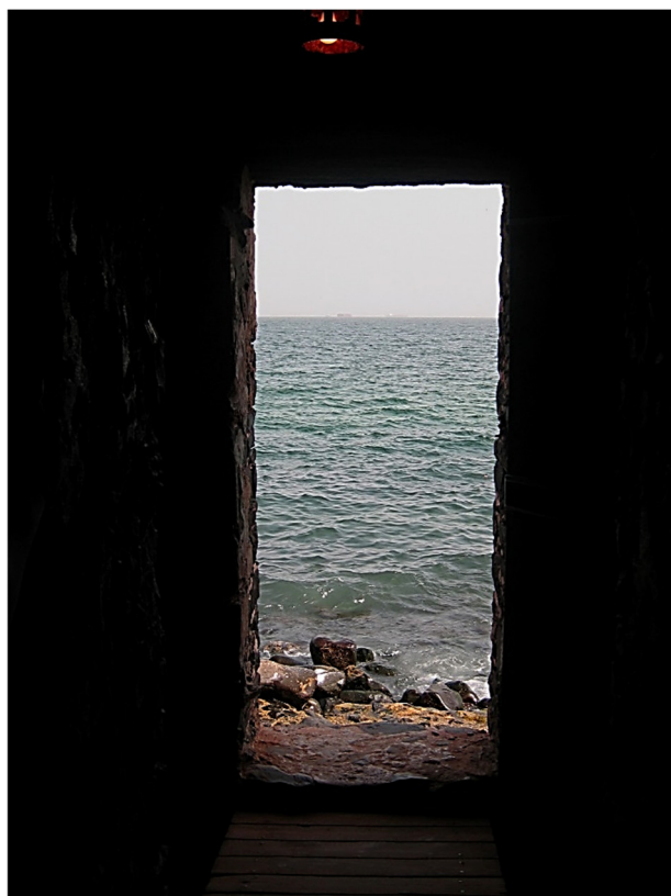
Figure 4. “The Door of No Return” (La Porte du Non Retour de la Maison des Esclaves).

When I was twenty, I left Senegal; that was in 1998. For the next ten years, I lived in France. It is curious how living elsewhere allows one to see one’s home place differently. I tell my students (yes, I teach now) that it was at a public exhibition in Nancy, France, that I learned how large a rhinoceros is and how tall a giraffe can be. Did I have to leave Africa in order to see it? (It is almost as if we are blinded and numb to the everyday world: In order to see truly, we have to see differently.) During those ten years spent in France, I returned to Senegal three times, each for very short periods. And during none of those brief visits did I feel the need to go back to Gorée Island.