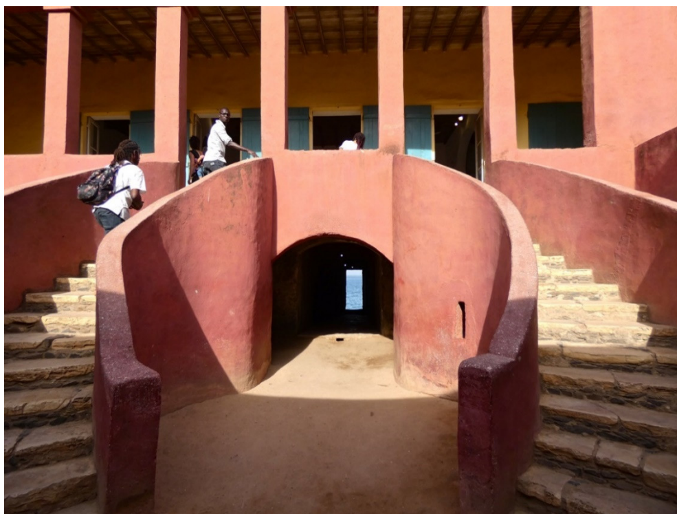
Figure 2. The House of Slaves ( la Maison des Esclaves ), Gorée Island. Note the “Door of No Return” in the lower level.

I need to add, however, that it is not the story but the image of a doorway that haunts my personal experience of growing up Senegalese. This essay is not about storytelling in words alone. It is about the confluence of verbal and visual rhetorics—of the ways that the African slave trade “dwells” in places visualized as well as in language and memory. Popular media is implicated in this unleashing of the story of Gorée Island. While popular media like films and poster advertising (even advertising as a government-sponsored public service) “give visual presence” to the place I shall be discussing, these are not, in themselves, transparent mediums of communication. They introduce their own distortions, prejudices, idealizations, and partial truths. I shall argue that, yes, visual images have an important role to play in introducing the slave trade to contemporary audiences (African and non-African alike); but these need the supplement of texts. Most important, of course, is to visit the place: to bear witness to it, seeing and feeling it for oneself.