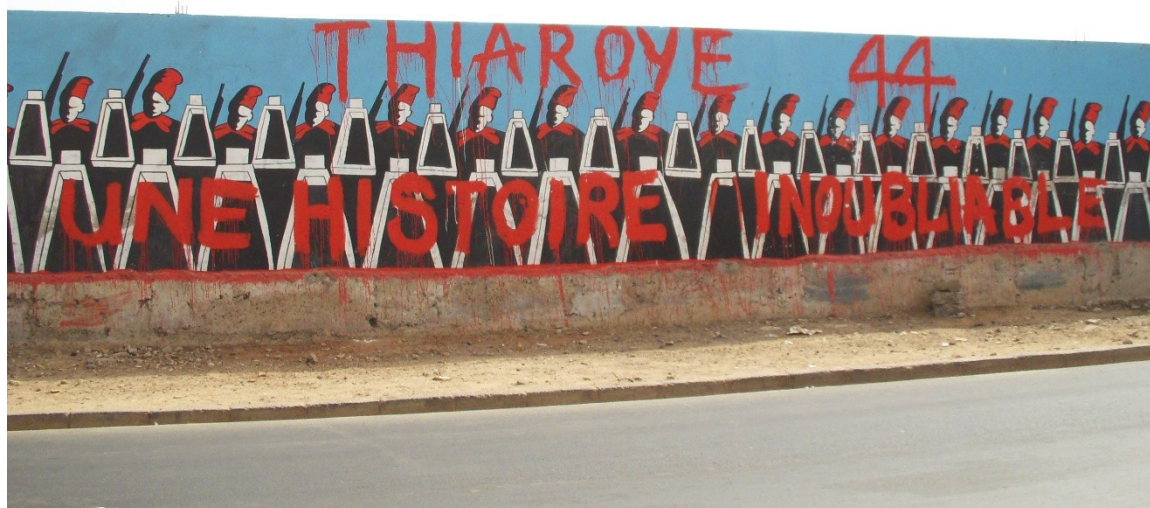
Figure 5. “Thiaroye 44: Une Histoire Inoubliable.” Street Mural in Dakar.

When I was growing up, no one talked about Thiaroye . The massacre took place on the first of December, which so happens to be the day in which I am penning this paper. As I write, what surprises me is the seeming lack of interest shown by the postcolonial Senegalese government; it is as if they wanted to forget. The French government’s lack of interest is not surprising; in fact, the French did their best to ignore, deflect, deny. The general public did not learn of this massacre until 1988, when Senegalese Cineaste released Sembène Ousmane’s film, Camp de Thiaroye (Sembène 1988). The film was immediately banned in France and remained so for seventeen years, until becoming available on DVD in 2005. Here, indeed, we see why we need more films written, directed, produced, and performed by Africans (Senegalese especially). Again, as Baumlin and Meyer (2018) remind us, we need to speak, in order to be heard, in order to be seen: Such is an assumption of rhetorical ethos. And the reverse may be true, too: Sometimes we need to see (or be seen), in order to know what to speak and how to be heard. (See Figure 5)