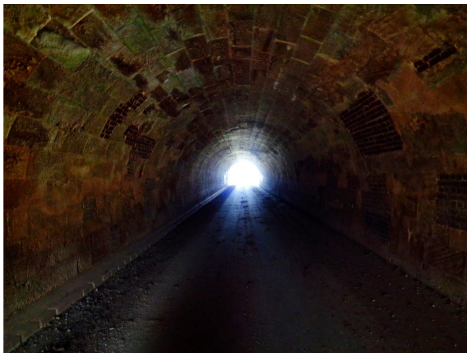
Figure 9. “Light at the End of the Tunnel.”