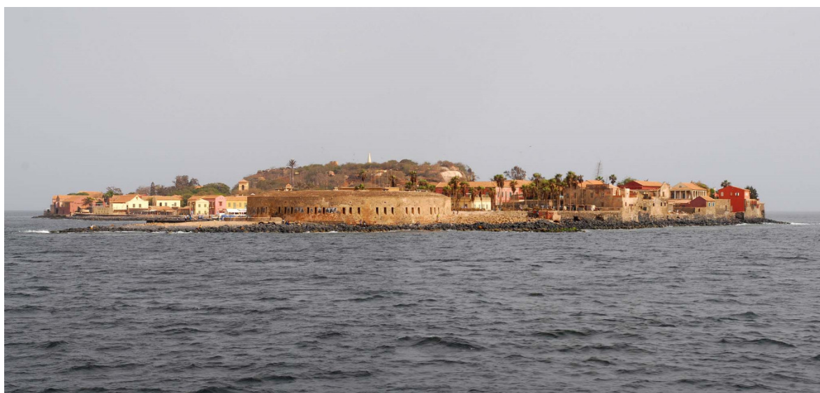
Figure 1. Ile Gorée, Senegal.

I shall be telling the story of my coming to terms with a sad chapter in Senegalese history: specifically, the African slave trade, how I learned about it, and how my understanding of it—as well as of myself as Senegalese—has evolved. My own ethos is defined, in large part, by the collective memory of slavery imposed upon Africans. And I shall be focusing on a specific place where this slavery was imposed: Gorée Island, whose House of Slaves led to the Door of No Return. (See Figure 1) For “Ethos,” as Nedra Renolds writes above, “is created when writers locate themselves.” Ethos, in other words, adheres to places as well as to people. If “a person without a past is incomplete,” then I would add that a person’s “past” is inconceivable without a “place.” The places of one’s wounding—individually and collectively, historically and contemporaneously—are infused with the actions and adhere to the victims both in body and in memory.