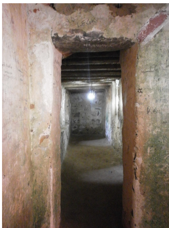
Figure 3. Passageway to Prisoners’ Cells ( Cellules, Maison des Esclaves ).

Two years later, I had a chance to go on a group trip to Gorée Island. Lying some 5.2 km west of Dakar, Gorée Island was the largest slave-trading centre on the African coast, containing such monuments as the House of Slaves and the infamous Door of No Return. Our brief visit was not meant to be educational so much as it was a school “merit badge,” a way of saying “we’ve been there.” We had not even registered for a proper tour of the House 1 . I enjoyed the ferry ride but the place—not so much. Being claustrophobic, I had an excuse for not entering the narrow passages leading to low-ceilinged prisoners’ cells (see Figure 3). I did not want to know that as many as twenty human beings were stuffed into rooms twelve metres deep and twelve metres wide, not knowing where they were going and what was happening to them (N’diaye 2006). Just glancing into them made my blood freeze. Even today, I can still feel the sensations of suffocation. As for the Door, it seemed like a portal to a black hole in space, leading nowhere (see Figure 4). Two years earlier, I did not want to hear about it (or talk about it); now, apparently, I did not want to see it.