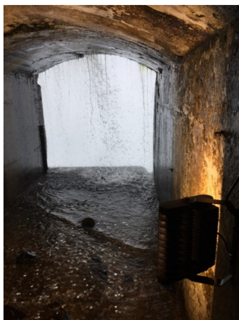
Figure 8. “Behind Niagara Falls”.