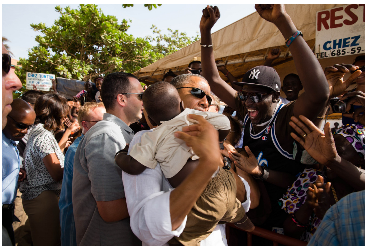
Figure 10. Barack Obama Greeted by Gorée Islanders. (Official White House photo by Pete Souza).

I find hope in the BBC News article cited above, but also find it a bit optimistic: In these many respects, Gorée remains a work-in-progress. Though its role in the slave trade is regularly questioned by some, there have been moments of formal commemoration. In 1944, the colonial administration listed Gorée as a historic site. It was placed on Senegal’s National Heritage List in 1975 and on the World Heritage List in 1978 (BBC News 2007). And foreign dignitaries have come to pay their respects, none more welcome than the 2013 visit of U.S. President Barack Obama and his wife Michelle (see Figure 10). Current ordinances regulate new construction, ensuring that historic sites are well preserved and protected. There are no private automobiles. With its colonial-style buildings, rural flavor and lack of traffic noise, crossing the ocean to Gorée feels like crossing a time barrier—quite the opposite of Dakar, the busy, noisy, hectic capital city of Senegal.