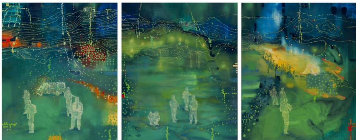
Figure 3. Jon Cattapan, Night Figures (Gleno) , 2009, oil and acrylic on linen, 180 × 250 cm. Private Collection.

This foreboding mood informed the cycle of paintings made on his return to Melbourne. The large and highly significant triptych, Night Patrols, Maliana (2009), is a compendium work that conflates many of the patrols and nocturnal places into something of a spectral gathering. We see similar pictorial concerns addressed in the triptych Night Figures, Gleno (Figure 3). 'The paintings in this series,' one reviewer wrote, 'are imbued with notions of anxiety and surveillance, and evoke in the viewer feelings of voyeurism and invasion of privacy.' The soldiers are observers but are also being observed. As they roam the benighted villages they too are being scrutinised and followed by unseen eyes. Luminous and larger than life, the soldiers seem at odds with the unfamiliar land, with its uncanny vivid greens and tracery of dots and lines. Every effort at integration and communication seems to be frustrated by their very alien presence, accentuated by their virulent painterly difference (Green et al. 2015, pp. 168–73).