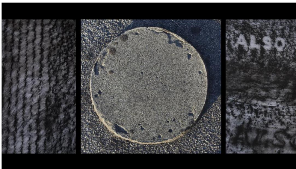
Figure 8. Paul Gough, Stoneology no. viii , 2017, charcoal, photo-montage and collage, 40 × 120 cm.