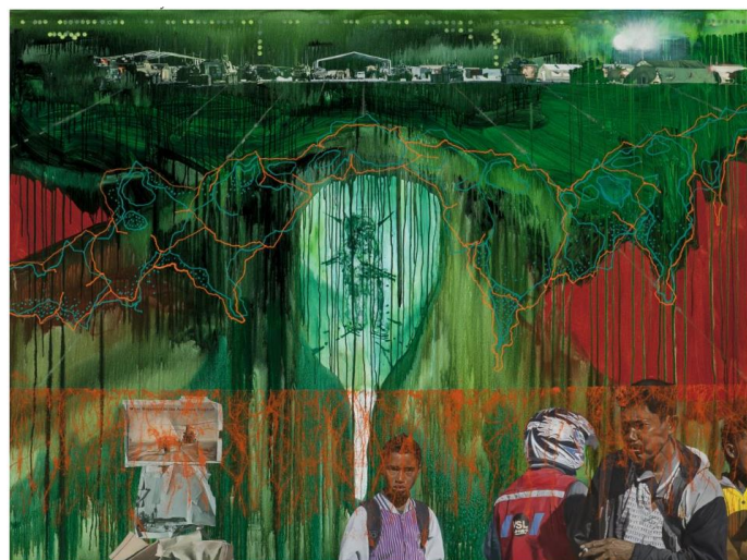
Figure 5. Lyndell Brown/Charles Green and Jon Cattapan, Spook Country (Maliana) , 2014, oil and acrylic on linen, 185 × 250 cm. Private collection.