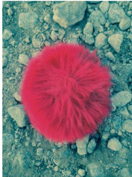
Figure 1. Pompom sea anemone on Car Park Beach.

the ground. Then, eventually, I head off again, loop back on myself, and edge my way between the cars rather than following the more direct path, abandoning the supposedly 'time-saving' orientation of a rat-run. The terrain itself is so familiar that I do not particularly feel the need to watch out for obstacles, and most of the time, I do not look up.