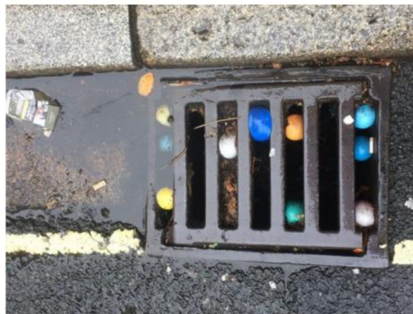
Figure 14. Plastic balls in Liverpool drain.