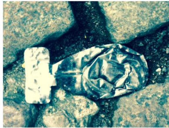
Figure 15. Heroin spoon on Car Park Beach.

What, then, do we know of streetcorners, of curbstones, of the architecture of the pavement—we who have never felt the street, heat, filth, and the edges of the stones beneath our naked soles, and have never scrutinized the uneven placement of the wide paving stones with an eye toward bedding down on them (Benjamin 1999, p. 851).