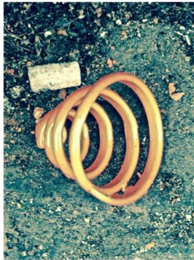
Figure 13. Plastic spiral on Car Park Beach.

refracted, composite nature of Varda's storytelling. Her filmic version of spatial bricolage effectively fractures and deflects the flow of the shorescape and parodies the idea that beaches are places to 'reflect' upon who we are. Rather than seeking a vantage point that allows us to project emotion outwards onto the sea's vastness, Varda turns her attention downwards and backwards. She eschews the rhetoric of 'magnetic' oceanic horizons, and in several scenes, she directly turns her gaze away from the waves, walking backwards along the shore. Littoral space is reconfigured as inverted and helical. (See Figure 13).