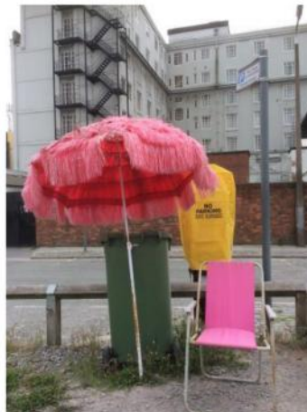
Figure 16. Parking bay suspended on Car Park Beach.

Conflicts of Interest: The author declares no conflict of interest.