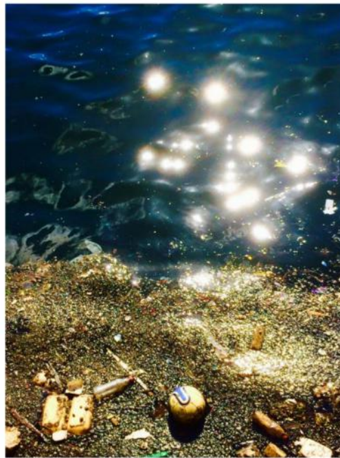
Figure 4. Flotsam and Jetsam in the Mersey.

My walk across Car Park Beach is familiar and predictable, yet also shaped by the rhythms of daydreaming and distraction (cf. Lefebvre 2004 ; Edensor 2005 ). So, as I repeat these manoeuvres (getting later and later for work each time), my shortcut takes on certain ritualistic qualities—forming itself into a paradoxically routine dérive (or—equally oxymoronicallly—a fûgeur ’s commute). Maybe I can make sense of this seeming contradiction of wandering or drifting around a ‘predictable circuit’ by thinking of it as a refrain ? For Deleuze and Guattari, the refrain—exemplified by birdsong—is ‘a territorial assemblage’ and ‘always carries earth with it.’ ( Deleuze and Guattari [1978] 2013 , p. 363). Or put another way, the refrain ‘marks territory’ by drawing together action and sensation with the ‘stuff’ of environment.