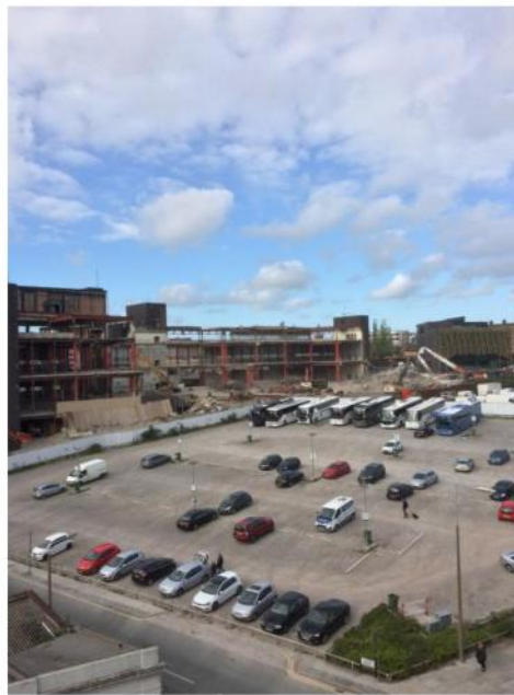
Figure 3. Car Park Beach.