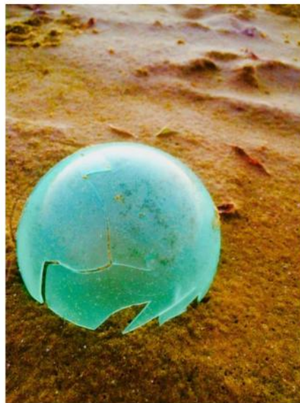
Figure 6. Plastic on Hoylake Beach.

This account of plastic flotsam and jetsam draws attention to the reversibility of Iovino's trope of 'visible absence', not least because Sprackland's 'sobering moment' of ecological revelation is triggered after an unusually high spring tide by the sight of 'the beach (washed) clean and shining'. She describes 'a glorious day in March' when she finds that 'the mass of accumulated debris I'd seen there the week before was gone. The sea had swallowed it again.' (Sprackland 2012, pp. 117–18). When the tide performs its apparently magical vanishing trick, what should be a narrative of nature's capacity to renew itself is read by Sprackland as a different kind of story altogether. In other words, it is the very evanescence of waste—its absent visibility —that haunts her: 'I understood then that for the bottle and the laundry basket, the clothes peg and the doll, the petrol can and the chocolate wrapper, this is a story with no end' (Sprackland 2012, pp. 117–18) (see Figures 6 and 7).