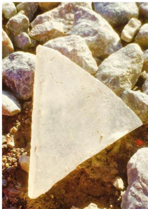
Figure 2. Perspex shard on Car Park Beach.