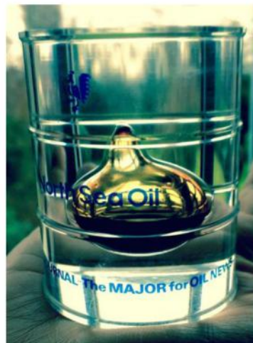
Figure 9. North Sea Oil paperweight.

I coveted the Perspex BP paperweight on my father's desk, which contained a teardrop of North Sea oil (see Figure 9).