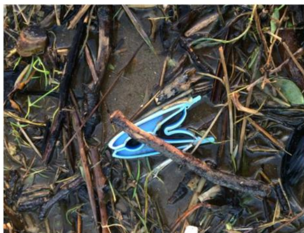
Figure 7. Clothes peg on Hoylake Beach.