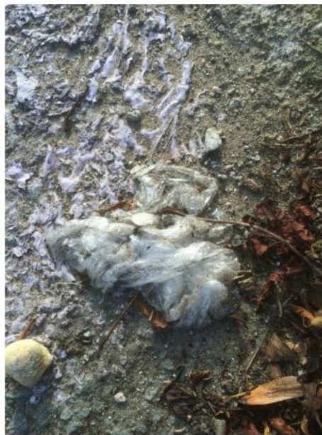
Figure 5. Clingfilm on Car Park Beach.

Car Park Beach is full of ghosts. Phantoms appear in the form of plastic bags or pareidolic milkshake lids (Lee 2016), and there are even streaks of Clingfilm ectoplasm sticking to the shingle (see Figure 5). There is also something a little ghostly about the swash and backwash of my repetitive commutes. Perhaps my 'desire lines' are leaving vapour trails, my movements dissolving back into the surface of the car park. According to Tim Edensor, 'mundane haunting' is constituted through 'the rhythms of domesticity' and 'regular practices . . . sedimented in neighbourhoods' (Edensor 2008, p. 326). I have a feeling that my actions too are leaving sediments. I am re-tracing my steps along previous strandlines.