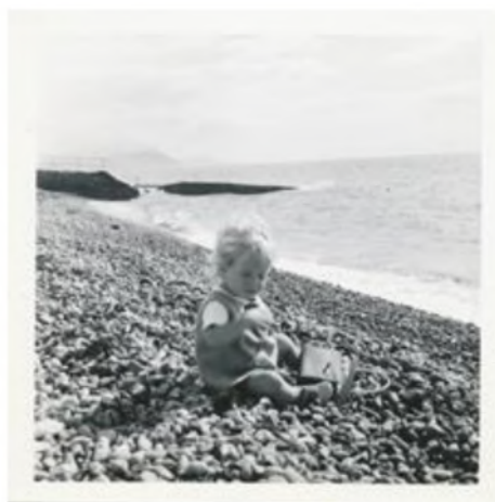
Figure 12. Author beachcombing.

In her 2008 film, Agnès (2008), the filmmaker Agnès Varda uses a language of beaches to tell stories about her past life, and it is tempting to do the same here—to reimagine my own personal history as a series of ghostly beaches (see Figure 12). But Car Park Beach is not a memoir, and Les Plages D'Agnès is not a straightforward autobiography (cf. Taussig 2006). Much of Varda's recent work is shaped by techniques of both temporal and spatial bricolage. For her, bricolage is a 'work of unbounded creation' (Winston et al. 2017, p. 131), and whether she takes on the mantle of beachcomber or gleaner, she celebrates a poetics of making do , of picking over the leftovers ('beaux-restes'). Rather than rendering disparate elements coherent, as Lévi-Strauss's idea of the 'bricoleur as engineer' might suggest, (Lévi-Strauss 1962, p. 11) Varda as bricoleur (or bricoleuse?) uses collage-like methods to create digressive, discontinuous narratives: her version of bricolage often seems to be less about stitching or sticking together and more about unravelling .