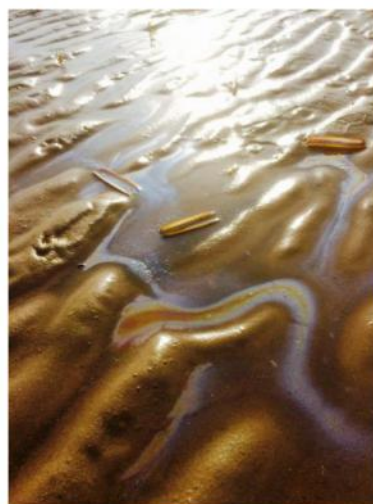
Figure 10. Oil traces on Hoylake Beach.

These days our beaches are more likely to be pockmarked with nurdles than tar (Guins 2009). But on Car Park Beach the shingle still glistens with patches of oil, leaked from the underbellies of cars and coaches (see Figures 10 and 11).