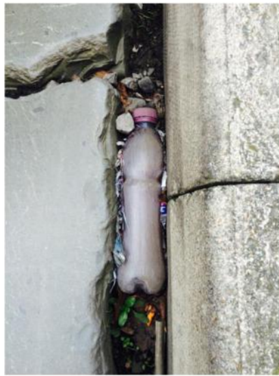
Figure 8. Plastic bottle buried in pavement.

‘When I look for the hyperobject oil, I don’t find it. Oil is just droplets, flows, rivers and slicks of oil’ (Morton)