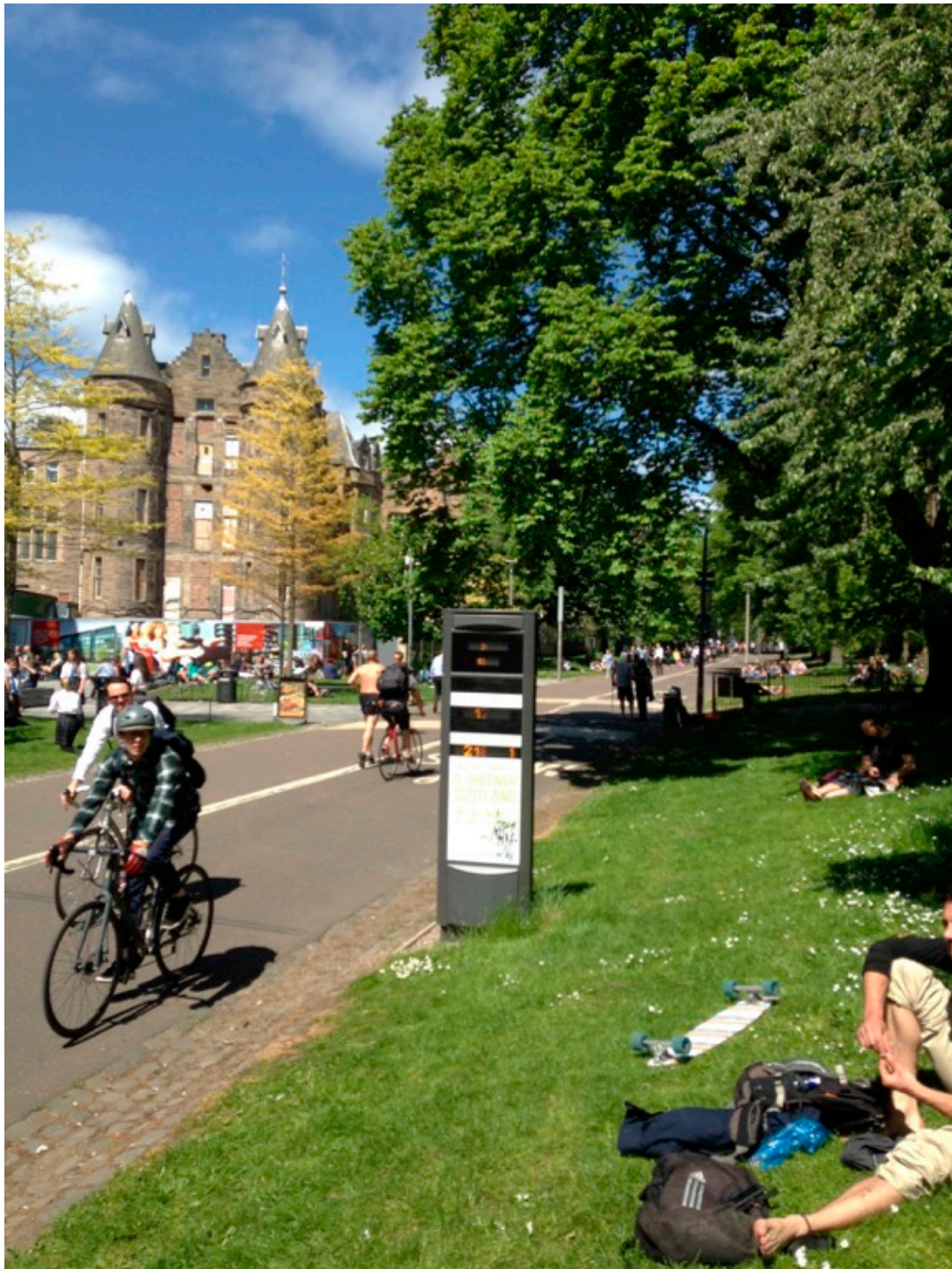
Figure 5. Cyclists and pedestrians utilizing the Middle Meadows Walk. Note the designated cycle lane and bicycle counter (Photo by G.L. Buckley, June 2016).

Another member of the 2017 group stated: “Being in Scotland I experienced a different kind of planning while learning about more sustainable ways of thinking.”