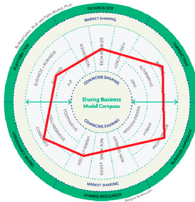
Figure 2. SBMC applied to Airbnb.

The technology and shared resources dimensions are only descriptive, and their parallel choices have no effect on business model orientation. When we draw the lines for each model, we can see clear differences between them. One is very close to the market model (Figure 2), while the other one (Figure 3) is very close to the commons sharing model.