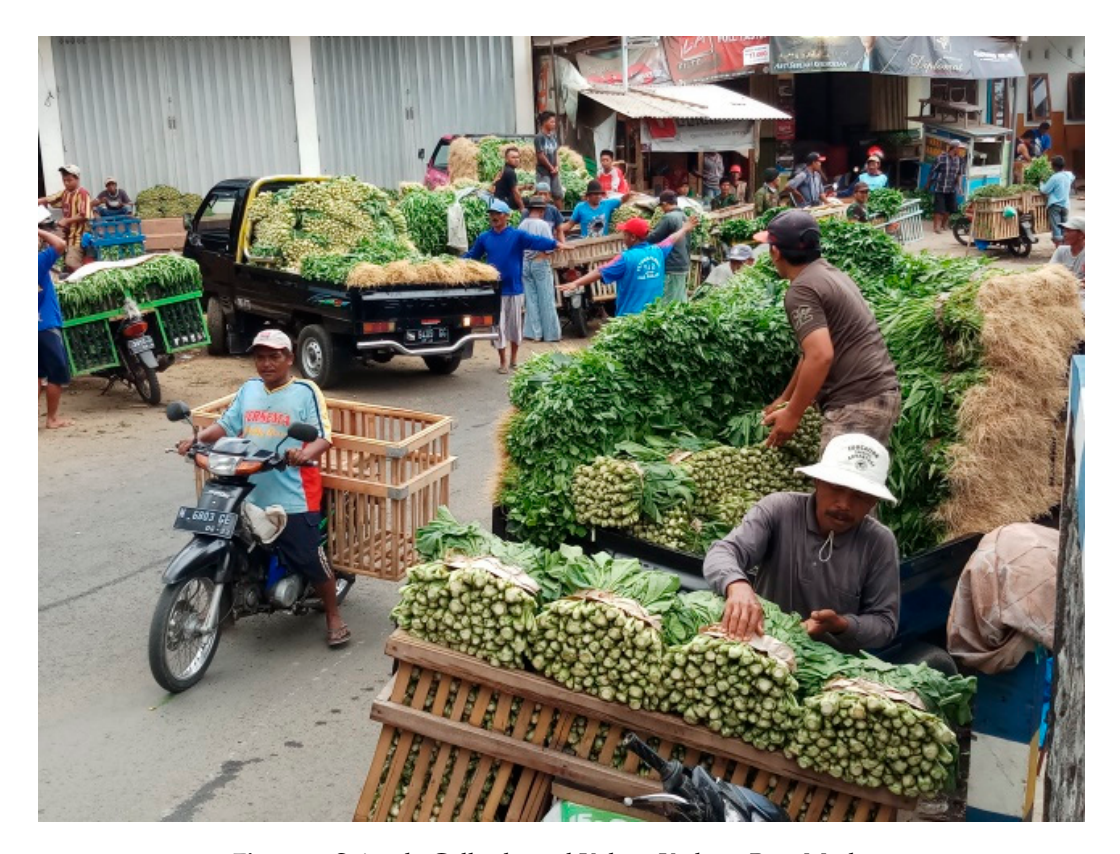
Figure 2. Spinach, Collards, and Kale at Kedung Boto Market.