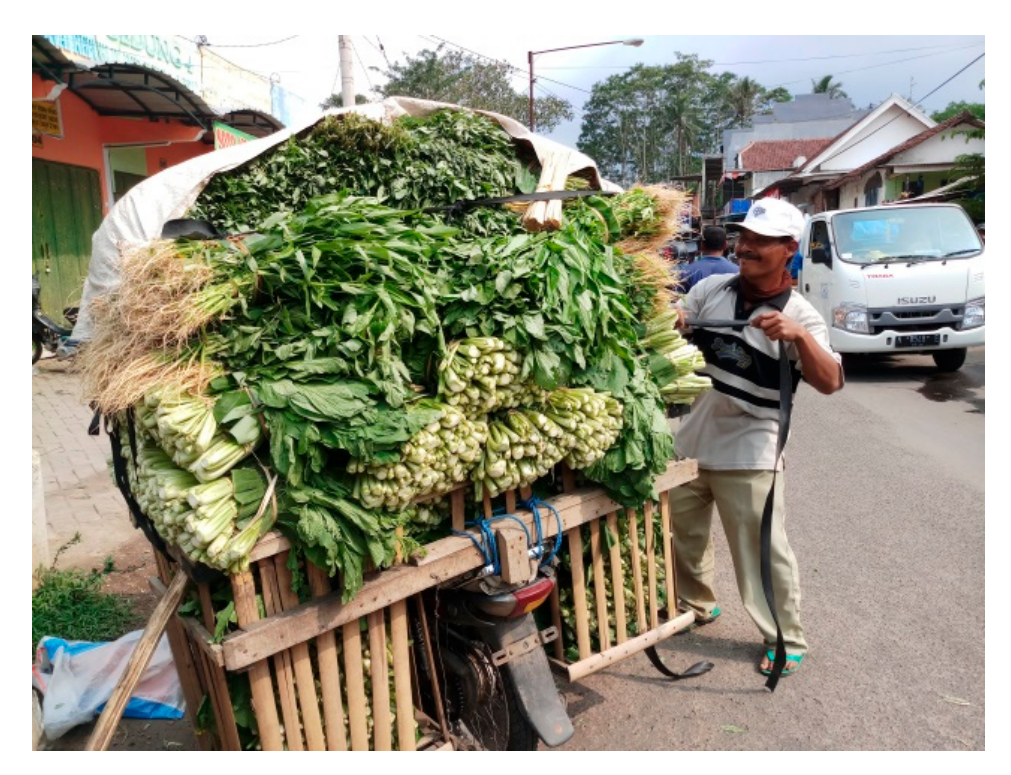
Figure 3. Modified Motorbike.

Because vegetable sources are rarely close to the market, the transportation tool also makes it easier for them to return and serve farmers offering fresh vegetables. A collector can go back and forth three times to carry goods. Cheap modification fees and low tax costs support these traders to change their transportation capital from the car to the modified motorbike. In addition, the splendid parking area in the traditional market area is natural in Indonesia, so the use of modified motorcycles is very important because it does not require too much parking space. The efficient and practicality are the main reasons for actors to use modified motors in response to poor and narrow road conditions, narrow harvest area, high mobility, to ensure accumulatively increasing institutional market efficiency. According to (Zant 2015) findings where transportation modes affect market prices so that transportation plays an important role in increasing efficiency.