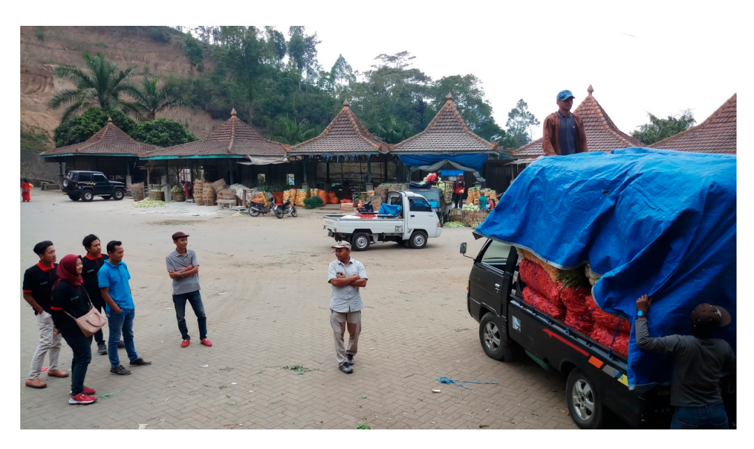
Figure 4. State promoted market activities.

One way to increase market efficiency is by reducing the potential transaction costs that arise in all transactions on the market (Jacques et al. 2018; Williamson 2010). The efficiency of transaction costs is carried out by minimizing expenses in the transaction process, such as loan interest, labor, and the cost of the scales. Transaction costs, such as parking fees, scales fee, and security costs are relatively inexpensive compared to the state-promoted market fees. The only fee is the regular payment to the village administration to be paid by the wholesalers. The small cost of the transactions has become one of the traditional market advantages compared with a state-promoted market, which has sets of charges for traders. Traditional market managers are very concerned about this problem because they realize that too many levies imposed on actors as extra expenses, the market will lose customers. On state promoted markets, formal and informal levies, such as tax, parking, and renting a place, often occur because local governments need tax revenues (Figure 4).