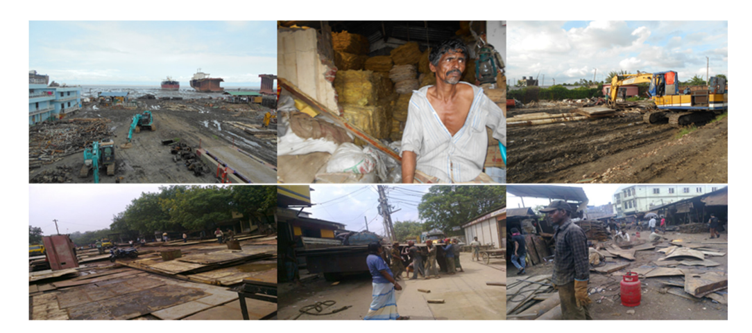
Figure 1. Shipbreaking yard with grab ( top left ), glasswool shop in Bhatiraty ( top middle ), magnetic grab carrying small sections for loading ( top right ). Shipbreaking scrap business in Dhaka city ( bottom left ), workers carrying plate in shoulder in Dhaka city ( bottom middle ), Cutters working in Dhaka city ( bottom right ). Photo Credit: First author, 14 June 2014.