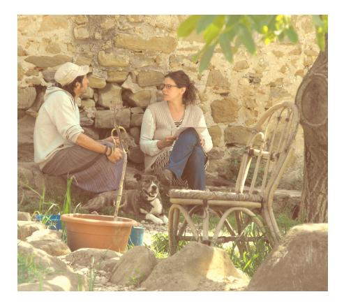
Scheme 2. The fieldwork. This photo was taken during one of the semi-structured interviews at one of the Ecological Intentional Communities in north Catalonia.

The 29 testimonies were recorded then transcribed and analysed with RQDA (Huang 2009), open-source software for qualitative data analysis. As a result, a coded list of items was produced, in line with our research interests. Field notes were also coded to complement the interview data.