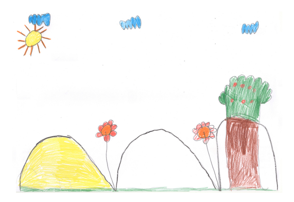
Figure A1. A spontaneous drawing depicted by a 7-year-old child.