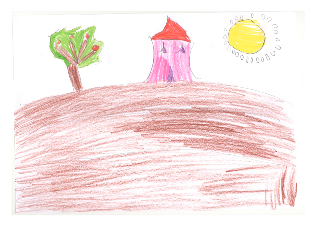
Figure A2. A spontaneous drawing depicted by a 6-year-old child.