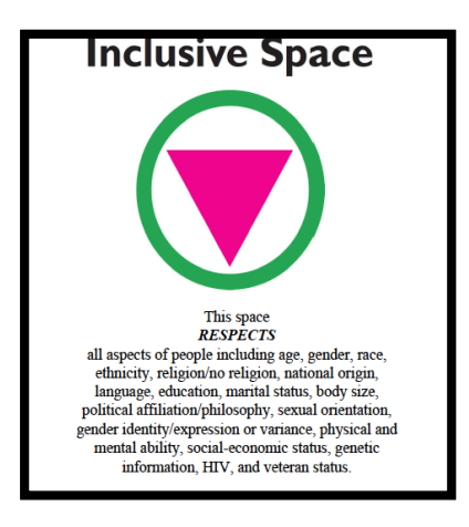
Figure 2. Inclusive Space poster.