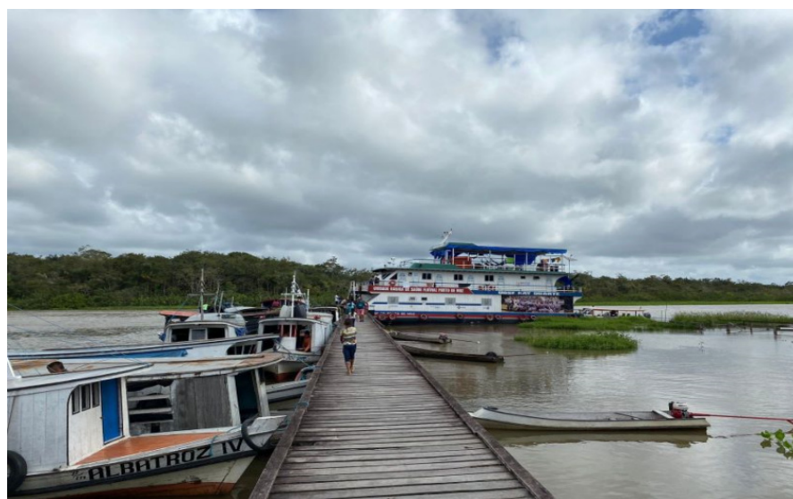
Figure 2. A photograph depicting the primary access route for the local population of Boca do Una to the “Itinerant Citizenship” initiative, showcasing the boats of the community members. In the background, the UBS boat, utilized by the researchers for accommodation, is visible.