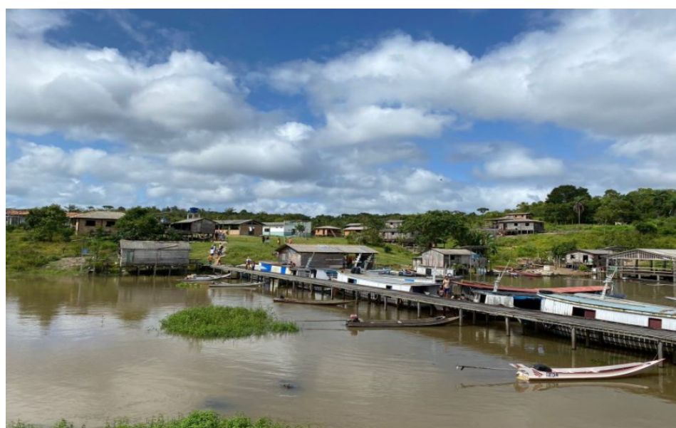
Figure 1. A photograph of the arrival at the Boca do Una community in the municipality of Porto de Moz.

Arrival at the Boca do Una community takes place by boat, as shown in Figure 1.