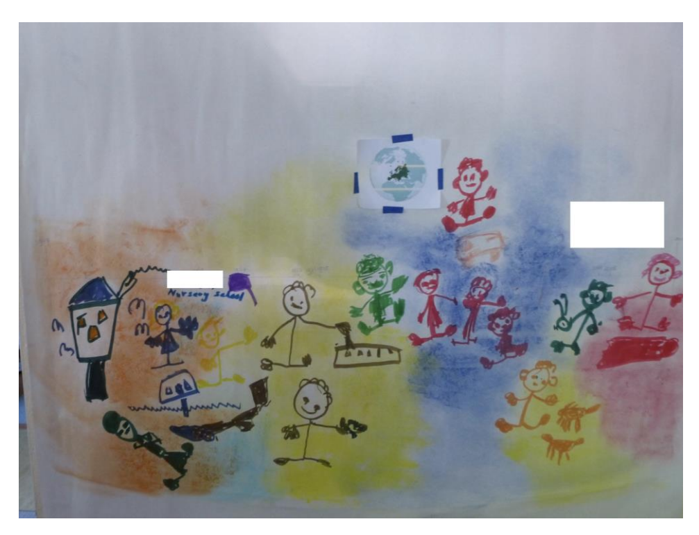
Figure 2. Betty's lifeline.