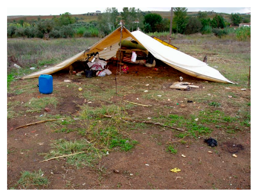
Figure 1. Cigano Camp. January 2022.

areas designated for fires to keep warm at night<sup>8</sup>. These images serve to expose the harsh living conditions that the families endure. They were captured during visits to the camp in the winter of 2022 when temperatures drop below zero degrees at night, making it evident that the families lack the necessary resources to cope with the Portuguese winter.