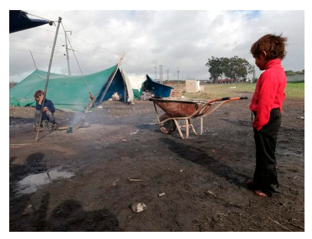
Figure 3. Cigano Camp. January 2022.