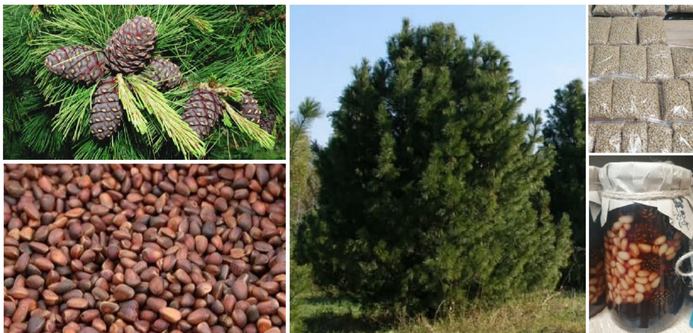
Figure 1. Siberian “cedar” (center), its pines and seeds (left), and some common products for sale (right).