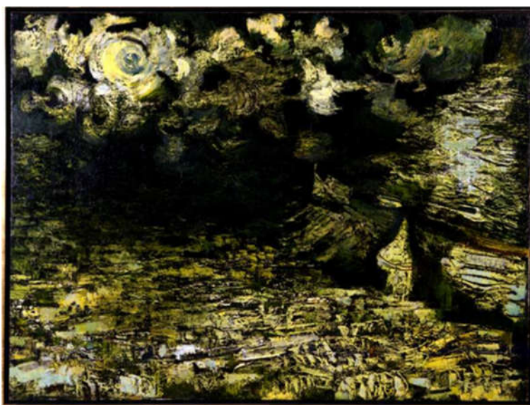
Figure 3. Mordecai Ardon, Kidron Stream , circa 1942, oil on canvas, 96 cm × 129 cm, The Israel Museum, Jerusalem.

It will happen that the Jewish artist, at first, will go naively beyond the wall of ancient Jerusalem, without premeditation or any special expectation. And suddenly the view of Kidron Valley will be revealed to his eyes—revealed in all its primal state. And sometimes the artist will stand overwhelmed, almost afraid, will stand as though petrified... A first meeting takes place between the two—and it is primal. (Vishny 1974, p. 28)