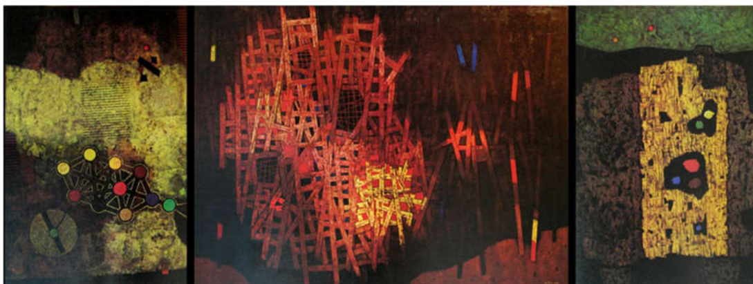
Figure 5. Mordecai Ardon, At the Gates of Jerusalem , triptych, 1967, oil on canvas, Sign (left-hand panel) 194 cm × 130 cm, Ladders (center panel) 194 cm × 265 cm, Rock (right-hand panel) 104 cm × 130 cm, The Israel Museum, Jerusalem. Used with permission.