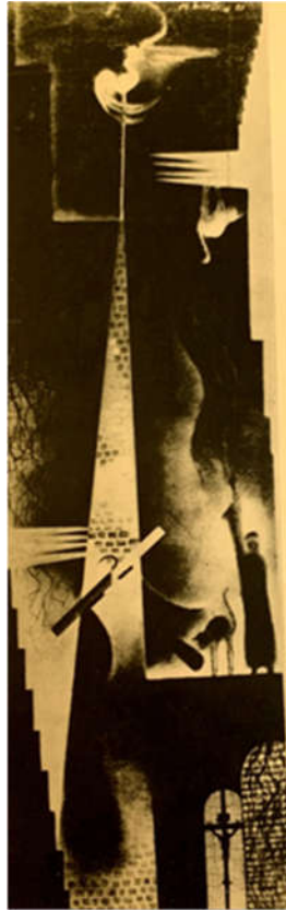
Figure 1. Mordecai Ardon, Steeple at Midnight , 1920, black crayon on paper, 66 cm × 20 cm, Bauhaus Dessau Foundation.