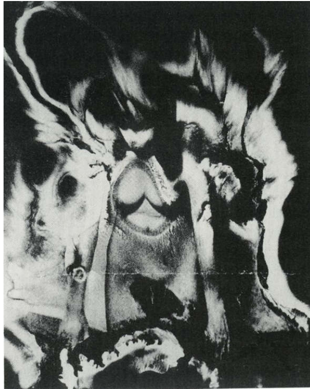
Figure 4. David Hare, Marine Fire, View , January 1942. In public domain.