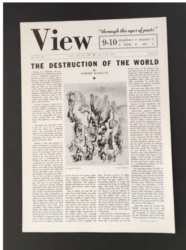
Figure 3. Pavel Tchelitchew, La Cascade Sèche, View, January 1942.