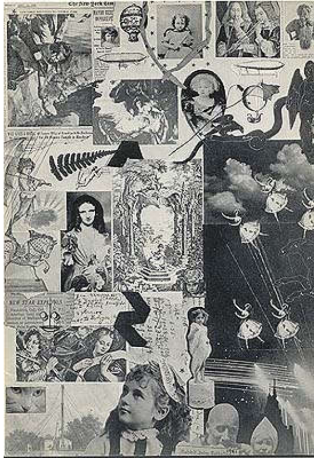
Figure 6. Joseph Cornell, Collage, The Crystal Cage (Portrait of Berenice) , View, January 1943.