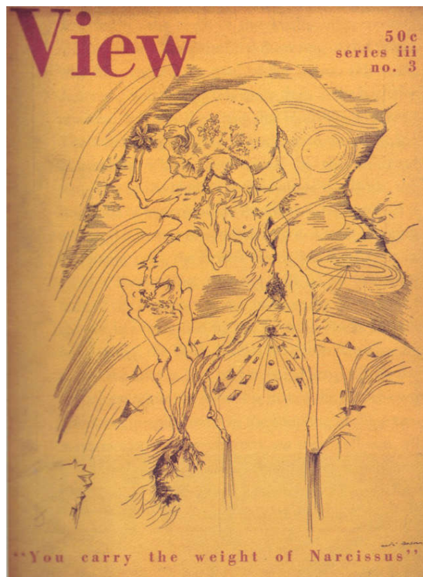
Figure 7. André Masson, You Carry the Weight of Narcissus , View , October 1943. © 2020 Artists Rights Society (ARS), New York/ADAGP, Paris. Used with permission.

The final image to be discussed is André Masson's drawing You Carry the Weight of Narcissus . It was used for the cover of the October 1943 issue of View , which was devoted to the Narcissus myth and its relevance to wartime culture (Figure 7). One of the major articles is by Wallace Fowle. Simply titled "Narcissus," it analyzes the theme of the mythical character's self-absorption as symbolizing the psychocultural need for modern humans to examine and question their own complex inner natures "during the terrible present moment of living" (Fowle 1991, p. 74). Following the myth of Narcissus' reflection, Masson depicts his doubled image, which includes a somewhat frayed idealized body paired with a ravaged skeleton. During the period Masson executed this work, he advocated the political responsibility of artists to express the "disquietude" of their epoch. While living near New York, he also lent his support to various political activities at the Society of American Friends of France that opposed the German occupation of his home country (Poling 2008, p. 153). However, it is also important to establish the wartime meaning of this drawing through its connection to Masson's larger production of Surrealist images that referenced his traumatic experience serving in the First World War.