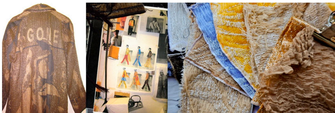
Figure 3. Maria Korkeila 2016, Portfolio with visual research, woven jacquard experiments, and the final collection.

Korkeila designed or modified almost all the fabrics in her collection, work which mostly took place during the workshop courses. The fabrics of the collection feature fantastically clever references to her visual research, such as the woven jacquards with a transparent layer of lurex yarn on top and a layer featuring a female figure outlined with overtwisted wool yarns on the bottom. The result is a three-dimensional fabric that resembles Christo's plastic wrapped magazine sculptures, one of Korkeila's references. The complex and intriguing combination of techniques and materials in Korkeila's collection illustrates deep skills and understanding of textile design, which can only be gained through extensive studies in the area that the Aalto ARTS textile pedagogy and path enables.