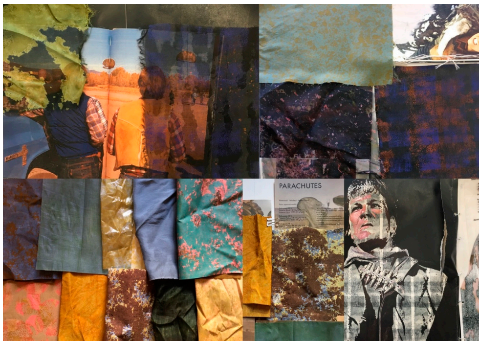
Figure 2. Jarno Kettunen and Anna Semi, 2016. Swatches, research, and info cards from the “Printed Fabrics, Dyeing, and Textile Technology” course. Kettunen and Semi worked on the same fashion collection. The research topic was related to the survival of young people in the desert and in harsh conditions. Inspiration was taken from the 1984 movie Red Dawn by John Milius, and as a counterweight to the theme of survival, from the delicate ice flower sculptures of Japanese artist Azuma Makoto.

A similar pedagogy is in use in all the different textile studio courses: The woven fabrics studio as well as the knits and knitwear studio. As a result, while building a textile archive of samples to use and develop further in their fashion collections, the students learn important technical skills and gain knowledge on textile techniques, structures, materials, and fibers.