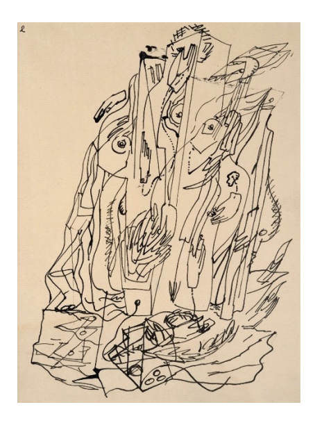
Figure 9. Automatic Drawing by André Masson (1924–1925). Ink on colored paper.

Moreover, Oskar Schlemmer's paintings, drawings, choreography, and costume/set design flamboyantly depict the mechanic post-flesh. The coming asexual bachelor machine is most obvious when Schlemmer inserts his dancers into svelte geometric-based outfits and puts them to work, repeating spectacular sequenced motions machine-like in their repetitions (Figure 10). Again, we have entered the sexually ambivalent android realm.