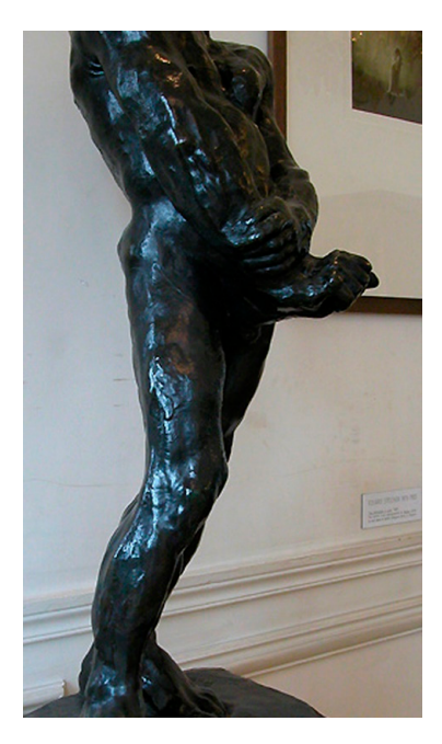
Figure 4. Balzac, second nude study F by Auguste Rodin, 1886 (detail). Bronze, 93.1 cm \times 43.5 cm \times 35 cm. Musée Rodin, Paris.