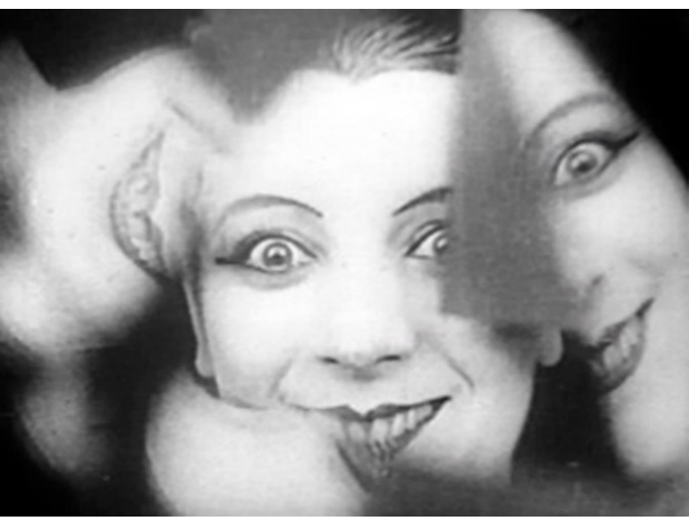
Figure 6. Le Ballet mécanique by Fernand Léger & Dudley Murphy, 1924 (two stills showing Kiki de Montparnasse). 19'50" 35 mm black & white film acquired 1997, inventory number AM 1997-F1388. Centre Pompidou, Musée national d'art modern, Paris.

Made the same year as Mechanical Ballet , and relevant to auto-sexual bachelor machines, is the speeding, automatic, ritualistic, and revelatory mode of iconographic mark-making André Masson devised for Automatic Drawing (1924, Figure 7). In this jittery automatic drawing, a conflict or antagonism is set up between the 'feminine' litheness of curves and the 'male' hard angles. Up against the supple curves of a centered naked woman, aggressive lines cut through her like a knife. Slow looking reveals that the image calls to mind not only Mechanical Ballet , but Marcel Duchamp's Nu descendant un escalier n ° 2 ( Nude Descending a Staircase , No. 2) (1912). Beyond that, there is at work an automatic artistic method, which plays in the area of chaotic control/non-control, aiming towards constructing a capricious alliance that associates discourses of mechanic grinding with organic sexuality, an association that opens up both notions to mental connections that enlarge them. Here the coming cyborg woman of Fritz Lang's Metropolis (1927, Figure 8) and Donna Haraway (Haraway 1991) are already undone by overwhelming complex disturbances they cannot contain.