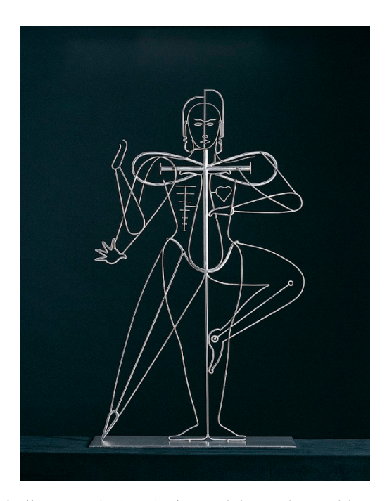
Figure 11. Les signes de l'Homme (Dématérialisation) by Oskar Schlemmer, 1924/1986. © 2016 Oskar Schlemmer, Photo Archive C. Raman Schlemmer and used by permission.