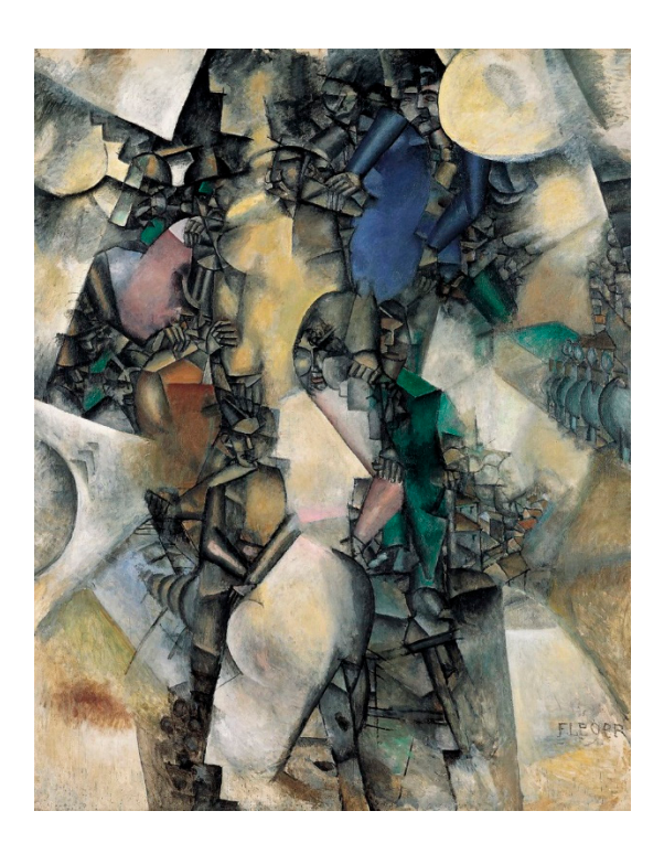
Figure 5. La Noce by Fernand Léger, 1912. Oil on canvas, 206 cm × 257 cm. Collection Centre Pompidou, Paris Musée National d'art Modern , Paris. Donation of M. Alfred Flechtheim in 1937. Used by permission.

Gender-fluid bachelor machines are already detectable in some of Fernand Léger's earliest artworks. What particularly interests me about Léger is how his imagery enters the oily slipstream of the bisexual cyborg, where distinctions between sex, the body, and robotics blur in the density of speeding political networks (Terranova 2004). We see this in the best painting Léger ever made: his rich, velvety textured, pre-war composition, La Noce (The Wedding) (1912, Figure 5), completed the same year Duchamp painted The Bride .