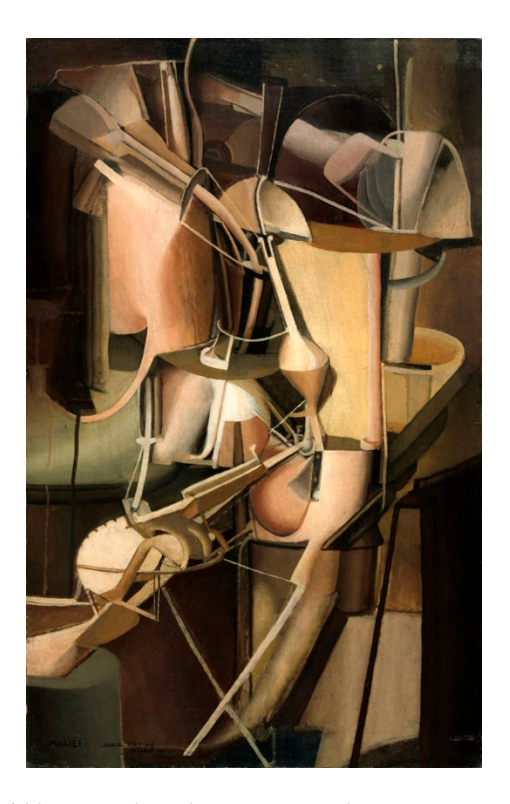
Figure 2. La Mariée (The Bride) by Marcel Duchamp, 1912. Oil on canvas, 89.5 cm × 55.6 cm. Philadelphia Museum of Art, The Louise and Walter Arensberg Collection, 1950.

activities of the impersonal but ingenious dandy (Huysmans 1973). However, I also think of this pumping trance-state as Duchamp's definitive desire when he is in an uninhibited bachelor machine mode: a detached, depersonalized, and mystical state of being (Stace 1960).