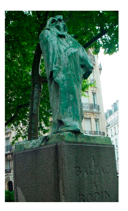
Figure 3. Monument to Balzac by Auguste Rodin, 1898. Bronze, 282 cm \times 122.5 cm \times 104.2 cm.

Rodin's objective for this bachelor machine was to depict a ballsy Balzac at the moment of conceiving the idea for a work of art through onanistic imaginative gazing. That Rodin chose to furtively depict Balzac as an onanist is far from ludicrous, as Balzac used masturbation (without climax) to intensify his writing sessions, drinking many cups of coffee, again masturbating just short of orgasm, halting, writing, and repeating, like a well-oiled machine.