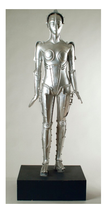
Figure 8. Robot by Walter Schulze-Mittendorff from Fritz Lang's film Metropolis, 1927. Copy created by the Louvre in 1994, painted resin, 190 cm \times 74 cm \times 59 cm. Cinémathèque française and used by permission.