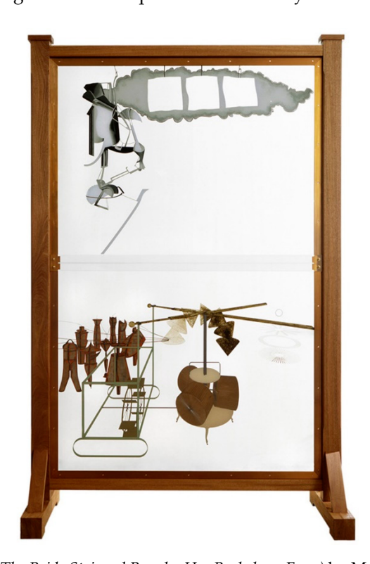
Figure 1. The Large Glass (The Bride Stripped Bare by Her Bachelors, Even) by Marcel Duchamp, 1915–1923; 2nd version 1991–1992. Oil on lead sheet, lead wire, dust and varnish on broken glass plates, glass plates, aluminum foil, wood, steel, 277.5 cm × 175.9 cm. Moderna Museet , Stockholm. © succession Marcel Duchamp/ADAGP, Paris 2014 and used by permission.

Dada's liberation of mechanamorphic sexual imagery has long been tarnished by the fact that male artists have historically been licensed to explore the rapid repetitions in lust and love, while women, for the most part, have inspired and represented them. Central to this naïvely gendered démodé dialogue is Marcel Duchamp's flamboyant and sexually subversive suggestion of onanistic machine célibataires (bachelor machines, Figure 1), with which he converted the principle of autoeroticism into one of the greatest masterpieces in the history of art.