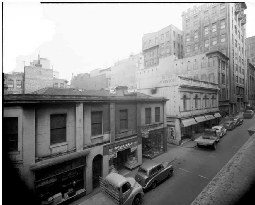
Figure 5. Collins House (1914) in the upper right-hand corner showing the three revolving block prisms; Little Collins Street, south side between Queen and Elizabeth Streets, Melbourne, ca. 1952.

Curiously, the Griffins had already established their experiments in the crystalline forms expressed through a cubic grid in their Collins House (1914), on Little Collins Street (now demolished). As far as the Collins House’s façade’s entablature is concerned, there were three rotating devices (or periaktoi , originally machines used within the ancient Greek theatre to change scenes) (Kuritz 1988, p. 137). With its revolving prismatic blocks (Figure 5), the Griffins created a public spectacle that could be seen from the street (Otto 2009, p. 343). “Prismatic balcony forms, rotated through the cube to reveal a sharp 45° angle, seem to grow directly from the gridded fenestration of the façade. Embedded with small slits of glass these literally were rock crystals” (Burns 1988, p. 23).