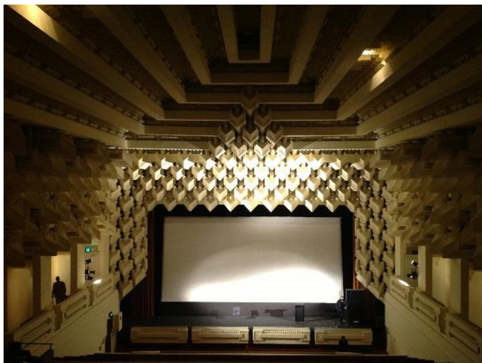
Figure 8. Interior of the Capitol Theatre, Melbourne, today.

As pointed out earlier, the Griffins were also interested in the abstraction of the American Jugendstil garden and the Mayan manner of producing prismatic forms, which were far more primeval and, simultaneously, sophisticated. They mirrored and inverted the Jugendstil-styled pathways and roof spaces within the Capitol's auditorium, a prismatic coffered ceiling designed within an inverted Mesoamerican pyramid (Figure 9). At the same time, there is an uncanny attenuated alliance to Adolf Loos' small American Bar ceiling in Vienna (1908), but the Griffins' version was much more reactionary, more voracious. The Griffins can be considered rebel modernists; they shifted their prismatic luxury design associations away from Europe and America by reverting to Mesoamerican pyramidal components as their underlying ornamental source.