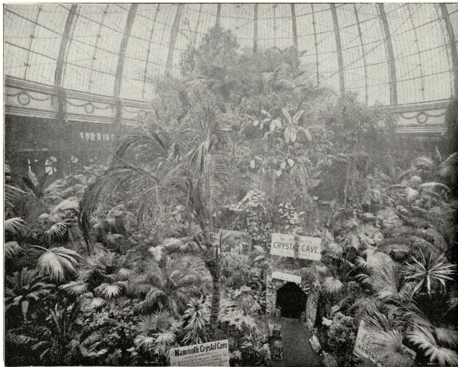
Figure 7. William Le Baron Jenney's "Mammoth Crystal Cave" at the Chicago's World's Columbian Exposition (1893). Courtesy of The Field Museum, Chicago. GN90799d_CG_132w. Used by permission.

Jenney's Horticultural pavilion included a grand stepped pyramid in the form of a "Foliage Mountain", planted with rare palms and blooming flowers. Evidence of this "Mammoth Crystal Cave" design in the form of a stepped pyramid exists in a photograph (Columbian Gallery 1893) (Figure 7). Enclosing an artificial landscape housed beneath a large crystal dome, its twisting path and tropical mountain enclosed, at its base, a massive pseudo cave. Made of steel construction and coated with plaster, it boasted "stalagmites, stalactites and quartz crystals" and "with the aid of electrical lighting, the final effect was described as both pleasing and dazzling" (Nielsen and Kumarasurlyar 2014, p. 261). It was unquestionably a brash setting. Considered not so much glass houses as elaborate nocturnal light displays, "crystal caves" conveyed a kind of prismatic sentimentality, relating to Bruno Taut's work.