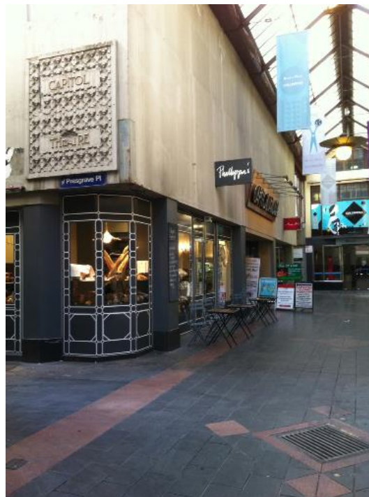
Figure 4. Back façade of the Capitol Theatre on Presgrave Place.