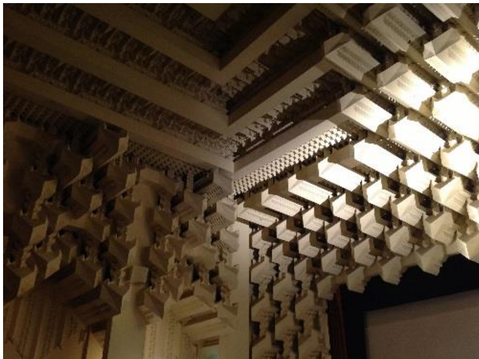
Figure 9. Detail of the Capitol Theatre’s serrated lattice of fretted plasterwork. Photograph: A. Condello (2015).

In addition, it is important to note that not only did the Griffins incorporate crystalline structural components in their Australian works, but they also injected Mesoamerican influences in their earlier works in America. The Frank Palma house (1911) in Illinois (aka the “solid rock” project) used strong Mayan-looking planes and flattened ornamentation. In addition, their Melson House (1912) design in Mason City integrated the building with the landscape.