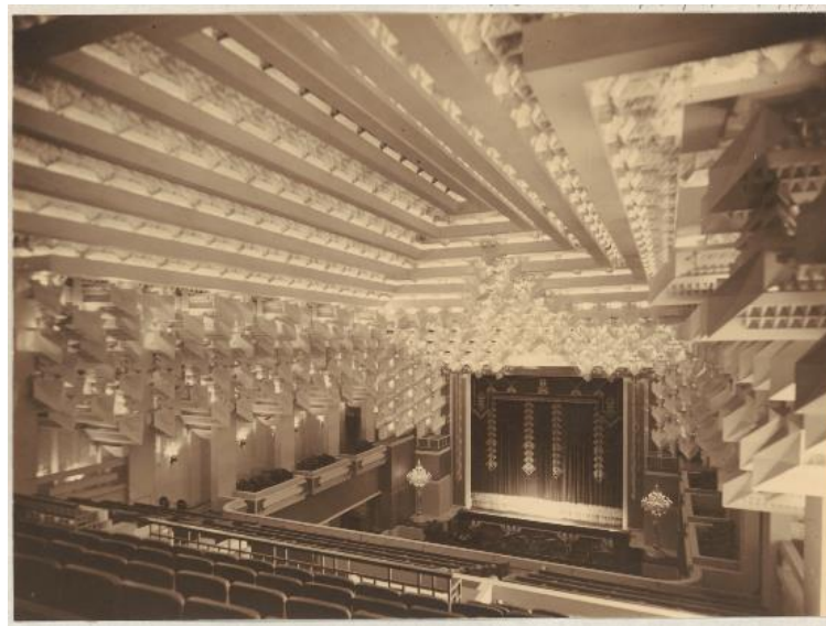
Figure 2. Walter Burley Griffin; interior view of the restored auditorium in the Capitol Theatre, Melbourne, Victoria, 1924.