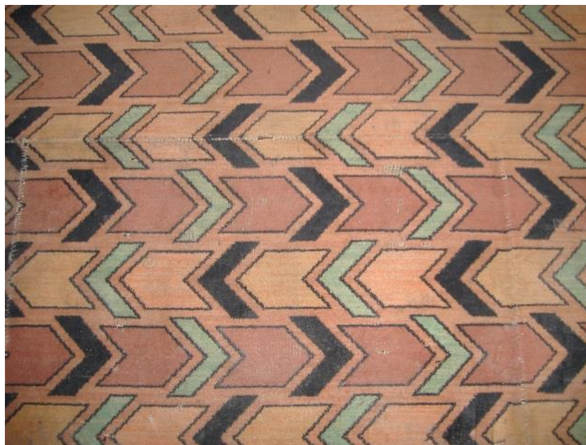
Figure 6. Capitol Theatre's abstracted geologically inspired green and orange garish carpet design, designed by the Griffins, composed of horizontal bands row by row in opposite directions.

In regard to the artificial objects used to ornament a modern space, Wright obtained the finest luxuries ranging from bespoke clothing to precious ethnic rugs. His famous assessment, "so long as we had the luxuries, the necessities could pretty well take care of themselves" (Wright 1977, p. 140), rings true when we observe the luxury for the masses as a need to dazzle the vision of others through ornamental plasterwork in abstracting the natural landscape. The Griffins also designed their own carpets poignantly with abstracted geological imagery in garish colours in green and orange, as in the Capitol Theatre (Figure 6). Geological imagery casts a glamorous effect upon modernist Australian architecture through the concept of the constructed landscape. Similarly, the Griffins were fixated on geological (and botanical) imagery, especially the crystal, which for Burns, was a "manifestation of 'evolutionary change' of minerals growing steadily into perfect geometric types" (Burns 1988, p. 26). Furthermore, its "shape should be simple enough to be comprehensible and should be complete" (WB Griffin, quoted in Vernon 1995b, p. 40).