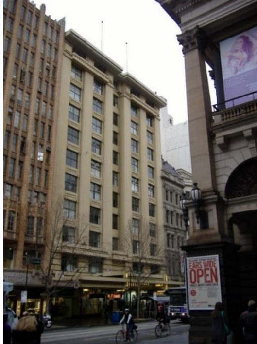
Figure 3. Façade of the Griffins' Capitol Theatre on Swanston Street, Melbourne.

interior landscape. Its interior reflects the kaleidoscopic opals as depicted in Katherine Susannah Prichard's novel, The Black Opal (1921), where "the colours in the stones—blue, green, gold, amethyst, and red—melted, sprayed and scintillated . . ." (Prichard [1921] 1973, p. 138); the novel was published during the Griffins' auditorium's construction.