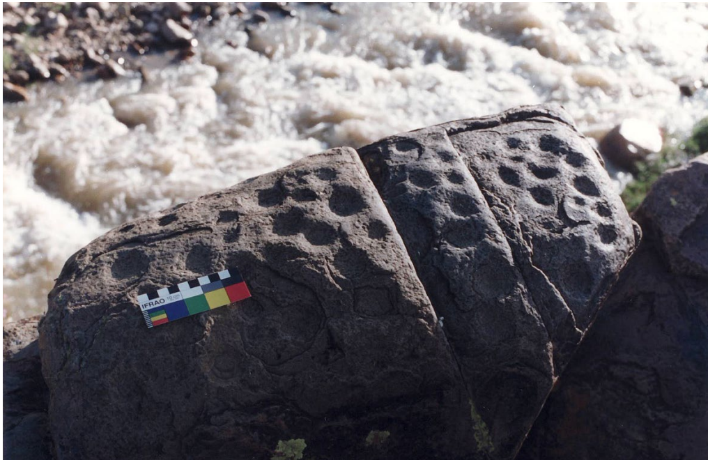
Figure 6. Engraved grooves on bedrock of Cueva Epullán Grande, Neuquén Province, Argentina, probably more than 9970 \pm 100 years old (after Crivelli M. and Fernández 1996).