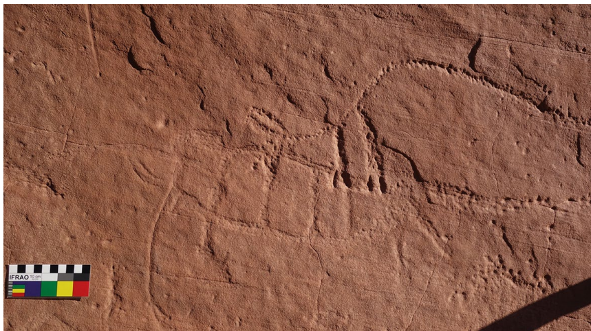
Figure 1. Petroglyph arrangement of unrelated elements on cliff at Upper Sand Island, Bluff Utah, thought to depict a mammoth, but less than 4000 years old.

The status of two elephantine petroglyphs at Track Rocks near Barnesville, Ohio, has remained uncertain until recently. Early descriptions of the site (e.g., Ward 1872; Read and Whittlesey 1877; cf. Swauger 1974) [87,94,103] make no mention of them, but they are all significantly incomplete. A recent scientific investigation confirmed that the ‘mastodons’ date from between 1910 and 1980, based on granular exfoliation calibrated by numerous engraved dates (Bednarik 2013) [25]. Two further arrangements high up on a cliff at Upper Sand Island near Bluff, Utah, have been attributed to the Columbian mammoth (Malotki and Wallace 2011) [69]. Intensive microscopic examination (Bednarik