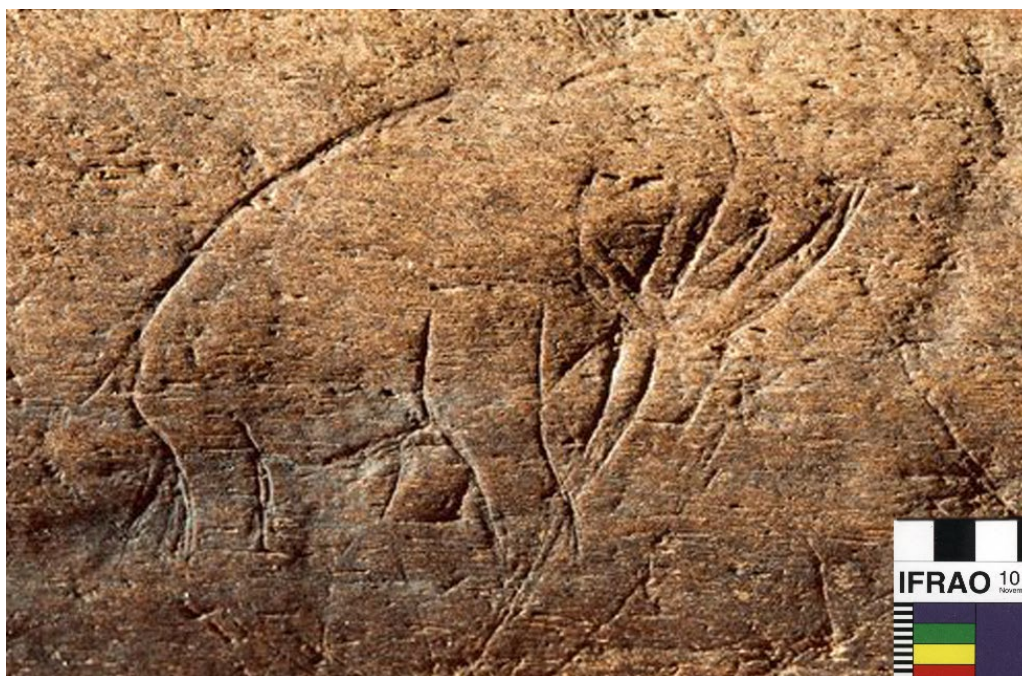
Figure 2. Engraving on a fossil bone fragment from Vero Beach, Florida, bearing a proboscidean engraving.

This long list of purported elephantine rock art motifs from the United States can be supplemented by a series of spurious claims for other Pleistocene faunal depictions in American rock art. Among them are Whitley's (1996) [107] assertion that the extinct Western horse has been depicted at Legend Rock, Wyoming; and his contention that a partially patinated petroglyph at Surprise Tank, California, is of a camelid (Whitley 1999) [108]. The second claim cites the opinion of a palaeontologist in support (Whitley 2009) [109], which is of no relevance. Palaeontologists or zoologists are trained to identify species or their remains; they have no innate understanding whatsoever of alien palaeoart imagery and their pronouncements about it are less relevant than those of illiterates or infants (Bednarik 2011) [22].