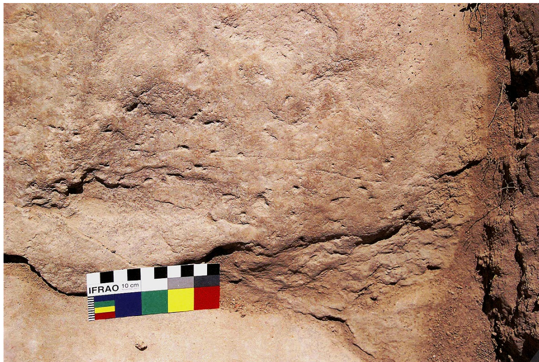
Figure 3. Peck marks at Hensler Petroglyph Site, Dodge County, Wisconsin, shown to be at least 10,000 years old (after Steinbring 2013).

The numerous limestone plaques from the Clovis layer of the Gault site, Texas, with their 'geometric' (non-iconic) engravings (Collins 2002; Collins et al. 1991, 1992; Robertson 1999) [36–38,88] are generally accepted as authentic. So far, at least 134 specimens have come to light at this site, but the provenience of many is not secure (D.C. Wernecke, pers. comm.). Nevertheless, eighteen good examples are clearly from the Clovis deposits, and they represent some of the most important palaeoart the Americas have yielded (Figure 4).