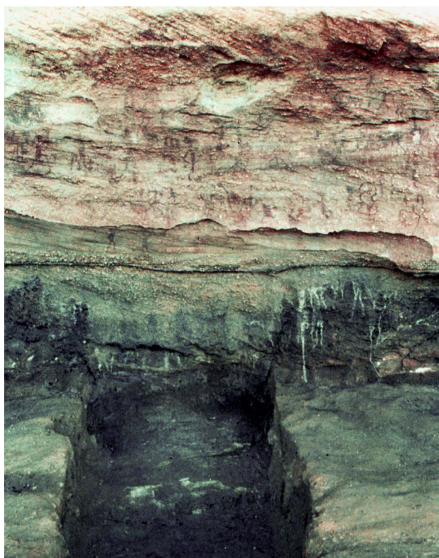
Figure 7. Pictograms of Perna I rockshelter, São Raimundo Nonato, Piauí, Brazil, at least 9500 years old.

An exceptional site of early South American rock art is Toca do Baixao do Perna I, where numerous red paintings have been excavated in unusually dry sediments that are up to 9,500 years old (Guidon and Delibrias 1986; Bednarik 1989: 105) [10,58]. They occur immediately above a thick layer of charcoal (Bednarik 2013) [26]. A fragment of a pigment ball bearing signs of having been worn as an ornament was found at the site, providing an AMS radiocarbon date of 15,250 \pm 335 years BP (Chaffee et al. 1993) [33]. Although that age cannot be extrapolated to the rock art, it seems that pictograms at the site date from the final Pleistocene, and are therefore among the oldest surviving rock art of the Americas (Figure 7).