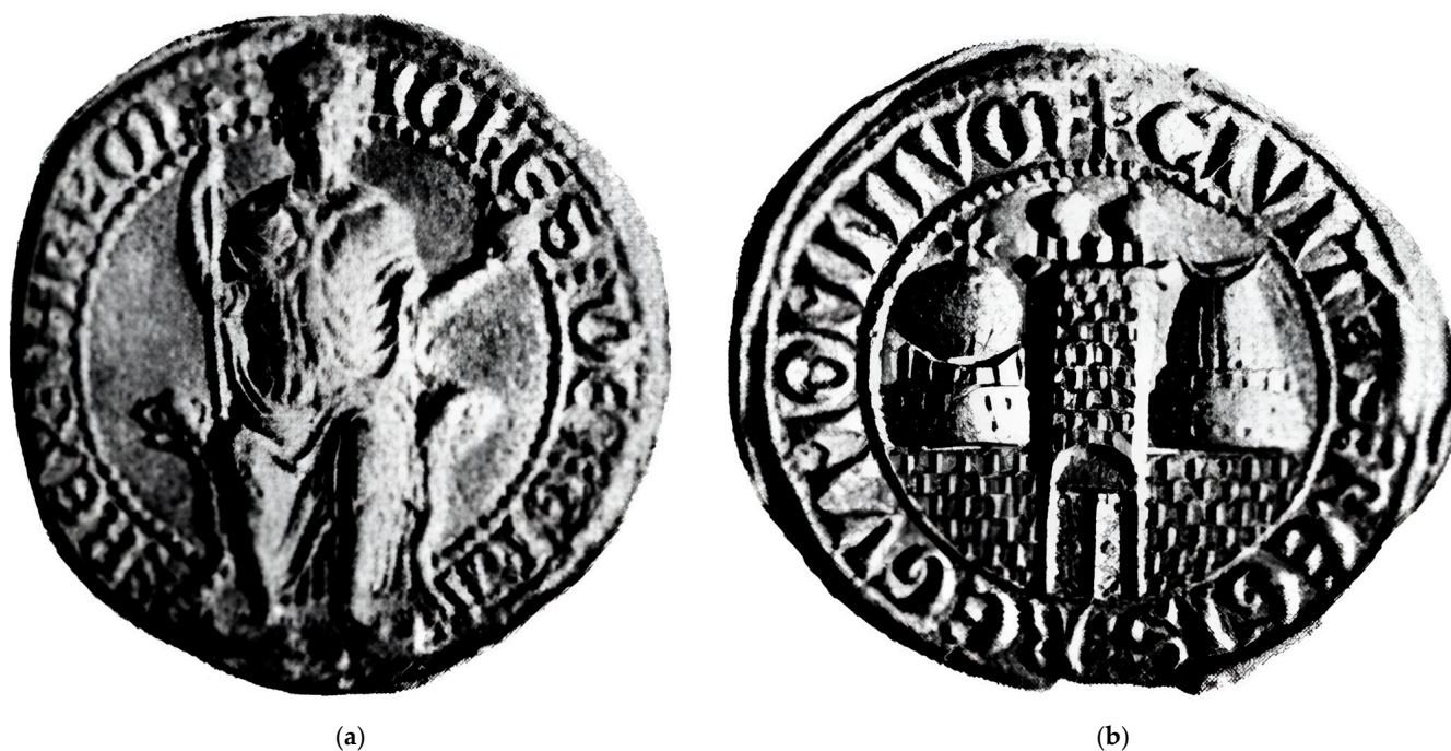
Figure 3. Seal of Jean de Brienne, obverse (a) and reverse (b), depicting Jean de Brienne enthroned and three edifices symbolizing Jerusalem (the Holy Temple, the Tower of David, and the Holy Sepulchre), c. early thirteenth century, courtesy of Wikimedia Commons and Creative Commons.