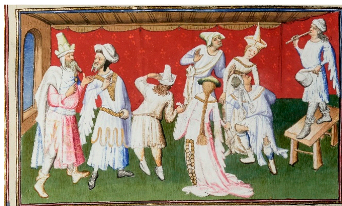
Figure 8. Court dancers from Le Livre des merveilles du monde ( The Book of Marvels of the World , detail), the Egerton Master, illuminator, French, c. 1410, Bibliothèque Nationale de France ms. fr. 2810, folio 44 recto.

Travel writers like Polo were astonished by this empire's wealth and enormity, though they intermittently critique Mongols' supposed idolatry and heathenism. Travel writers' depictions of Asian dancers suggest that European onlookers/readers enjoyed seeing these performers as servile, sexually available, and docile—not unlike colonized subjects. While these texts do not describe or record deliberate acts of colonial domination, they conjure proto-orientalist fantasies of consumption and exploitation.