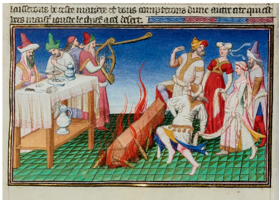
Figure 7. Dancers from Le Livre des merveilles du monde ( The Book of Marvels of the World , detail), Master of the Mazarin Hours, illuminator, French, c. 1410, Bibliothèque Nationale de France ms. fr. 2810, folio 23 recto.