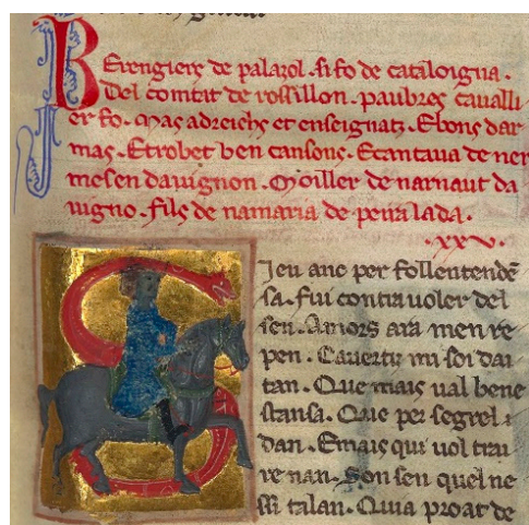
Figure 12. Miniature portrait of Berenguer de Palazol from a chansonnier (songbook), French, late thirteenth century, Bibliothèque Nationale de France ms. fr. 12473, folio 126 recto, courtesy of Wikimedia Commons/Creative Commons.

The other troubadour who may have inspired a figure from Raymonda , Berenguer de Palazol, composed lyric with similar themes and structures to those of Bernard. Approximately twelve of his songs survive (Aubrey [1996] 2000, pp. 216–17; Newcombe, cited in de Palazol 1971, p. 56). In a chansonnier portrait, Berenguer appears on horseback (one of the markers of nobility), though in fact he was a poor knight (Figure 12). Relevant to Raymonda , Berenguer sometimes lyricized on the theme of absence (i.e., when lovers are separated by distance or other uncontrollable situations); the geographical divide between the betrothed characters Raymonda and Jean de Brienne during the Fifth Crusade propels much of the ballet's dramatic tension. For example, his song "Bona dona, cuy rix pretz fai valer" ("My Fine Lady, Whom in My Opinion Noble Merits Lift High"), discusses unrequited love, given his beloved's apparent withdrawal (Berenger [Berenguer], cited in de Palazol 1971, pp. 75, 77). 52 Counterintuitively, prolonged absence stokes his desire more ardently. In true chivalric fashion, the courtly lover proclaims that his beloved is more worthy of love than himself. 53 This intense devotion becomes explicit in Act II of Raymonda , after Jean has returned from his military venture abroad. In a duel to the death, Jean risks his life to safeguard his fiancée from the clutches of Abderrakhman.