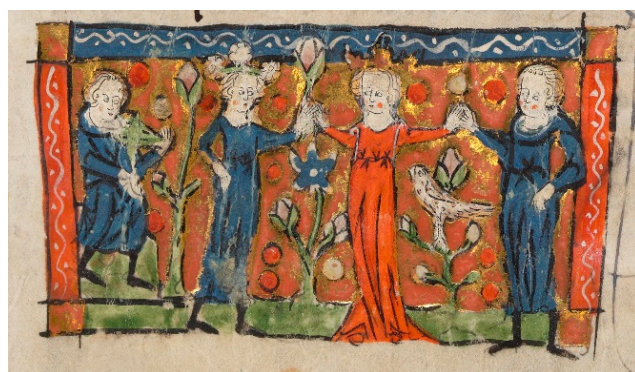
Figure 14. Dance scene from Jacques Bretel's Le Tournoi de Chauvency ( The Tournament of Chauvency ), Metz, France, c. 1309, University of Oxford, Bodleian Library, MS. Douce 308, folio 113 recto, courtesy of the Bodleian Library and Creative Commons.

Broadly construed, Raymonda 's choreography shares some formalistic affinity with medieval dance forms, namely the carole (circular group dance), bassedanse (processional couple's dance), and jeu de chapelet (garland dance), all of which functioned as rites of courtship for the nobility (Dickason 2021, ch. 6; Regalado 2006, pp. 345, 347, 351; Ferrand 1986, esp. 88; McGee 1995, pp. 549–50; Mullally 2011). 56 For example, a fourteenth-century manuscript illustration from Jacques Bretel's Le Tournoi de Chauvency ( The Tournament of Chauvency , c. 1285) depicts a row of dancers donning garlands (Figure 14), thereby fusing the motifs of courtship, springtime, and fertility. These floral accents also recall courtly love lyric, since troubadours often began their cansos (love songs) with a "spring opening" (or what German scholars have termed Natureingang ) that announces the season of romantic love (Van D'Elden 1995, p. 267).