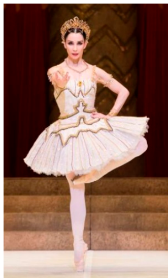
Figure 10. Tamara Rojo in Act III of Raymonda, English National Ballet, 2016