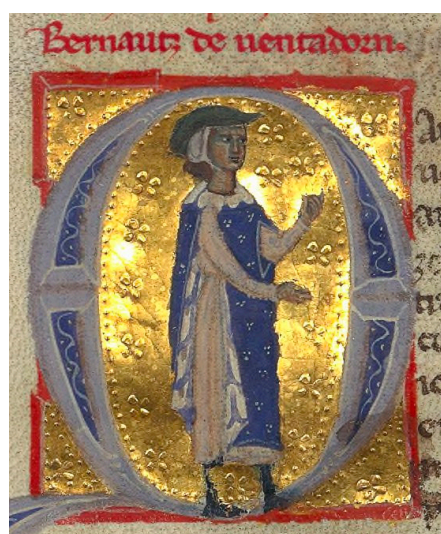
Figure 11. Miniature portrait of Bernard de Ventadorn from a chansonnier (songbook), French, late thirteenth century, Bibliothèque Nationale de France ms. fr. 12473, folio 15 verso