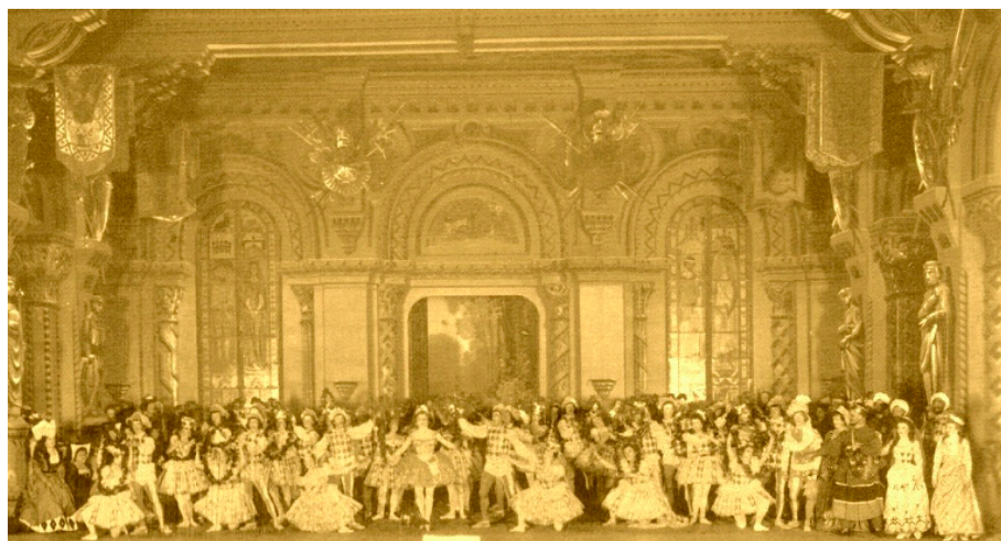
Figure 1. Mariinsky Ballet dancers in Act I of Raymonda , St. Petersburg, 1898, by unknown photographer of the Imperial Mariinsky Theater, courtesy of Wikimedia Commons/Creative Commons.

and manuscript illustration, given the Book of Kells -esque historiated initial for the letter R, inhabited by a hybridized creature and intertwining tendrils (Figure 2). Vestiges of Petipa’s original choreography can be reconstructed using Stepanov notation, a method of notating ballet movements that was developed in imperial Russia. Most full-length versions performed today are based on the 1948 Soviet revival that Konstantin Sergeyev staged (Fullington 2022, pp. 266–68; Fullington and Smith 2024, pp. 621–24). 3