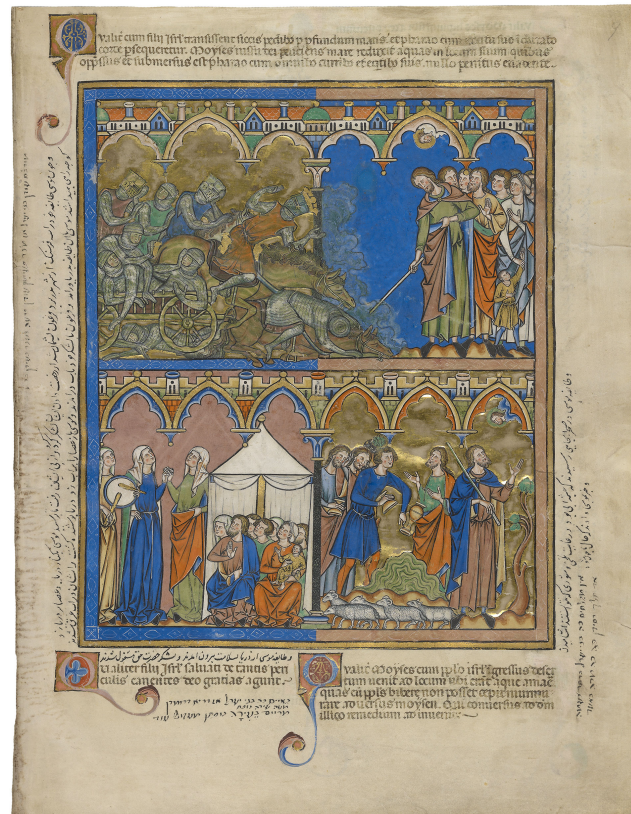
Figure 6. The dance of Miriam (Exodus 15:20), from the Morgan Crusader Bible , Paris, c. 1250, Morgan Library and Museum MS. M 638, folio 9 recto.