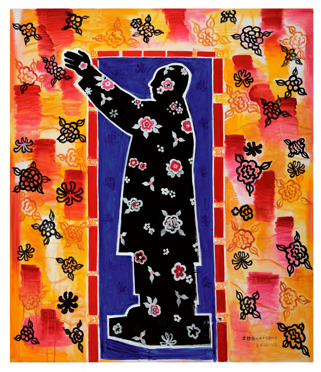
Figure 4. Yu Youhan 余友涵 (b. 1943), Waving Mao 2 , 1995. Acrylic on canvas, 144 × 131 cm. Private collection.

As the title suggests, Waving Mao 2 (1995) (Figure 4) is the second version of a work that the artist had produced five years earlier.<sup>7</sup> The most prominent difference is arguably the vast number of three-petal white trilliums (lat. trillium grandiflorum ) that were replaced with different kinds of flowers in the 1995 version. While the earlier version from 1990 has been displayed at major international exhibitions such as Mao Goes Pop: China Post-1989 (1993) in Sydney, Australia, and China's New Art, Post-89 (1993) in Hong Kong, limited information is available regarding the exhibition history of Waving Mao 2 (1995). However, one crucial aspect that has not been addressed yet might explain why the later version has attracted so little attention: at the bottom right of the painting, the following handwritten addition is appended: 'Made for Miss Vivienne Tam' ( ying Tan Yanyu nüshi zhi yao er zuo 应譚燕玉女士之邀而作). The addendum indicates that the work was a commission for the New York–based fashion designer Vivienne Tam (b. 1957, Guangzhou), reflecting the progressive commodification of art in the 1990s.