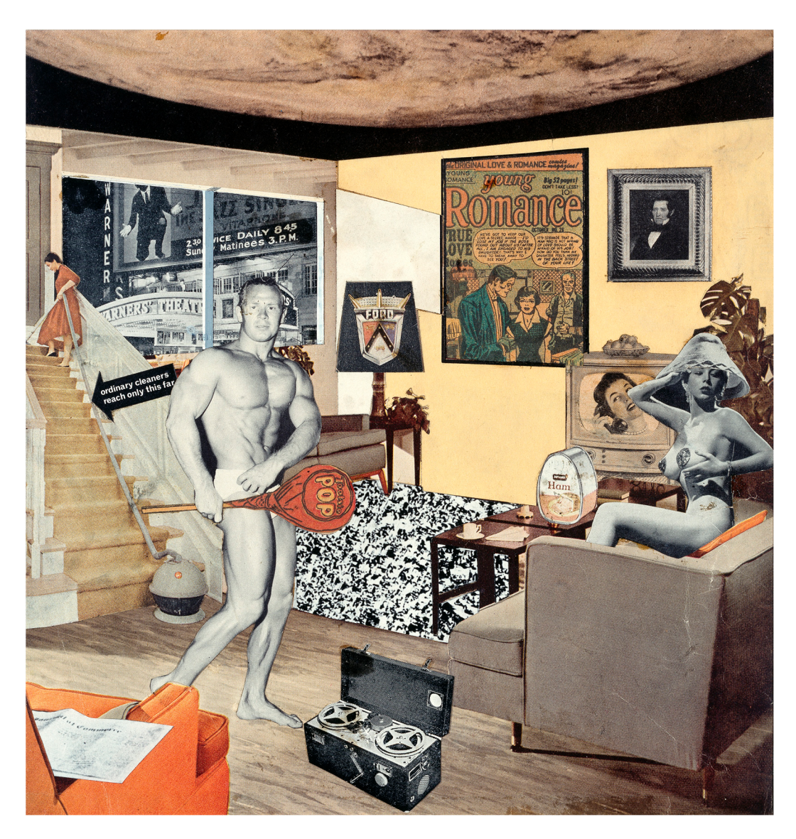
Figure 7. Richard Hamilton (1922–2011), Just What Is It That Makes Today's Homes So Different, So Appealing? , 1956. Collage of printed materials and gouache, 26 × 24.8 cm. Zundel Collection.

in signification and consequently causes humorous effects.