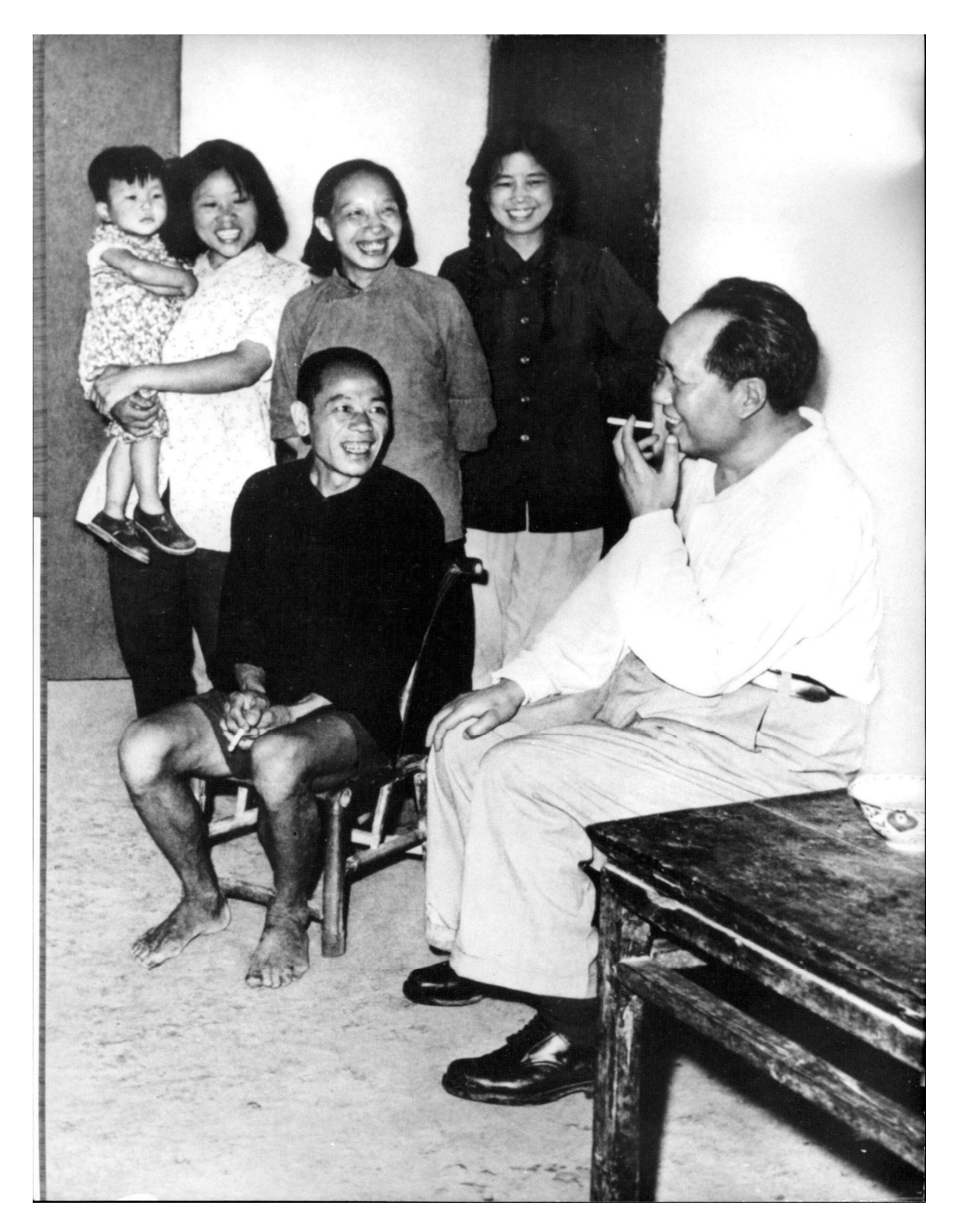
Figure 3. Mao Tse-tung, leader of the Chinese Communist Party, visited a peasant family in his hometown of Shaoshan in June 1959 [Mao Tse-tung, chinesischer KP-Chef besuchte im Juni 1959 eine Bauernfamilie in seinem Heimatort Shaoshan].

family in his hometown of Shaoshan in Hunan province.<sup>6</sup> This conclusion is based on its reproduction in the November/December 1976 issue of the China Reconstructs magazine (China Welfare Institute 1976, p. 57). In commemoration of Mao, who had passed away in September of the same year, the magazine dedicated the double issue entirely to him, including various black-and-white photographs (Figure 3).