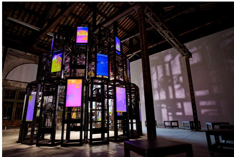
Figure 4. ANNEX, Entanglement , 2021.