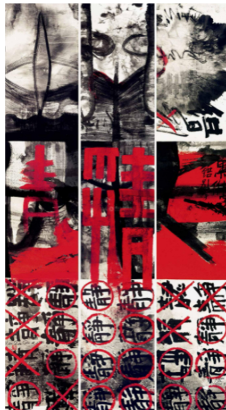
Figure 1. “Drama of the Hybridization of Two Cultural Forms” by Wenda Gu. Ink on paper and white-silk-framed vertical shaft. First published in Fine Arts, 1986, vol. 1.

from their differences. This goal ensured that there were few psychological conflicts or points of resistance in the study of western art. However, when western art theory and practice entered China again after the end of the 1970s, its reception was more critical due to the history of ideological criticism it had received under the long-term influence of the socialist political culture. In the efforts to construct modern Chinese culture, the question of how to deal with this mixed theoretical framework became a collective challenge in the 1980s. The tension brought about by these internal and external influences in the 1980s erupted into a nationwide “Cultural Discussion” between 1984 and 1985. Within this wider discussion, artists expressed their different positions through their art practices, forming the vigorous ‘85 New Wave Art Movement’.