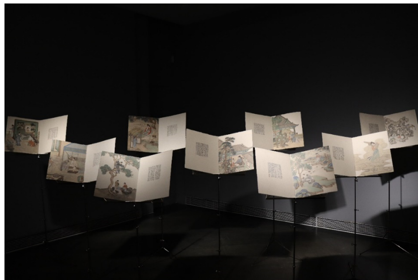
Figure 6. “The One in My Dreams” by Wei Peng, 2019. Ink on paper, painting installation.

The formation of a dialogue with “theory” is a common practice in autotheory. However, even if the practice of autotheory is a living, emotional, and personal creative “genre”, dialogue with existing texts or a certain “citation” does not automatically make an artwork autotheoretical. This problem is also one of the difficulties involved in judging the practice of autotheory. The series known as “The One in My Dreams” is an exchange of writing generated by a conversation with Judith T. Zeitlin (Figure 6). The female characters she chose are mostly from Strange Tales from a Chinese Studio by Songling Pu. Each picture is accompanied by a letter from a Western female writer translated by Wei Peng into Chinese. The juxtaposition of the two forms a contemporary view of women (Figure 7). For example, the female image shown in the picture is Xiaoxiao Su, a talented Geisha from the ancient south of the Yangtze River. The text is a letter from the poet Anna Akhmatova to her brother-in-law. The two women’s experiences and their talented characters frame the sincere language of the letter in relation to the image. Peng Wei’s exhibition thus uses various citational modes to connect women from different cultures and historical moments to explore contemporary women’s experiences.