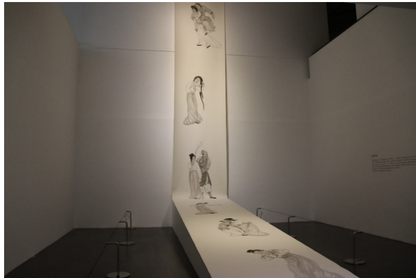
Figure 4. “Old Tales Retold” by Wei Peng, 160 × 5000 cm, ink on paper, 2019.