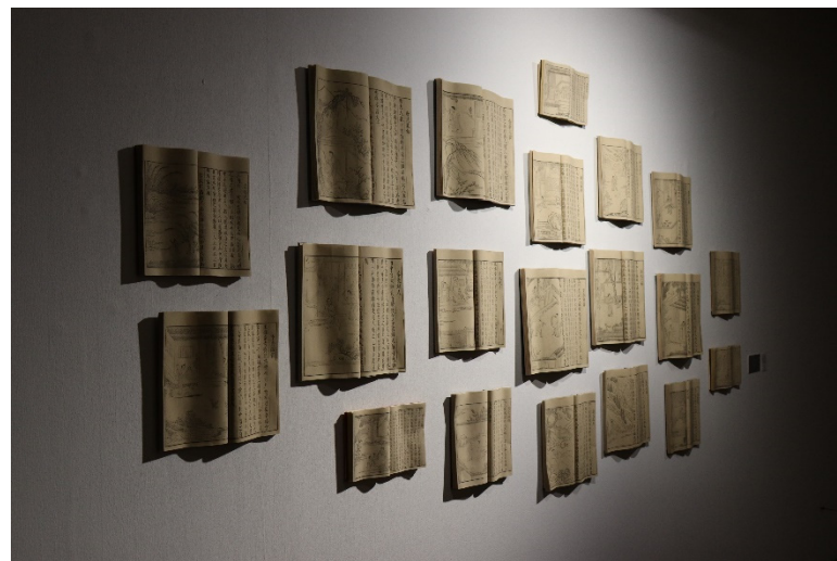
Figure 5. “Handbook for the Boudoir” by Wei Peng, variable size, digital printing, installation, 2019.

Peng skillfully uses the technique of “citation” to convey this reflection. She directly quotes Lü Kun’s Handbook for the Boudoir in the title of her work, signaling the relationship between the two. In addition, she selects several typical images from Lü Kun’s Handbook for the Boudoir and enlarges and transforms them into a continuous female image to create an alternative book of images of women. As Wu Hung argues, Peng Wei extracts these images of women from their original context, where they were depicted as hurting themselves for loyalty, filial piety, and righteousness, and amplifies them to create independent individuals who are larger than life (Wu 2020). These magnified images and their composition on the page become visual references. This method of citation not only makes people alert to and invites criticism of the unjustified expectations of women but also reflects on how the traditions exemplified in the Handbook for the Boudoir continue today. Although, in the process of opposing the feudal customs of dynastic China, the women’s liberation movement has raised the status of women in China, there remains an implicit constraint on women’s virtue at the social level. With the revival of traditional culture in the new century, the deformation of the “boudoir models” or Lie women has emerged in the new era through phenomena such as “female virtue training classes”, which impose a layer of