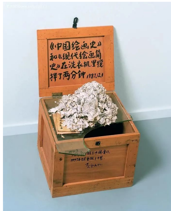
Figure 2. “The History of Chinese Painting and The Brief History of Western Modern Art Washed in the Washing Machine for Two Minutes” by Yongping Huang. Installation, 1990. This is a replica provided by the author in 1993.

Although the cases discussed here do not clearly “cite” any specific existing theories, what they reflect resonates with those ideas discussed in post-colonial theory and cultural studies. In the context of China in the 1980s, this collective autotheory mostly involved the artistic representation of “non-western modernity” and approaches that highlight choice, resistance, transformation, and juxtaposition in cultural conflict (Bill et al. 2002), or grafting and hybridization (Young 2004), presenting a picture of postmodern cultural theory in the context of non-Western culture. This practice, based on the reflection on the collective self in the 1980s, contributed to the theorizing of cultural research in fine art. In addition, it is worth mentioning that in this example of collective-self rethinking, the “self” disclosed and narrated in autotheoretical practices is not aimed towards “non-self” factors. In Fournier’s example, these “non-self” factors are colonists, racial discriminators, and other power subjects. Autotheory thus becomes a criticism of “non-self” factors. In Chinese art, by contrast, this rethinking on the collective self reflects collective self-experience and a practice whose essence is anti-self and constructive.