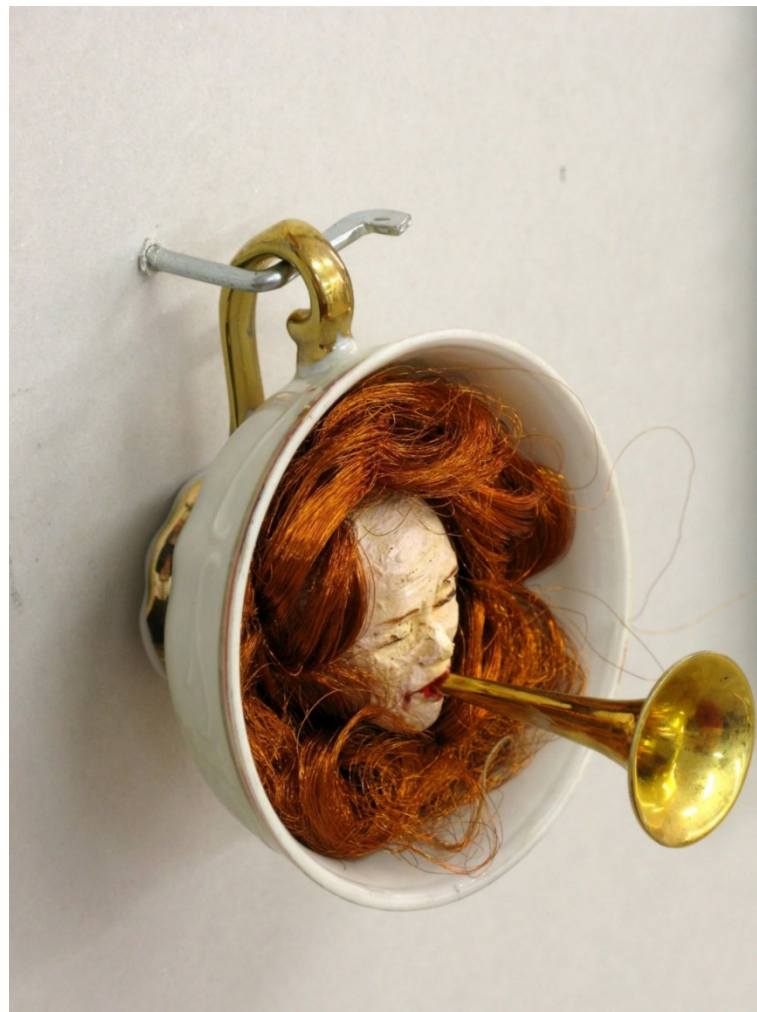
Figure 3. Dvora Morag, “Mom?”, 2013. Mixed Media.

heads make an appearance: two with brunette hair (like that of the artist and her daughter) and one with red hair (like the artist's mother). In the work Mom? (2013) (Figure 3), the red-haired head is set inside a fine, porcelain teacup and has a small gilded horn emerging from its mouth. In A Full Mouth (2013) (Figure 4), a head with brown hair is glued to the center of a white porcelain plate with a dry branch protruding from the mouth. In Make a Sound (2013) (Figure 5), a head with brown hair is mounted on a wall and a large element made of cardboard that resembles a shofar or horn projects from the mouth. These three works convey the identity of the women in the family by a small identifying sign (the hair color) known primarily to the artist herself. The pieces reflect the tension between silence and speech, the desire to speak and forced speech (although the wind instruments seem to allow for a voice, they appear violently forced into the mouth), hence the tension between swallowing and vomiting.