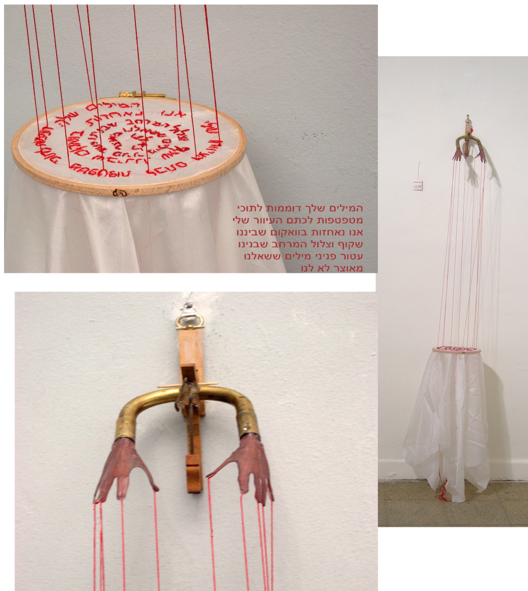
Figure 7. Dvora Morag, “To My Daughter”, 2006. Mixed Media.

spiral or vortex of feelings—is addressed to both women, the mother and daughter. They lament the silence and the blindness, the barriers between them, and at the same time, they seek healing through touch. Beyond the words that are uttered or bleeding, beyond the gaze that is present or absent, are the hands of the mother, touching. The touch of the motherly body creates meaning and struggles with what is absent by the laborious task of embroidering words but constructs meaning primarily through the rhythm, the gaps, and the spaces between.