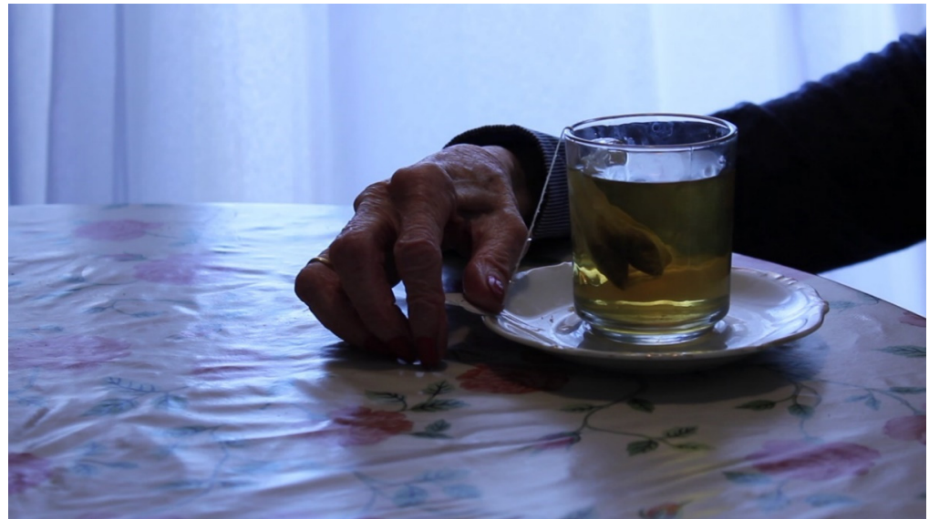
Figure 1. Dvora Morag, “And you shall tell your daughter”, 2014. Single-channel video.

In 2014, Morag was first able to give public voice to her mother in her video film And you shall tell your daughter (Figure 1). The film opens with her mother sitting at a table. The viewer can see only her hand against the table and hear her voice. The mother speaks in snatches of the moment she stood facing the crematorium in the death camp—“We were naked, they shaved us, we no longer cried”, and then, the film pivots to her immigration to Israel in 1949. The mother’s story, marked by personal details—the weather, her clothing, physical feelings—accentuates the vividness of the memory that haunts her despite her long silence.