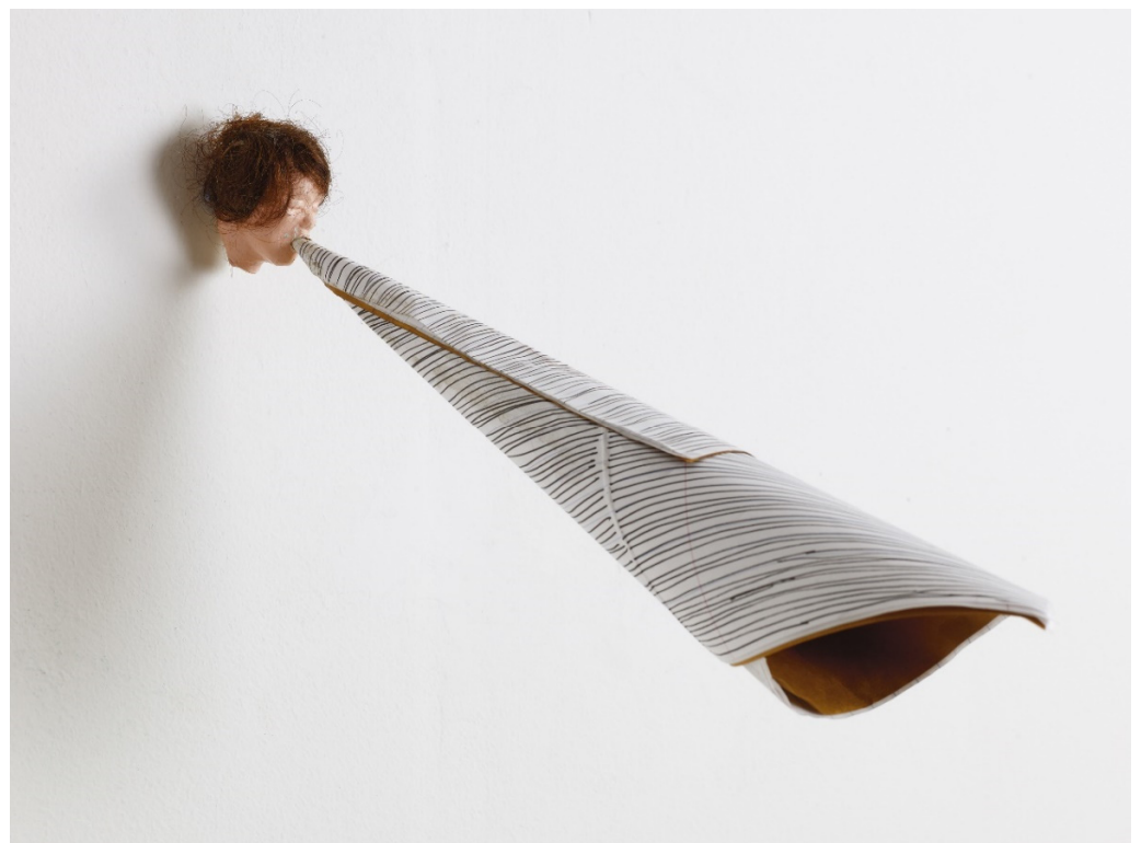
Figure 5. Dvora Morag, “Make a Sound”, 2013. Mixed Media.

The silence surrounding the Holocaust trauma assumes another aspect in Morag's life as a mother. When her daughter was 10 years old, she was sexually molested by her piano teacher. At the time, the daughter remained silent about it and the mother knew nothing. Learning of it later led to the creation of works dealing with failure as a mother