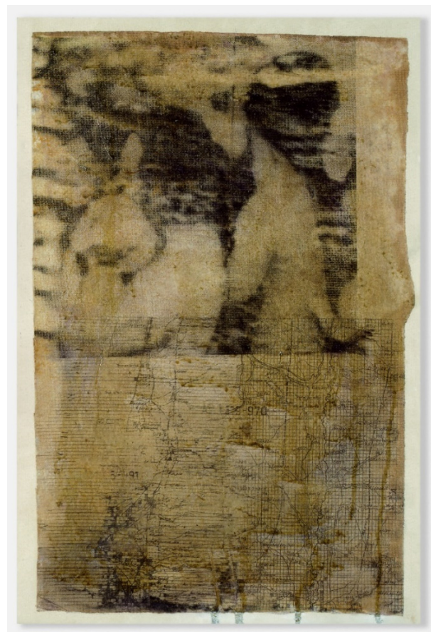
Figure 9. Bracha L. Ettinger, “Eurydice18”, 1992–1996, oil and mixed technique on paper mounted on canvas.

In the Eurydice series on which she began work in the early 1990s, Ettinger uses old, anonymous Holocaust photographs as well as family photos from wartime and earlier. In Eurydice, No. 18 (1992–1996) (Figure 9), she processes an old photo from the death camps showing two women from the back, one with a child in her arms. The name of the series associates the woman from the Holocaust with the mythological figure of Eurydice, beloved wife of Orpheus, whose yearning glance backward at his lover causes her death. In this piece, the woman becomes a heroine, one who gradually fades away or re-emerges, back and forth from death to rebirth. The power of this work seems to be drawn from the gaze at the image, as the viewer grasps at the remains of an image that has undergone a long, complex process until it is barely a shadow of visibility. The viewer's effort to revivify the image comes up short, wavering between memory and forgetting, between the revealed and the repressed.