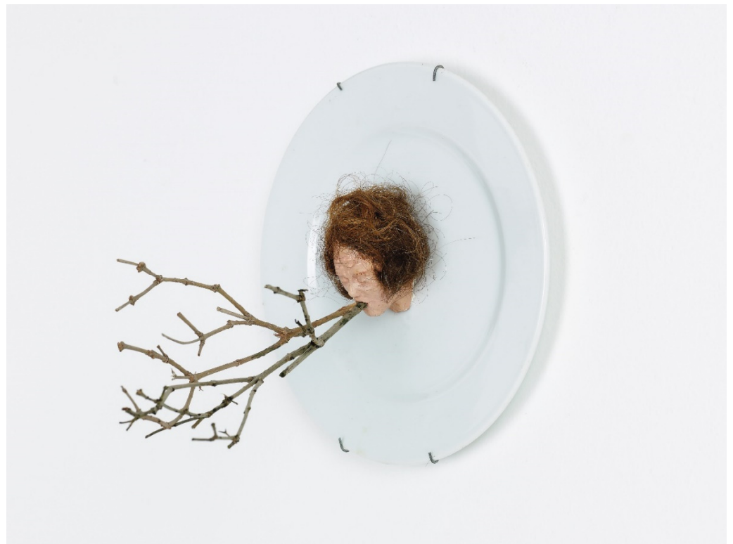
Figure 4. Dvora Morag, “A Full Mouth”, 2013. Mixed Media.