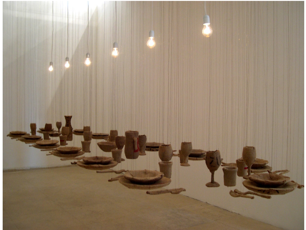
Figure 2. Dvora Morag, “A Set Table”, 2005. Installation.

family would set a beautiful table, sit down, and cry. The memory of the past in Poland did not allow for traditional holiday dinners, and finally, they decided not to hold these at home but rather to be guests in other homes.