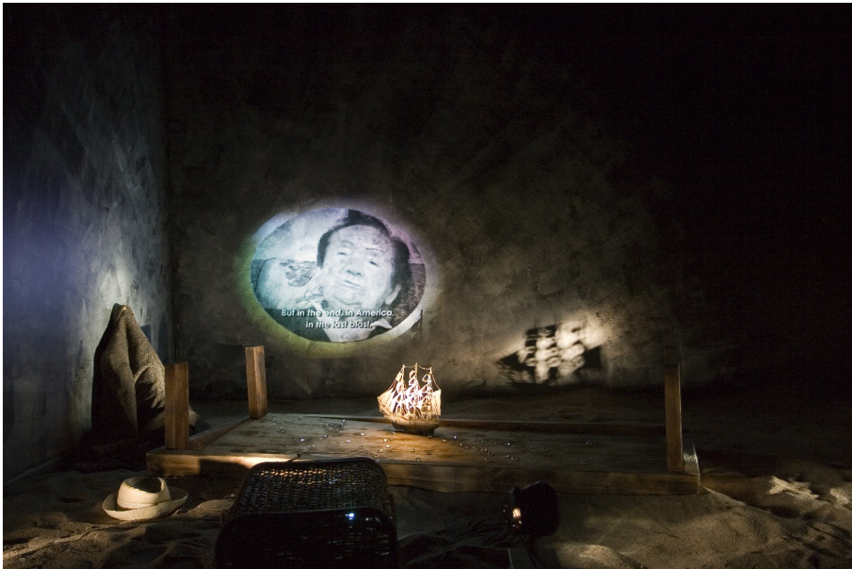
Figure 8. Miri Nishri. “Troubled Water”, 2006. Installation.

momentarily revealing the stationery images, as the frozen landscape seems to bring to life fragments of memory.