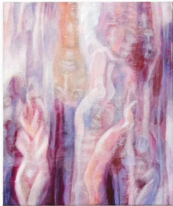
Figure 10. Bracha L. Ettinger. “Annunciation-Birthing-Pieta n.3”, 2017–2021, oil on canvas.

narrative. Her work “Annunciation-Birthing-Pieta” (2017–2021) (Figure 10), differs from the previous painting by the range of colors spanning from pink to purple. The image of Mary harkens back to one of the Eurydice figures in an earlier series and the angel in the Gospel of Luke becomes a female, a mother, the [female] angel of carriage. Thus, Mary/Eurydice receives the news from a mother, and the good tidings themselves, the information about new life being created in the female body, becomes a connection between two women. From this connection—information passed from mother to mother, conveyed by generations of women about life and death—comes Mary’s reply: “I am ready”. Mary submits to this angel, who touches Mary with her wing. This physical touch breaks down the fundamental otherness between the young girl and the winged creature from the Gospel, between flesh and spirit, and evokes echoes of the deep connection between the two figures, a matrixial, female-womb connection. A red stain like a bleeding womb links the two women and the hazy image of an infant, who carries traces of the trauma. This infant reveals the moral imperative for compassion and caring carried in its mother’s womb, bearing an internal, not external, imperative, testifying to the human ability to care about the Other.