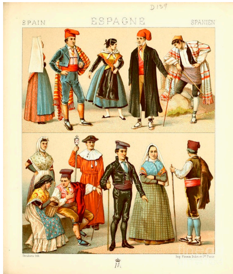
Figure 2. Illustration for Spanish popular clothing of the late 18th century, in Auguste Racinet, Le costume historique , 6 Vols, Vol 6, Firmin-Didot, Paris 1888, unpaginated, Catalan and Aragonese dress (p. 427). The essay refers to the male figures second and fourth respectively from the left on the upper register, which are identified as Catalan styles.