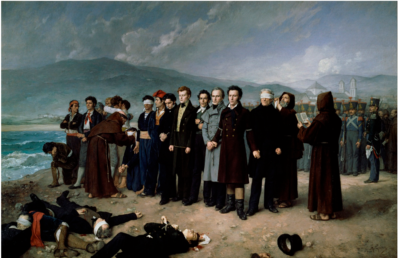
Figure 1. Antonio Gisbert Pérez, Execution of Torrijos and his Companions on the Beach at Málaga , 1888. Oil on canvas, 392.5 × 602.5 cm. Museo Nacional del Prado, Madrid.

Gisbert's portrayal of the event and lend insight to his method, in addition to contemporary reports from the time of the painting's first public exhibition, the essay offers a careful analysis of the painting's content and remarkably original composition that is related to, but at odds with, Goya's Third of May 1808 , with which it has been frequently compared, and with which it shares its historical context.