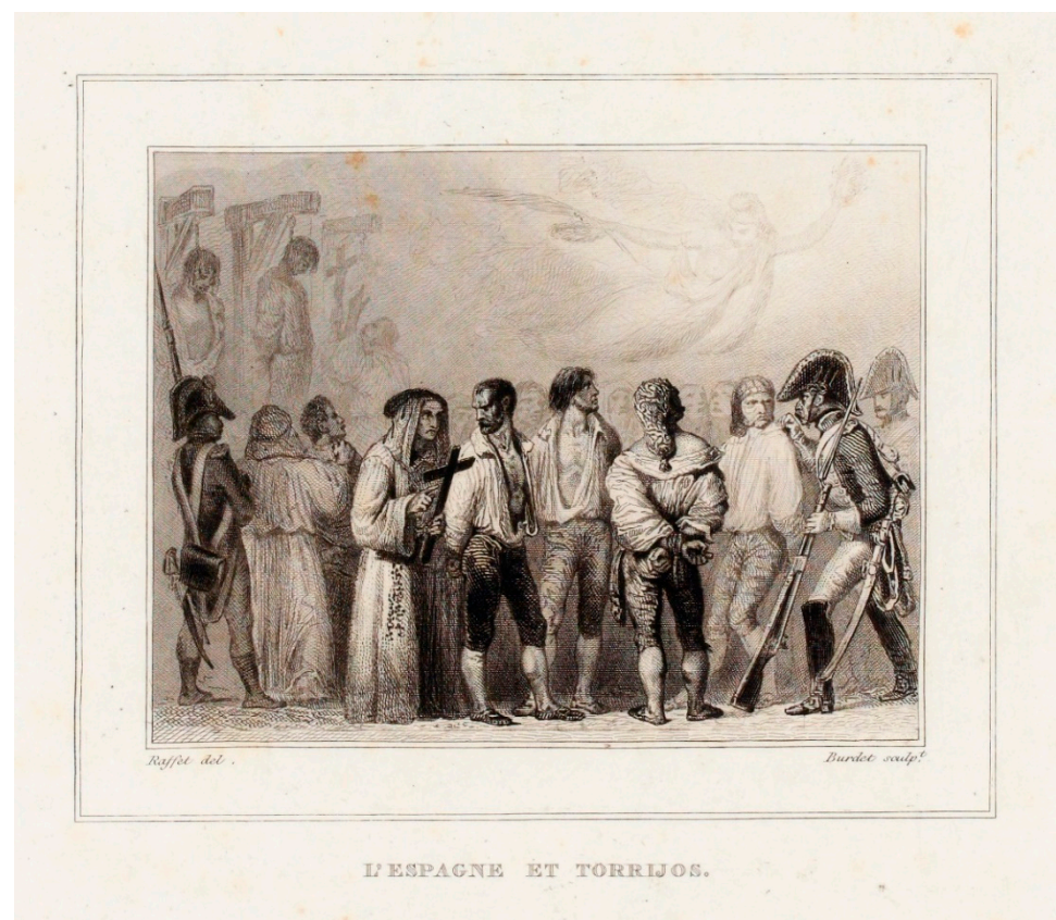
Figure 3. Auguste Raffet, L’Espagne et Torrijos , 1835. Etching (Aquatint on steel), 10 × 7.5 cm. Musée Carnavalet, Paris, G.18476.

While the rationale governing the painting’s creation are clear, Gisbert’s decisions regarding its design are not. As a point of departure in recording the event, Gisbert could look to little in the way of visual precedents apart from the etching, L’Espagne et Torrijos (1835, Figure 3) by the French artist Auguste Raffet (1804–1860), a highly Romantic, imaginative work. The latter shows those awaiting their fate, none of whom are clearly identifiable, dressed in popular majo clothing (including the elaborate hairnet) and an allegorical figure symbolising freedom crowns the dead with a laurel; however, the dead are incorrectly shown hanged. 11 While Gisbert knew the succession of events far better, he was tasked with recording the event effectively in line with his brief and portraying the leaders as accurately as possible, while forced to rely on inconsistent artistic representations of them.