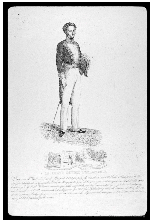
Figure 6. José María Cardano, Portrait of José María Torrijos , 1834 or earlier. Lithograph, 39 × 26 cm. Biblioteca Nacional de España, Madrid, IH/9333/2.