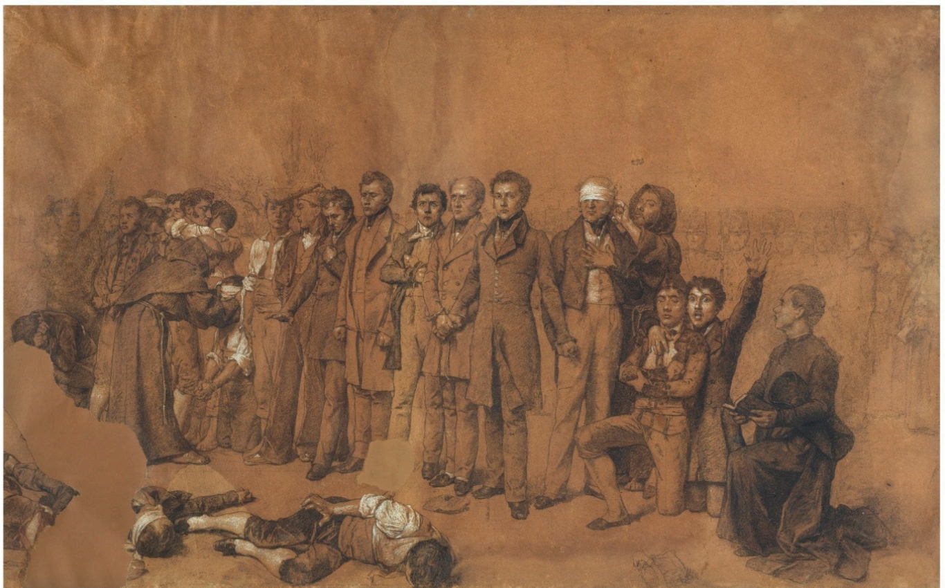
Figure 13. Antonio Gisbert Pérez, Execution of Torrijos and his Companions on the Beach at Málaga , 1886–87. White chalk and pencil on paper, 82 × 133 cm. Museo del Prado, Madrid.

looks directly at the viewer, effectively linking the space within the image to that beyond it (Figure 13). While arguably Torrijos's direct gaze would have created a more poignant final work, the removal of the raised arm preserves the work's sobriety, of what is essentially a frieze formed by the row of standing figures, and imbues the picture with a still, but not stiff, monumentality. The focus on the leaders, shown physically unscathed, with the firing squad relegated to the background, creates a kind of mise-en-scène , where the beach becomes a kind of theatre on which the men, centre-stage, seem somewhat removed from the bloody events, and their identities clearly preserved for memory. Though possibly incidental, the fact that the firing squad is placed behind the men and suggests that they were shot in the back, is perhaps a reference to Moreno's betrayal.