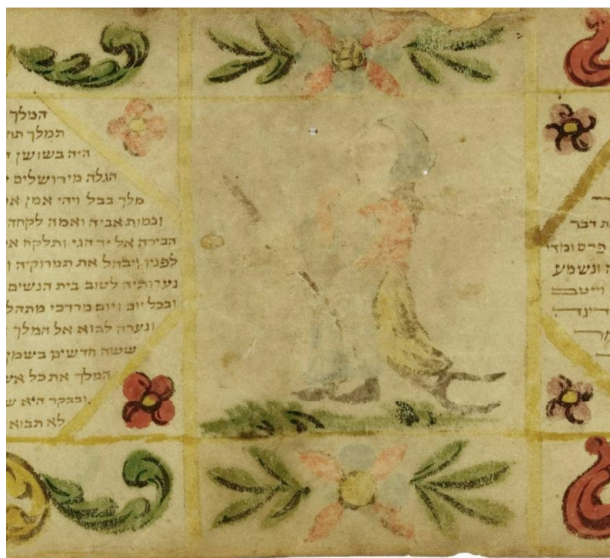
Figure 1. Queen Vashti, Esther scroll from the Braginsky Collections (Braginsky Collection Megillah 7), Alsace, the second half of the eighteenth century.