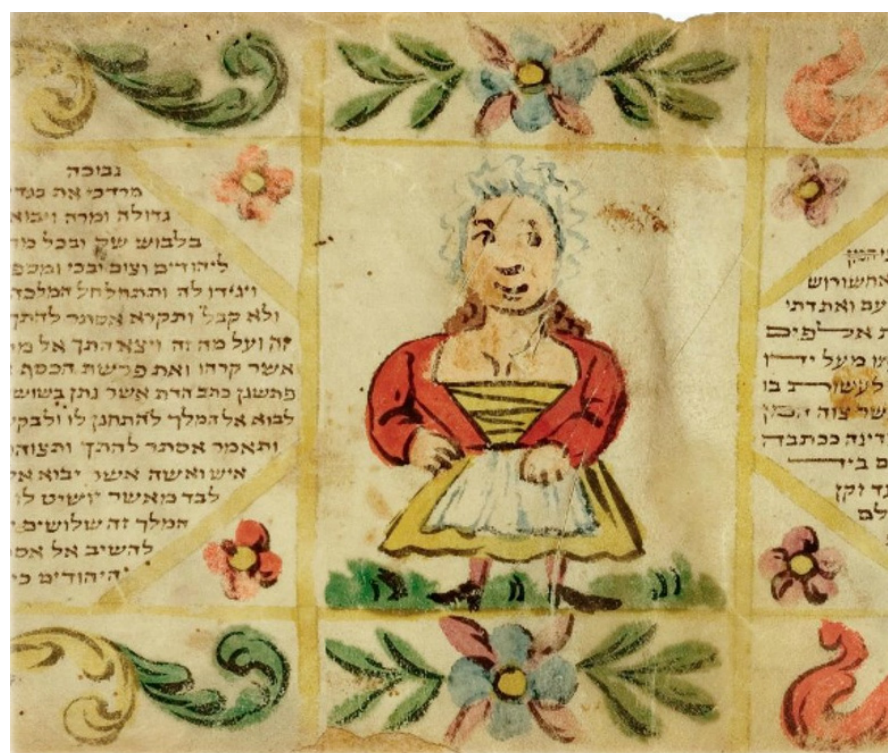
Figure 2. Haddasah, Esther scroll from the Braginsky Collections (Braginsky Collection Megillah 7), Alsace, the second half of the eighteenth century.