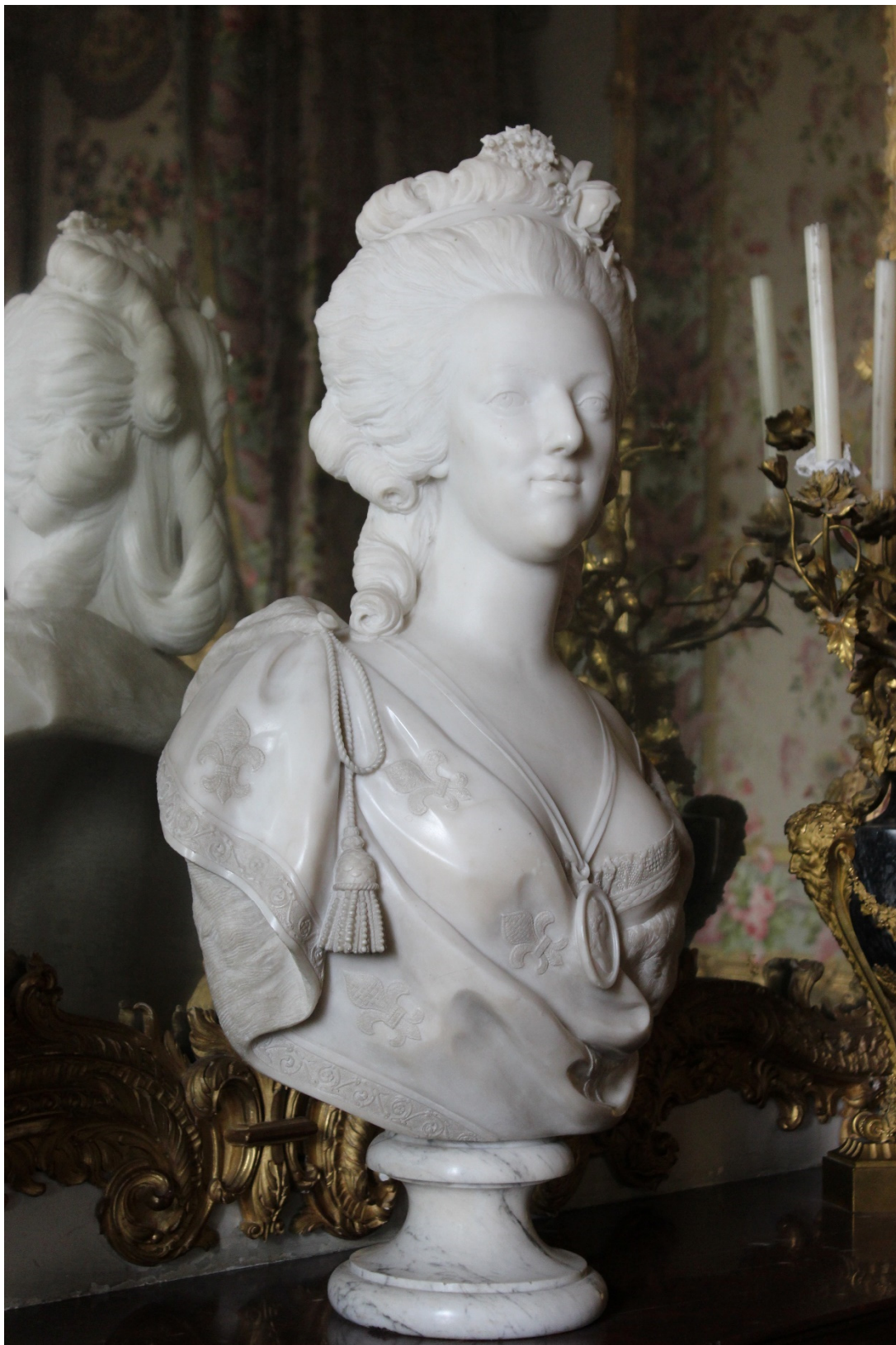
Figure 5. Félix Lecomte, Marie-Antoinette, 1783, marble, h. 86 cm, Versailles, Château de Versailles et de Trianon. https://commons.wikimedia.org/wiki/File:Palace_of_Versailles_19.jpg (retrieve 13 February 2022).