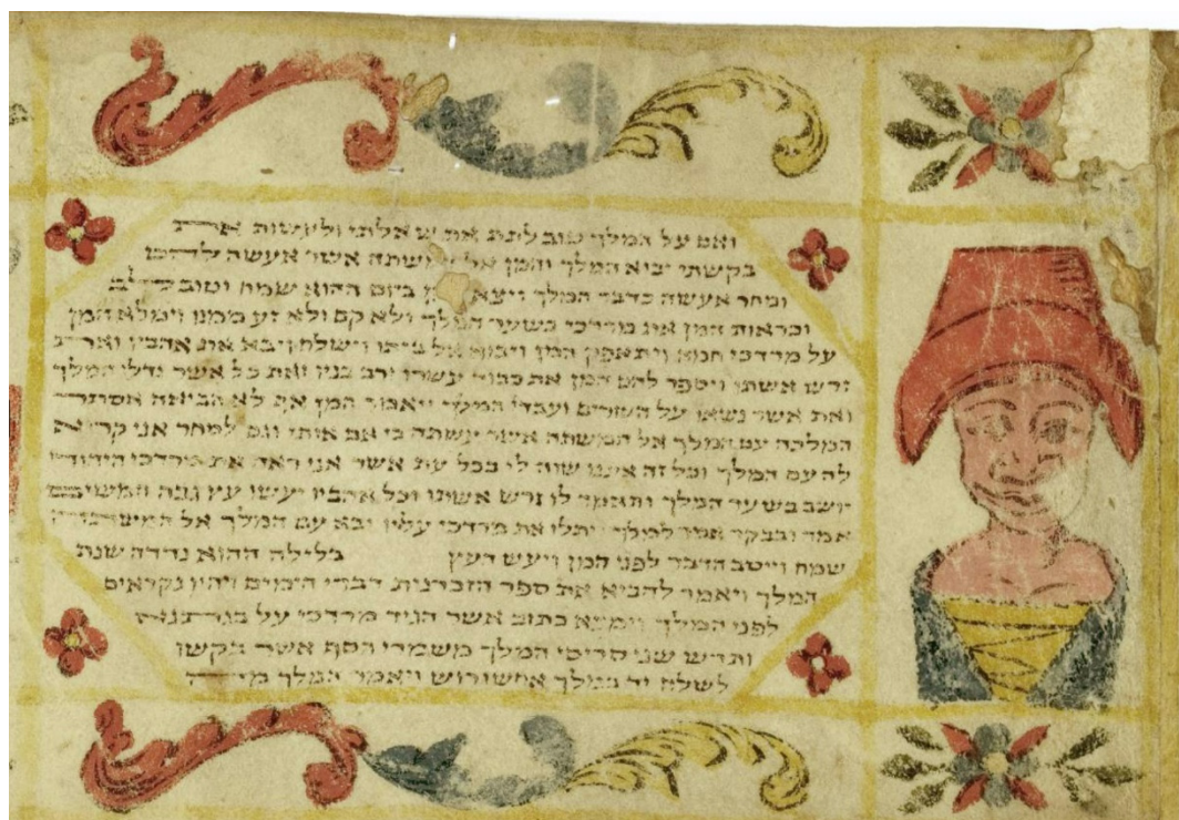
Figure 3. Zeresh, Esther scroll from the Braginsky Collections (Braginsky Collection Megillah 7), Alsace, the second half of the eighteenth century.

The image alongside the text that mentions Zeresh, Haman's wife, is of a woman wearing a large, red hat and a blue and yellow dress that shows deep cleavage (Figure 3). Her facial features are those of an elderly woman and are almost grotesque, 10 with a large nose and a smile that takes up almost a third of her face. The next scene shows a large house with red brick roof and a tall chimney. The depiction after that shows an owl with a white toupee and a ruff typical of the eighteenth century. 11 Next to the text of Chapter 8, which tells about King Ahasuerus extending the golden scepter to Esther, we see Queen Esther as a bust, sporting an elaborate coiffure, 12 deep cleavage, and a beneficent smile (Figure 4). Here I stress that, as opposed to almost all other figures in the scroll, this woman figure is depicted as a bust, and I argue that this choice of depiction is meaningful in the historical and social context at the time that this scroll was written.