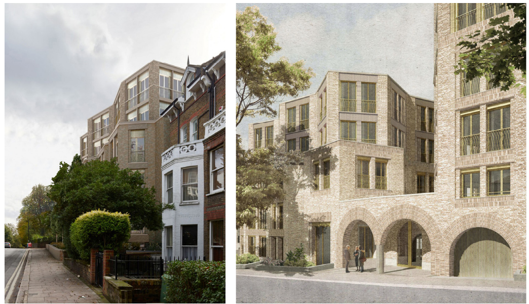
Figure 2. Mansion Block, Hampstead, Sergison Bates, 2017. © Sergison Bates.

Access to the dwellings is through a sequence of spaces conceived as a sum of scenarios that represent the moment of arriving home. The emphasis on this transition between the public and private sphere can be seen at the moment when the domination of the street ends and the home's power is yet to begin. The idea of comfort conveyed by homes is related to this sum of layers; protective layers such as the sum of successive thresholds between the street and the dwelling—which are required in order to feel at home. Sometimes, the danger of comfort lies in an excessive isolation that leads to loss of feeling. To deal with this, Sergison Bates adds elements connected to the known in each transition area: “familiar” doors, windows and handles that trigger and heighten our visual associations. The idea of comfort, therefore, is not only based on a warm, safe setting, but also on the reproduction of the known and the familiar; a comfort that is neither purely physical nor totally psychological.