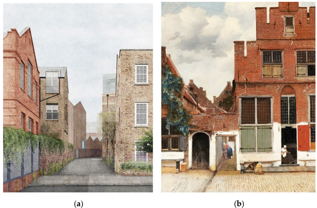
Figure 1. (a) Arts and Wellbeing Centre, London, Sergison Bates, c. 2018. © Sergison Bates. (b) The Little Street , Johannes Vermeer, 1658. Oil on canvas. Rijksmuseum, Amsterdam, NL. (Image in the public domain).

The image that Sergison Bates presented also links the proposal with realism and brings to mind the painting by Johannes Vermeer The Little Street , c. 1658 (Figure 1). The visual culture historian Martin Jay states that 17th- and 18th-century painting in the Netherlands should be more strongly connected to the empirical experience of observation and less to the Cartesian look, in other words, to a reproduction of the vision rather than to an expression of prior knowledge. 12 In Vermeer's painting, the point of view is one of many, a specific scene, far removed from a privileged point of view and without any centrality whatsoever. Neither the little street nor the hallway extends to any depth and the image appears to be more a reaction to something that has aroused our interest than the precise organization of a representation space. Sergison Bates' way of seeing the image not only develops a specific urban concept, but it also triggers a very precise cultural association.