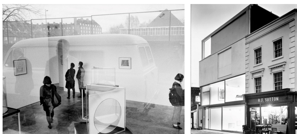
Figure 4. Lisson Gallery, London, 1992, Tony Fretton.

The photography of the façade published in 1992 (Figure 4) is reminiscent of the act of walking along the street on a cold, clear morning. It underlines an aspect that is connected to the relationships that a building establishes with its surroundings and, above all, with the life that is played out both inside and outside and that influences our perception of the work. The photography shows the lower room, below street level, through a window that reflects the objects. As with the space on the upper floor, this is something public, exposed to view. The façade is limited to what is essential: two doors, one for the residence and one for the gallery, and sliding windows that can be opened to introduce larger works. “In essence, the facade is made up of the activities inside and the reflections of the surrounding trees, buildings and sky” (Fretton 2005, p. 20).