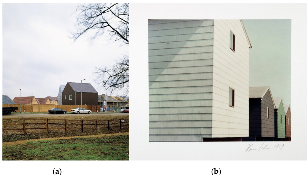
Figure 3. (a) Suburban Housing, Stevenage, 2000, Sergison Bates. © Sergison Bates. (b) Homes for America, Dan Graham, 1966. © Dan Graham.

This revision of the image of the British suburb is in tune with the look presented by the American artist Dan Graham in his famous Homes for America . Graham photographed a series of dwellings in the suburbs of New Jersey on different dates emphasizing the sequenced and automated nature of this extensive urban planning (Moure 2009). The influence of realism is obvious, while Graham also shows a clear artistic intent. These images are closely connected to conceptual and minimalist art through the emphasis on sequenced repetitions, simplicity, the use of industrial materials in construction and the precise geometry of the forms. The reference to Sol LeWitt is accentuated in the design of dwellings as a series of cubes, as works that seem to come from one single mould and emphasize one single formal approach. 13