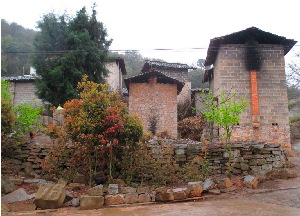
Figure 11. Nuohei tobacco drying towers.