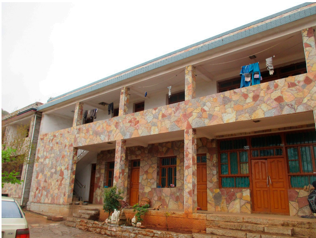
Figure 14. Nuohei modern building.

Glazing and window openings are more evenly distributed than in Damoyu, though still limited in many of the older buildings. The slope of the village towards the lake tends to encourage windows on the more open east-facing façade, and though the more recent modern buildings have more restrained window sizes (by comparison with Damoyu), they are clearly recognizable as being from a different time period than the historic stone dwellings (see Figure 14). There was little or no evidence of modern heating or cooling systems.