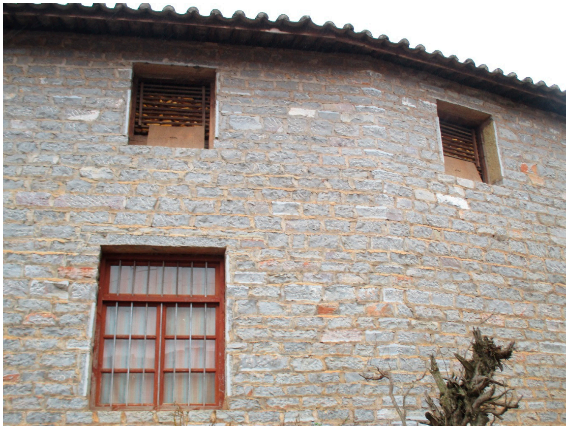
Figure 12. Nuohei maize storage on upper floors.

The village is prosperous with places to eat and buy products, as well as places to stay, each of which are advertised on the posters in the main car parking area and on numerous signs through the village in both Chinese and English. There is a propensity of motorized transport (though many vehicles are those designed for agricultural purposes), and there is a thriving village school. The village emphasizes traditional development focusing on preservation; it follows strict guidelines for the protection and management of intangible cultural heritage and of the environment. It was declared a region for the protection of the Sani Yi culture by the state in 2006.