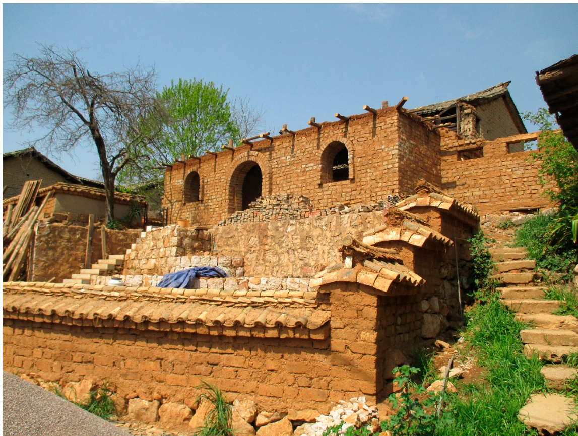
Figure 8. Damoyu building renovation project.

Analysis of the traditional buildings shows internal layouts to have the majority of windows and openings facing in one orientation. The majority face to the east given the slope of the land and towards the main surfaced roads through the village. Many of the new dwellings face from the other side of the road towards the west and have rather more windows. The use of modern materials of concrete and bricks seems to have promoted the adoption of large glazed openings in a number of cases, also clearly seen in Figure 4. From the on-site survey of both new and old dwelling construction, it appears that improvements to performance might be found relatively easily if more attention were focused on window positioning, size and function, taking account of exterior features and the internal space needs.