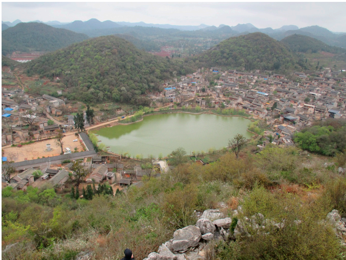
Figure 9. Nuohei: view of the village.

The name Nuohei derives from the words for “monkey/ape” and “pool”, and the village museum suggests the interpretation should be “a scene in which apes lead happy lives around the pond” [24]. A prominent feature of the village is its lake on the east side of the village centre and towards which many of the properties face; see Figure 9. Figure 10 shows a group of typical dwellings. Historically, the key agricultural products associated with the village have been tobacco and maize, and this has impacted the buildings and structures to be found there. There are numerous tall tower-like windowless structures, which are used for drying tobacco leaves (Figure 11), and spaces for storing maize can be found almost everywhere, both on the outside and the inside of buildings (Figure 12 shows the maize against shutters of upper floor windows).