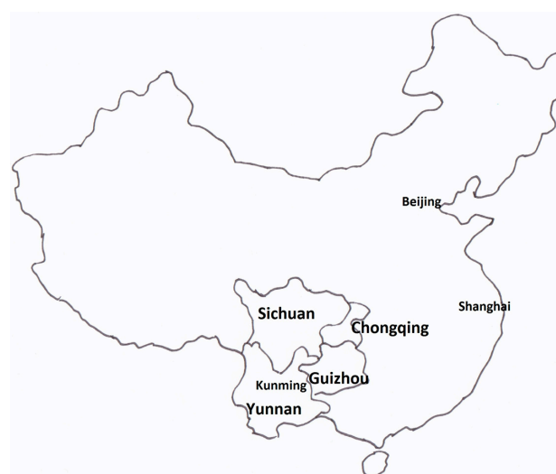
Figure 1. Map of China showing the provinces of interest, including Yunnan.

The focus area for the larger research study of which this paper reports a part is southwest China, the provinces of Yunnan, Guizhou and Sichuan. Also associated is the city of Chongqing and its environs (which is currently one of China's four centrally-controlled municipalities, but which was formerly part of Sichuan). The outline of the location is shown in Figure 1.