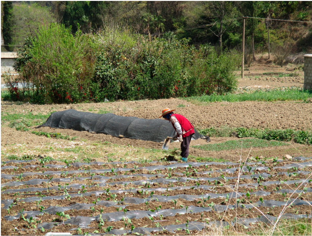
Figure 6. Damoyu older resident working the agricultural land.