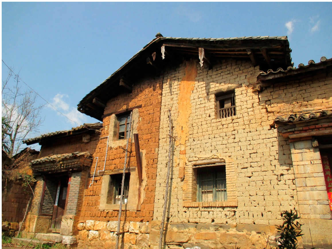
Figure 3. Damoyu traditional construction dwelling.

As a symptom of the loss of day-to-day residents, it seems that the tending of the agricultural land is now often taken on by the older generation (Figure 6). It is clear from casual inspection that many of the older traditional buildings have unmet maintenance needs, though many are habitable on a basic level. The deterioration of the adobe brick structure and ingress of water seem to be the major difficulties. Figure 7 shows some of the dwellings exhibiting deterioration, and Figure 8 shows a property undergoing renovation using some of the traditional techniques.