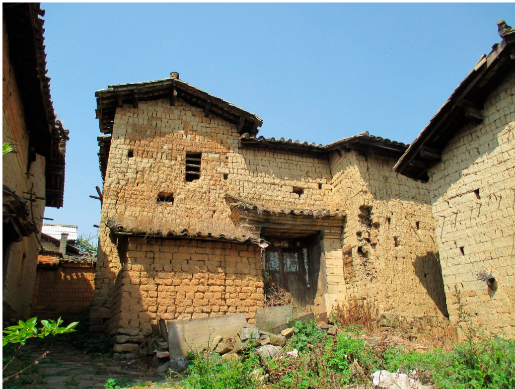
Figure 7. Damoyu deteriorating building.