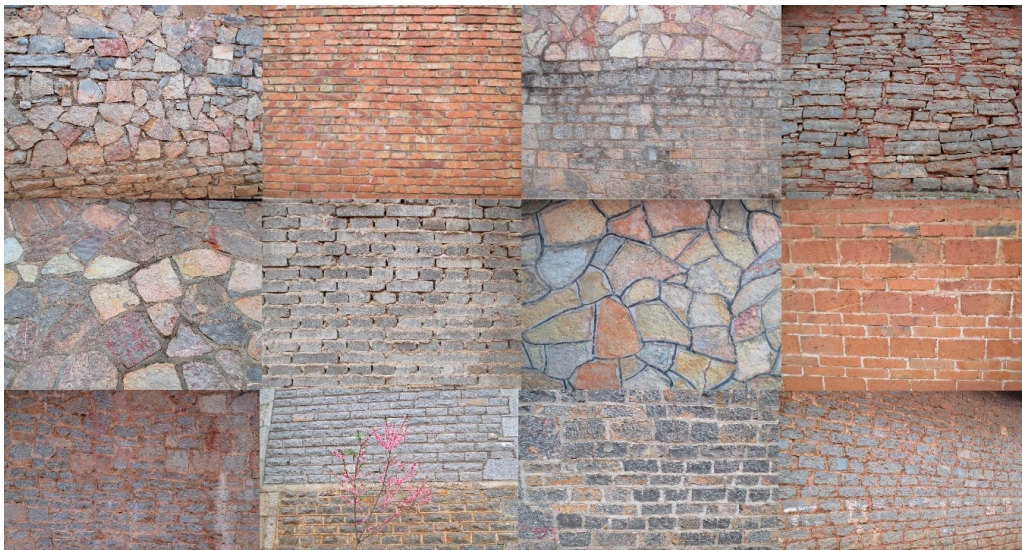
Figure 13. Nuohei: collage of twelve different wall constructions.

Glazing and window openings are more evenly distributed than in Damoyu, though still limited in many of the older buildings. The slope of the village towards the lake tends to encourage windows on the more open east-facing façade, and though the more recent modern buildings have more restrained window sizes (by comparison with Damoyu), they are clearly recognizable as being from a different time period than the historic stone dwellings (see Figure 14). There was little or no evidence of modern heating or cooling systems.