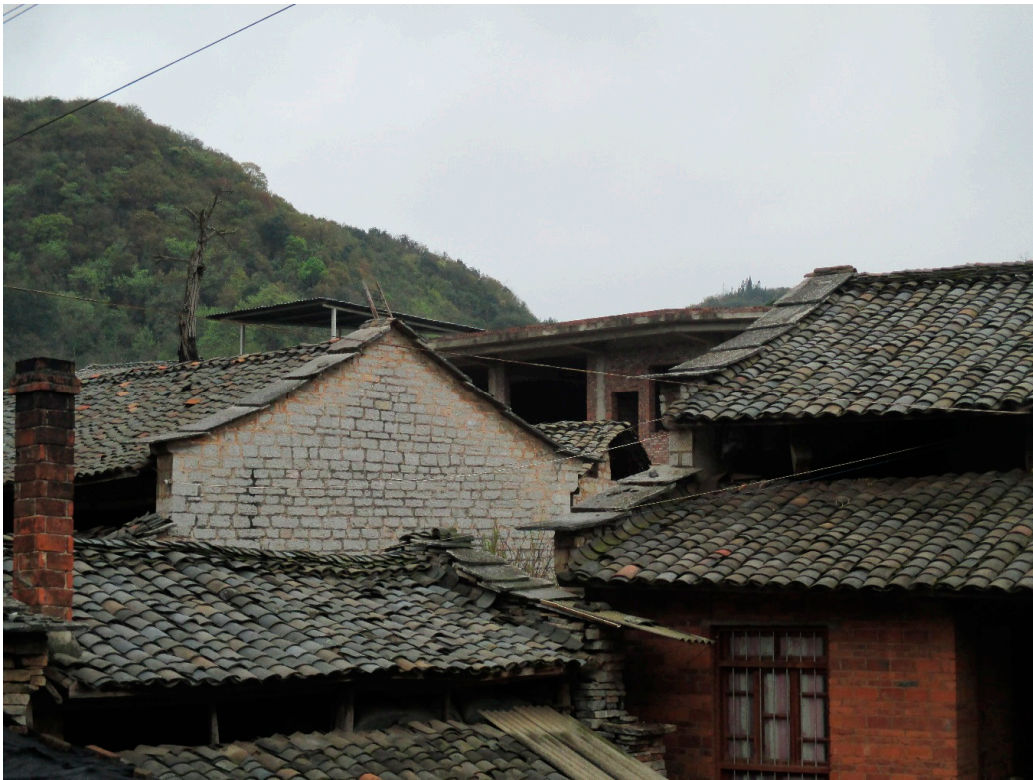
Figure 10. Nuohei traditional stone dwellings.