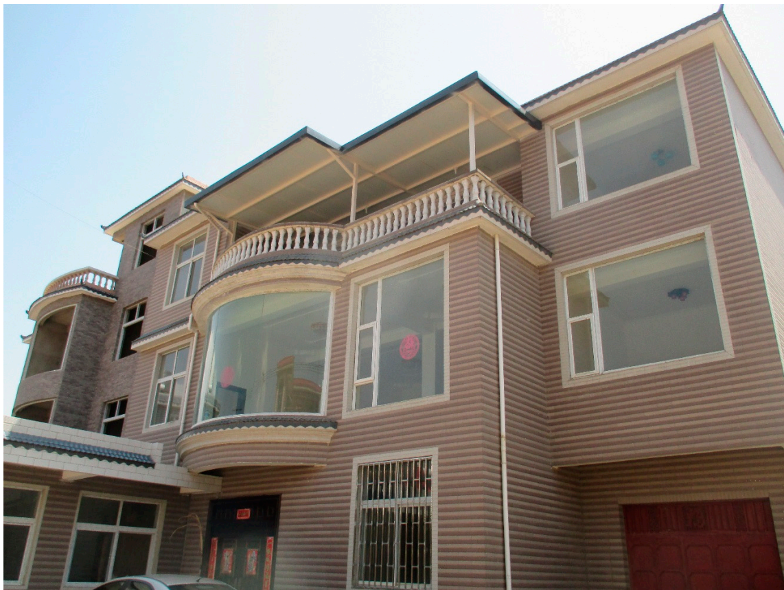
Figure 4. Damoyu new construction dwelling.