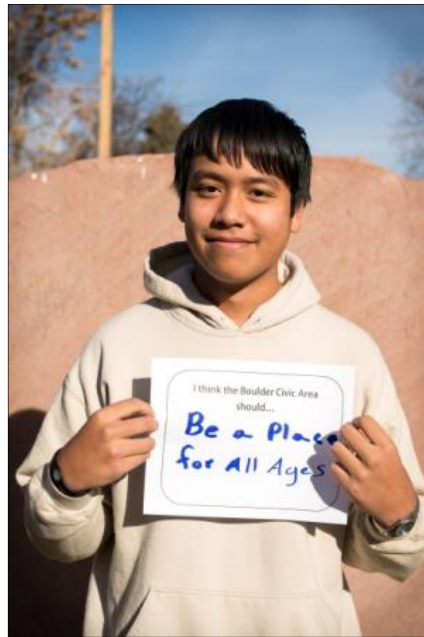
Figure 14. An AVID student with his vision for the Boulder Civic Area to “be a place for all ages”.

there. Youth repeatedly expressed a desire for more places to hang out, both indoors and out. This desire was expressed by the Action Groups, the teen mothers, and in a variety of forms since. The Civic Area provided a perfect opportunity to not only assess existing conditions within Boulder, but also to begin to imagine a different world, one that would be welcoming to people of all ages and cultures (Figure 14). When youth were invited to reimagine this area in this way, they became engaged.