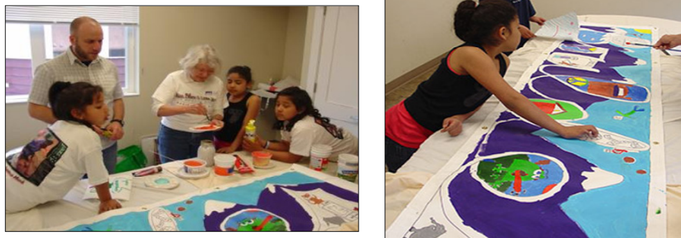
Figure 1. “Dreamers” and the facilitating artist painting a banner in the after school program at Manhattan Middle School.

to draw pictures. The artist then compiled their ideas and drawings into a single banner, which the youth painted (Figure 1). Youth were surprised and excited by this project because no one had ever asked them questions about their community before. It gave them an opportunity to reflect about their community and themselves and see that people valued their culture and ideas. The murals hung in the Boulder Museum of Contemporary Art, the Boulder Creek Festival, and several GUB events.