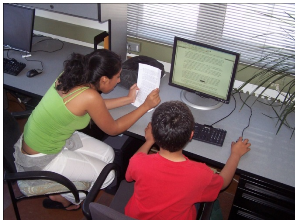
Figure 3. A Children, Youth and Environments Center (CYE) intern and a Boulder youth developing the narrative for a digital story at the CYE Center.

GUB also worked with an AVID class at Boulder High School where 10th graders created digital stories to describe what they wanted for their communities. AVID (Advancement Via Individual Determination) is a nationwide program to prepare students for higher education. The program works in schools, focusing on the “least served students in the academic middle” [21]. Many students in the AVID class were surprised to learn that their city, the local university and others cared about their opinions. One student, an English language learner from Russia, described his desire for a BMX bike park in Boulder that would help teens stay out of trouble and engage in pro-social activities. Two years later, he reflected that creating a digital story was the most impactful project of his education because he learned that his voice mattered.