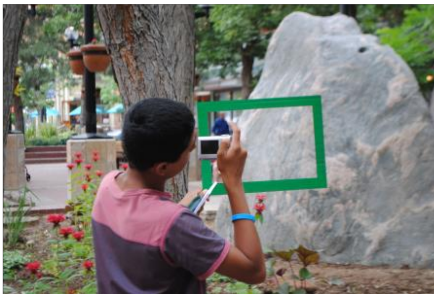
Figure 5. A "Dreamer" using photovoice to document positive public spaces in Boulder.