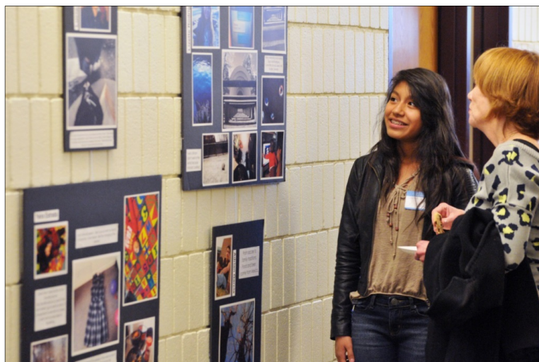
Figure 13. A YSI youth sharing her photographs with a visitor to the neighborhood photovoice opening.

Their photographs and ideas were displayed in a month-long exhibit at the North Boulder Recreation Center, where YSI youth meet. The Recreation Center receives approximately 1500 visitors a day, so it is a place of high visibility that can expose many of Boulder's more affluent residents to issues that some of Boulder's youth experience. Initially, youth were hesitant about expressing themselves, but when the project facilitators brought images together for a photo critique, they began to see themselves as artists with something to say. Through a series of prompts, they were able to develop a voice that was powerful and meaningful. At the opening event, many shared a sense of pride not just in their images, but also in themselves (Figure 13). By coincidence, one youth had been a participant in the IHAD and YSI photovoice projects and in the Civic Area curriculum. At the photovoice opening, GUB staff noticed that she expressed a new level of confidence and pride. The exhibit prompted feedback from city staff and local teachers to YSI staff and youth themselves about how impressed they were with the quality and content of the project.