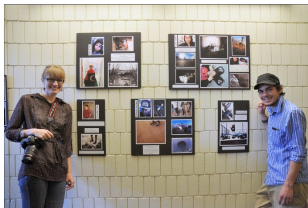
Figure 12. Youth Services Initiative (YSI) photovoice facilitators, a professional photographer and GUB undergraduate intern from the Program in Environmental Design at the University of Colorado, posing with youth photos.

Many youth had never used a camera before, and many were hesitant to photograph their homes, saying it was boring or there was nothing to show. YSI staff believed that at the beginning, many youth felt ashamed and did not realize that other youth lived as they did, or that the project could be an opportunity to say what they wanted to change in their lives. As they worked, they began to express their dreams, including career aspirations and their desire to go to college, to eliminate poverty, and to have greater agency over their lives. They shared the importance of family, friends, and connections to home in both the United States and Mexico.