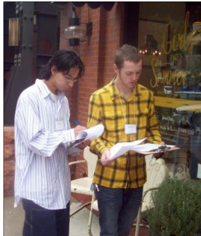
Figure 2. Business Action Group collecting data on youth-friendly businesses (photo courtesy of Growing Up Boulder (GUB)).

The Nightlife Action Group was the most challenging to implement due to inconsistent youth participation in the group. GUB worked with the YMCA Teen Advisory Board and a few other high school students who were invested in this issue. The YMCA group was happy to consult on this issue but not ready to commit to extended research. The independent high school students met several times to design, administer and analyze the results of a survey of existing and desired nightlife opportunities, how much students could spend on events, how they want to find out about activities, and the modes of transportation they use in their daily lives. More than 500 Boulder high school students completed the survey, which resulted in a report that garnered the attention of city council members, led to the development of monthly teen nightlife activities at the YMCA, and led a computer programming class at the local vocational high school to develop a prototype of an information portal for teen activities and topics.