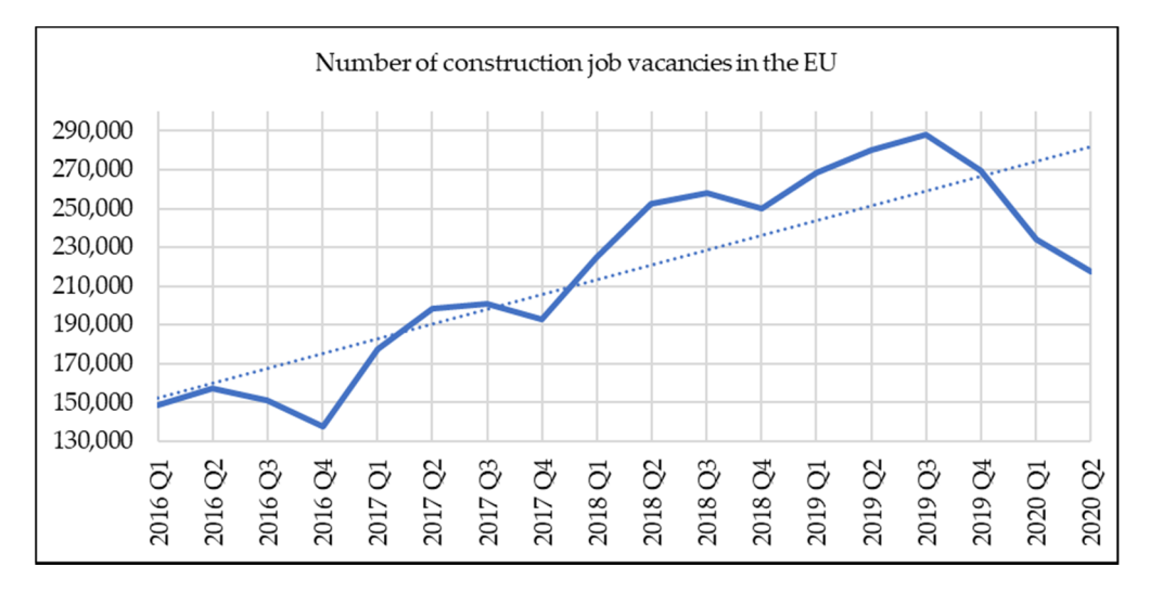
Figure 2. Quarterly trend of construction job vacancies (in thousands) in the EU (the figure is structured by authors upon open-source data collected from [71]).

Migrant construction workers are adaptive to the uncertain working environment and they expect to maintain their regular immigration status by exploiting the available opportunities. In Italy, migrant workers have been granted regular stay-permits through annual quota rates and, since 1998, bilateral agreements between Italy and third countries have defined the quota-based migration schemes [72].