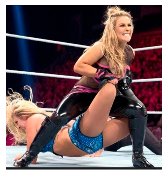
Figure 8. Natalya (female wrestler of WWE).