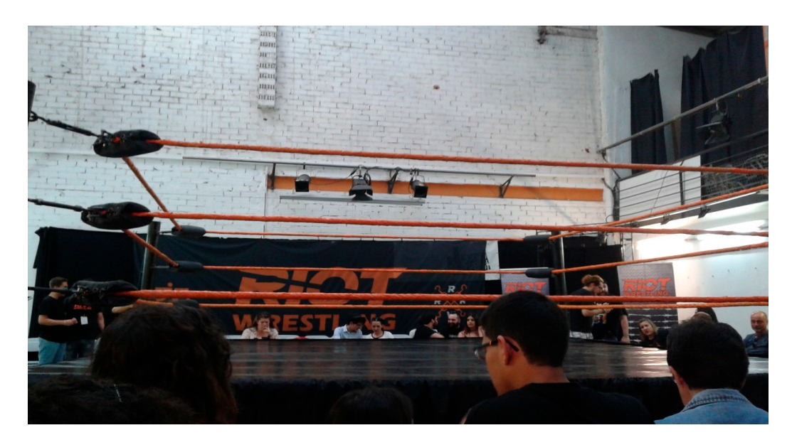
Figure 4. This is the venue used for the majority of the Riot Wrestling shows.

Conversely, the Riot Wrestling School<sup>11</sup> is located near the Clot metro station in Barcelona and its shows are held at another civic centre called Ateneu del Clot (Figure 4). Riot Wrestling also promotes a monthly wrestling show in a cocktail bar called Dixi724 (in Barcelona). Since 2014, this school has also taken part in annual events such as the Psychobilly Meeting, FanCon and the Salón del Manga, which are independent events organised in Barcelona. They use these events to publicise the school, increasing interest in becoming involved in wrestling, as well as its visibility in Barcelona.