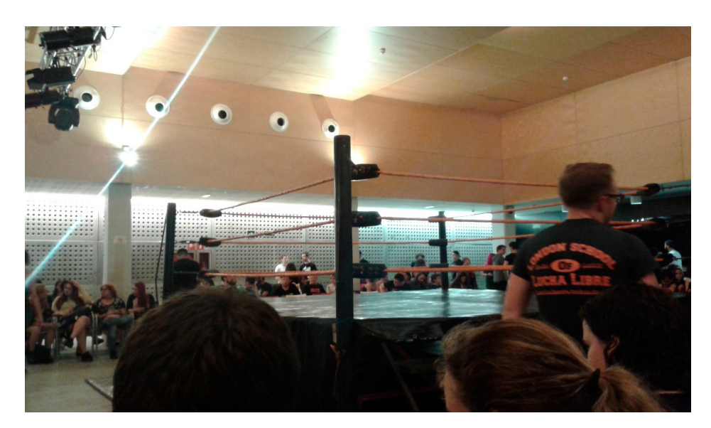
Figure 3. This was the venue where the Spanish Pro Wrestling shows were held. It is also sometimes used as a show venue by the Riot Wrestling School.

Given the above, I will now go into more detail about the schools themselves in order to provide additional context. The first one is the Spanish Pro Wrestling School<sup>10</sup> (Figure 3) that used to be located in Hospitalet de Llobregat, with shows held at the Espai Jove la Fontana civic centre (Barcelona).