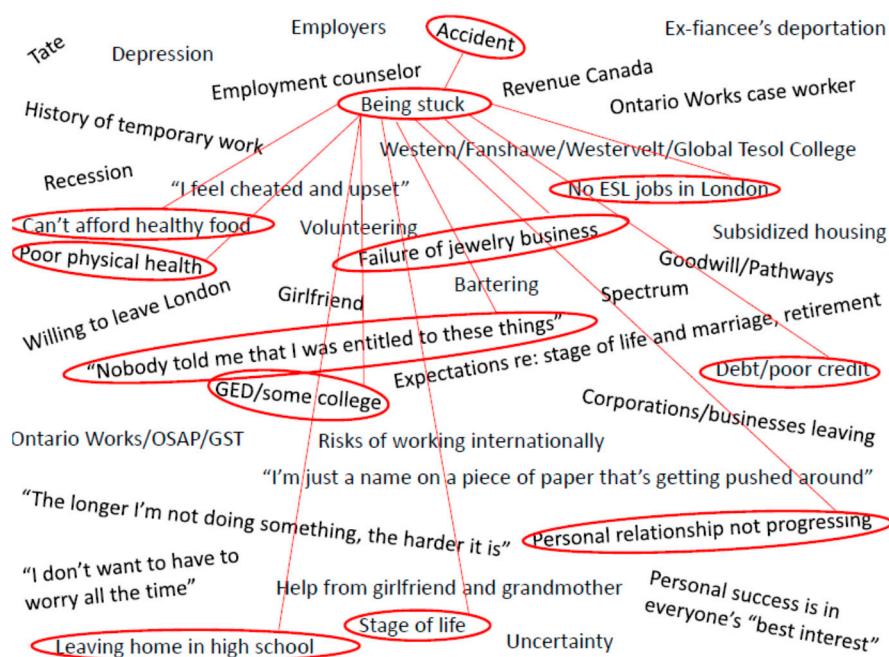
Figure 3. Relational situational map—Tate.

In the Canadian context, Tate was a single male in his 30s who had been without a formal paid job for about a year. Previously, he had held various temporary, entry-level, largely physically oriented jobs which had become increasingly less available and feasible as he aged and experienced several health problems. His situation of being long-term unemployed is illustrated in his relational situational map (Figure 3) with key elements highlighted in his ordered situational map (Figure 4).