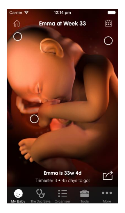
Figure 1. Screenshot from Sprout app which reveals a very humanised image of a foetus who appears to be sleeping and sucking its thumb. Despite not being born yet, the foetus has already been named Emma.

The Sprout app also includes a "Doctor Visit Planner" which encourages the user to take up the role of the expert patient with functions such as "Create a list of questions for your doctor" and "Record your doctor's answers" [45]. The "Doctor Says" section encourages healthy behaviour via different recommendations which relate to diet, exercise, symptoms and concerns. Miriam Stoppard's app [37] also provides information on "Looking after your body and mind" and detailed information on diet which is presented as primarily for the sake of the baby, rather than the mother. This section of the app is entitled: "Eating for my baby" and presents healthiness as central to "being-for-intimate-others". By connecting the app's functions to medical authority and expertise meaningful connections are made between medicine and the organisation of the body. Ettorre [7] (p. 246) developed the term "reproductive asceticism" to represent the ways in which pregnant women are expected to manage, monitor and control their bodies for the sake of the foetus. I argue that comprehensive pregnancy apps like this one represent a digitalised organisation of reproductive asceticism.