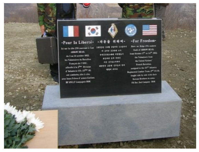
French, Korean and US flags are displayed alongside, with the UNO Symbol and French battalion insignia. December 2008.