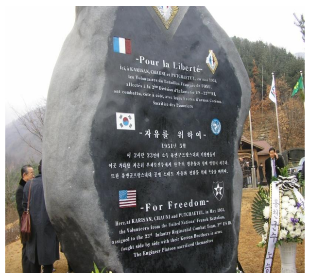
Figure 4. The Puchaetŭl Monument.

A collection of steles and monuments, explaining briefly the conditions of the fight and the French Army's participation in the war, under the motto "For Freedom" (Pour la libert é, Jayu-rŭl wihayŏ ) (Figure 4), written in the three languages, with the UNO, French, South-Korean and US flags, the insignia of the French battalion and also the badge of the 2nd US Infantry division, was erected.