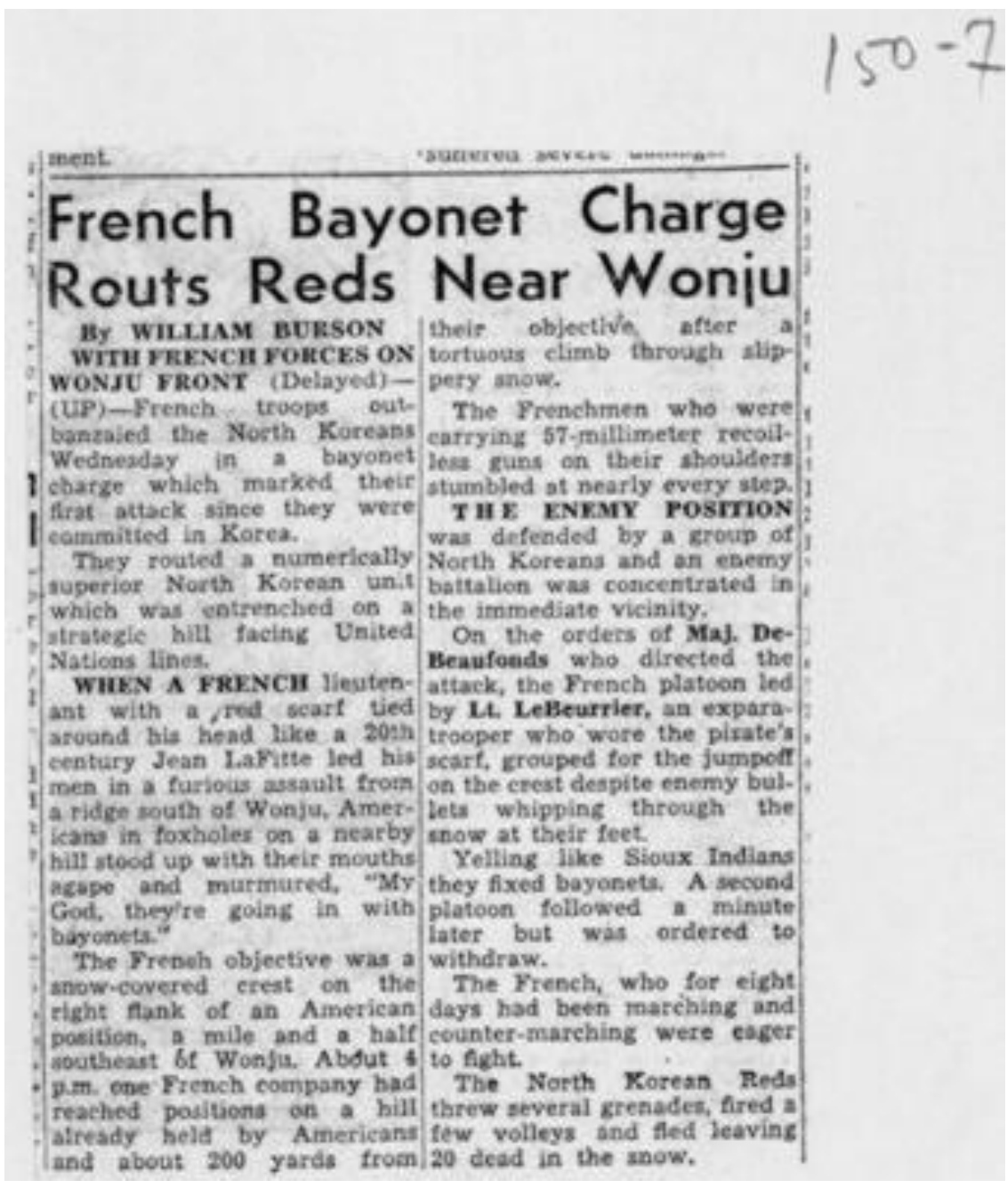
Figure 2. Stars & Stripes Pacific Edition article, January 1951.