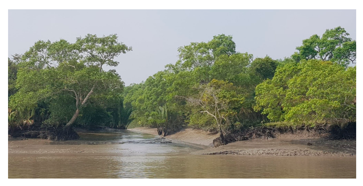
Figure 1. Image of the mangrove forest, the Sundarbans.

Corporation (NTPC)<sup>3</sup> and the Bangladesh Power Development Board (BPDB)<sup>4</sup> [1]. The proposed power plant project is situated only 14 km north of the world's largest mangrove forest, the Sundarbans (Figure 2). Nevertheless, the current Bangladesh government believes that the proposed plant will be the country's largest electricity-generating power plant, incorporating modern and efficient technology by importing coal of high calorific value (average gross calorific value [GCV] 5700 kcal/kg, low sulfur, and low ash content) [2]. The project, with its two phases of construction and shelving, is projected for 2022. The financing sources of this power plant are the NTPC and the BPDB that are jointly giving 30%, along with the Exim Bank of India, that is investing 70% of the total cost [3]. Conversely, scientists and environmentalists increasingly suspect that this harmful initiative will destroy the whole mangrove forest and its unique ecosystem. This project already violates the environmental impact assessment (EIA) guidelines for coal-based thermal power plants. Most of the impacts of this coal-fired power plant, when investigated, have been found to be harmful and irreversible for biodiversity [4–7].